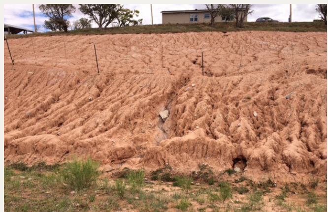
Small channels and gullies along the side of the slope.

Approximately nine to 12 months after site restoration, the site will be inspected to observe and recommend where any maintenance may be required.