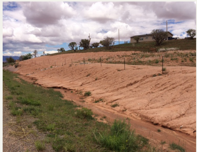
Eroded soil at the base of the slope.

The former Cove Transfer Station #1 is located on non-addressed property in Cove Chapter, Apache County, Arizona (within the Navajo Nation), off of Bureau of Indian Affairs (BIA) Route 33, approximately 40 miles southwest of the community of Shiprock, New Mexico.