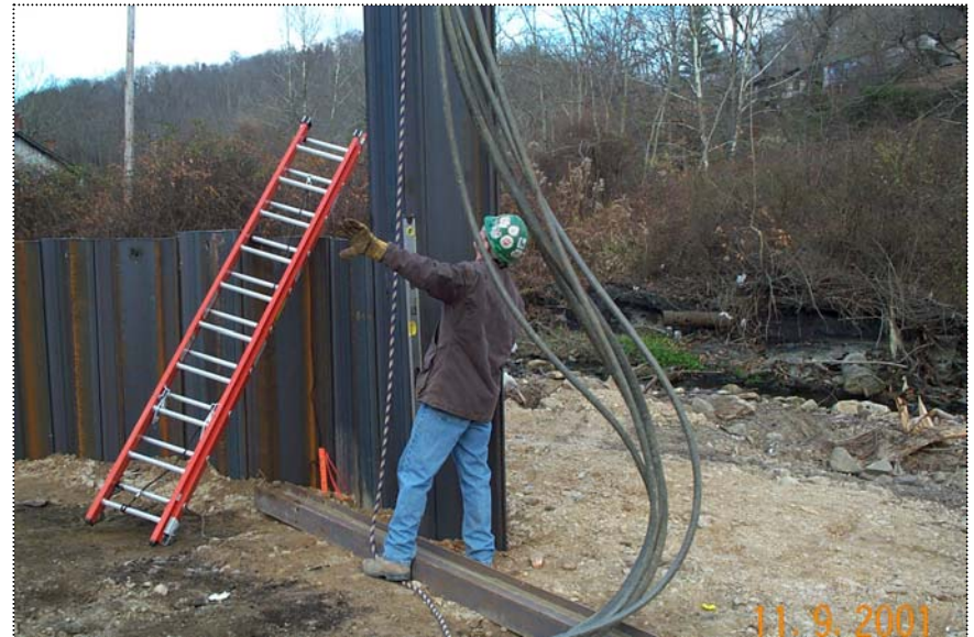
DCP1170 - Ahern personnel directing crane operator to move the boom to plumb the sheet