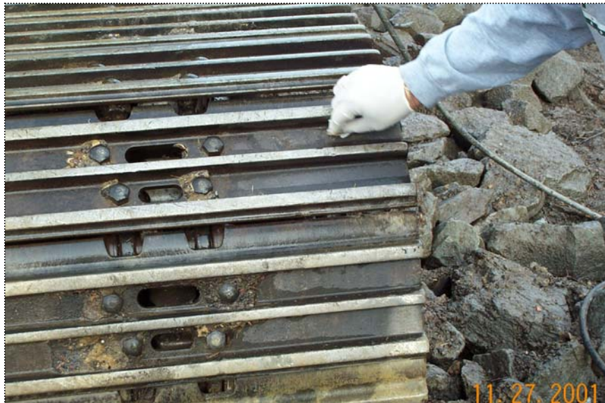
DCP1392 - Pinnacle health and safety swipe testing the track of the track Hoe