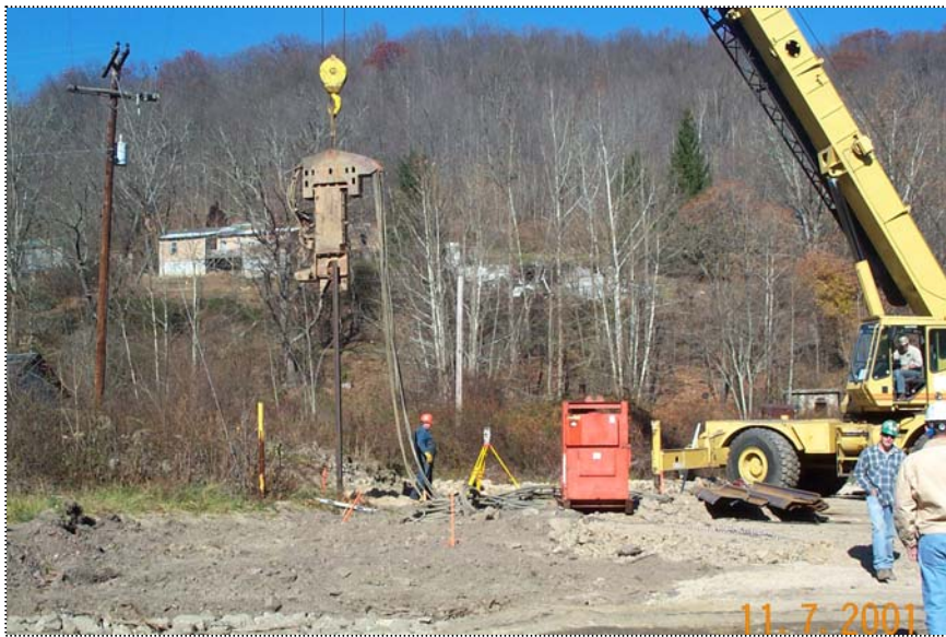
DCP1128 - Ahern personnel stick first sheet