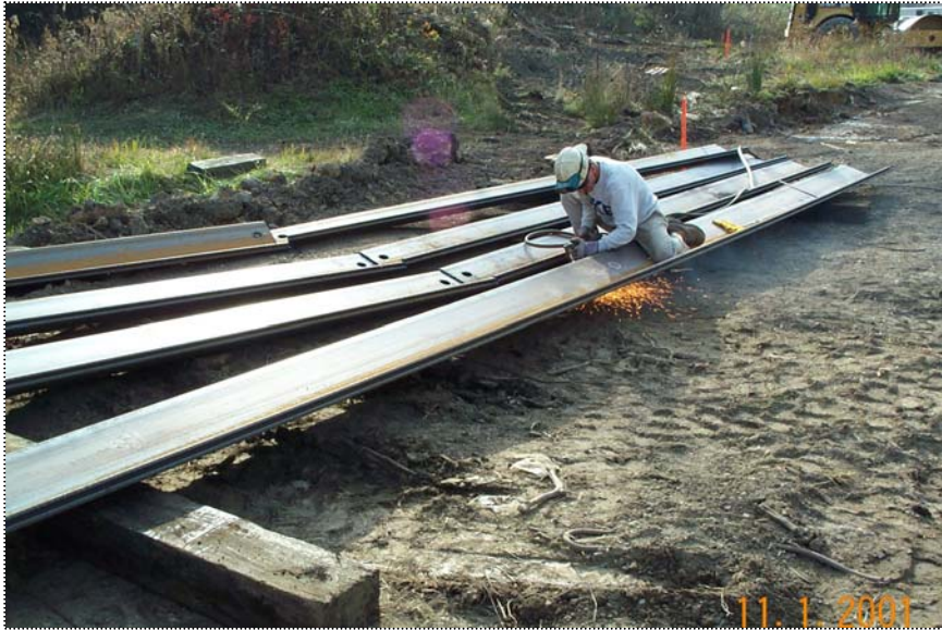
DCP01075 - Ahern personnel cutting 32-foot sheets into 16-foot sheet. Also cutting lifting eyes for driving