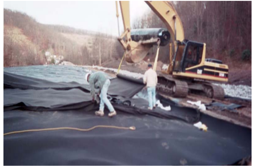
Seaming Liner Sections together