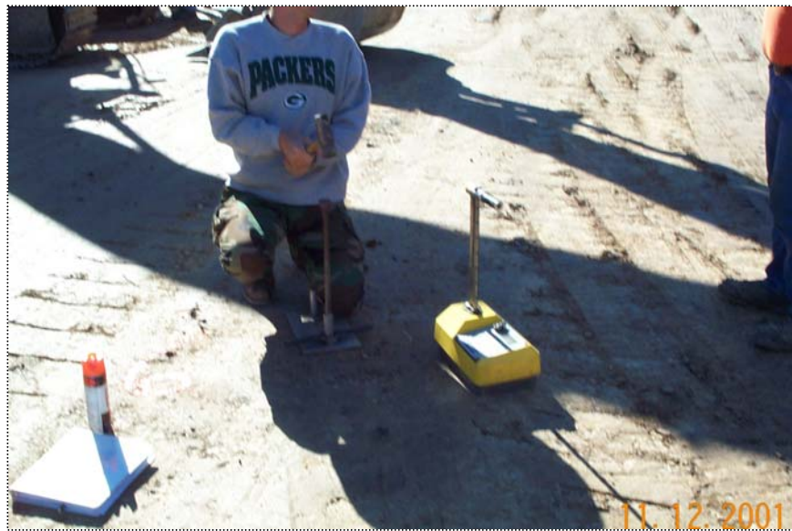
DCP1215 - View of Tech preparing test hole for the nuclear density gage