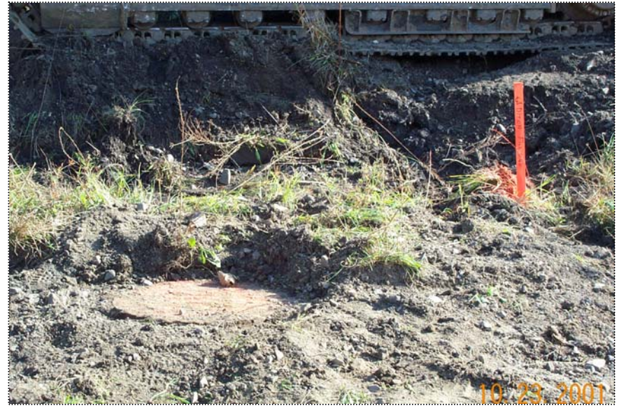
DCP0992 - View of Manhole cover found after looking for several hours