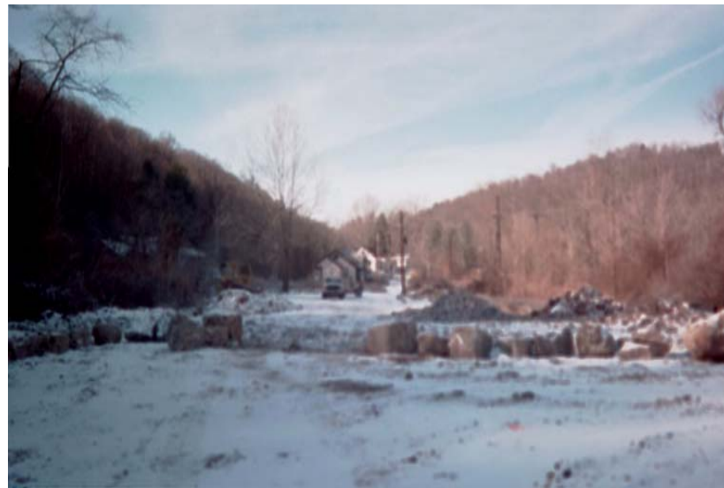
Western Portion of Cap, Shows Barrier