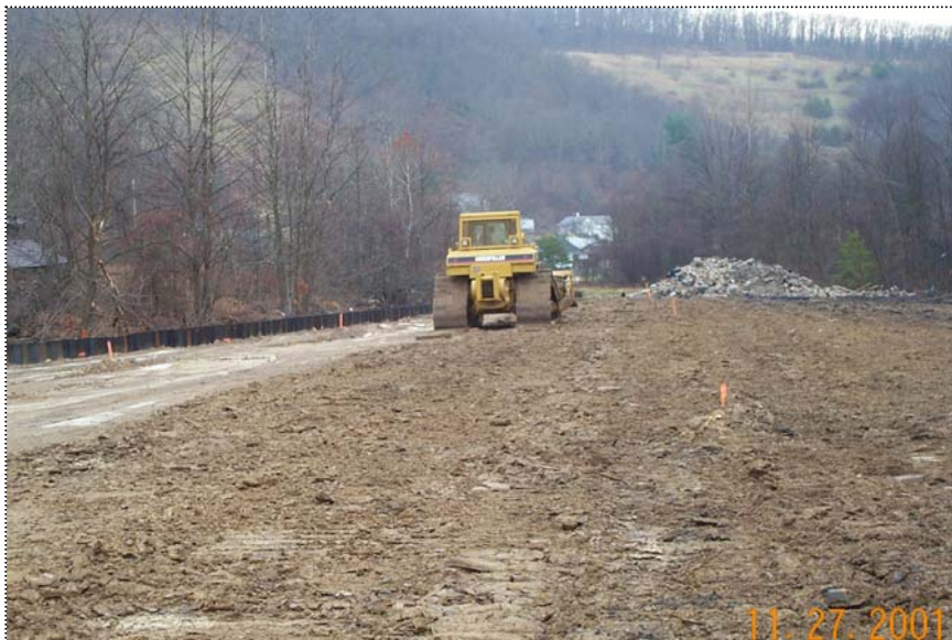
DCP1382 - Dozer tracking/grading the Northern section of the site