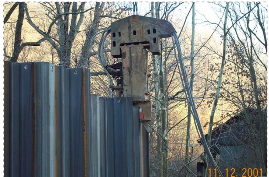
DCP1209 - Close up view of Vibratory hammer clamped to a sheet during driving operations