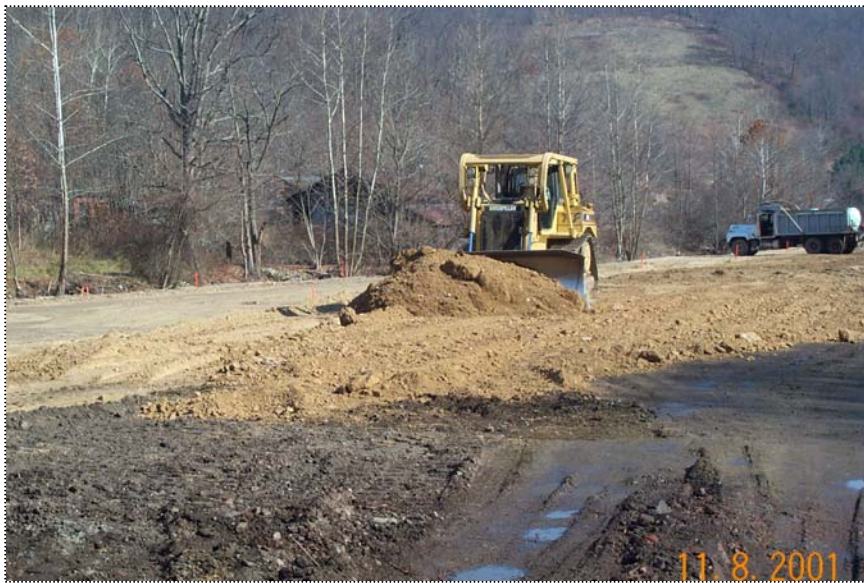
DCP1156 - Dozer spreading sub grade material on south central area of the site