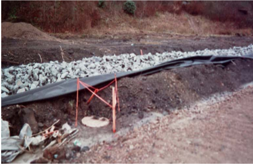
Location of Manhole on Southside