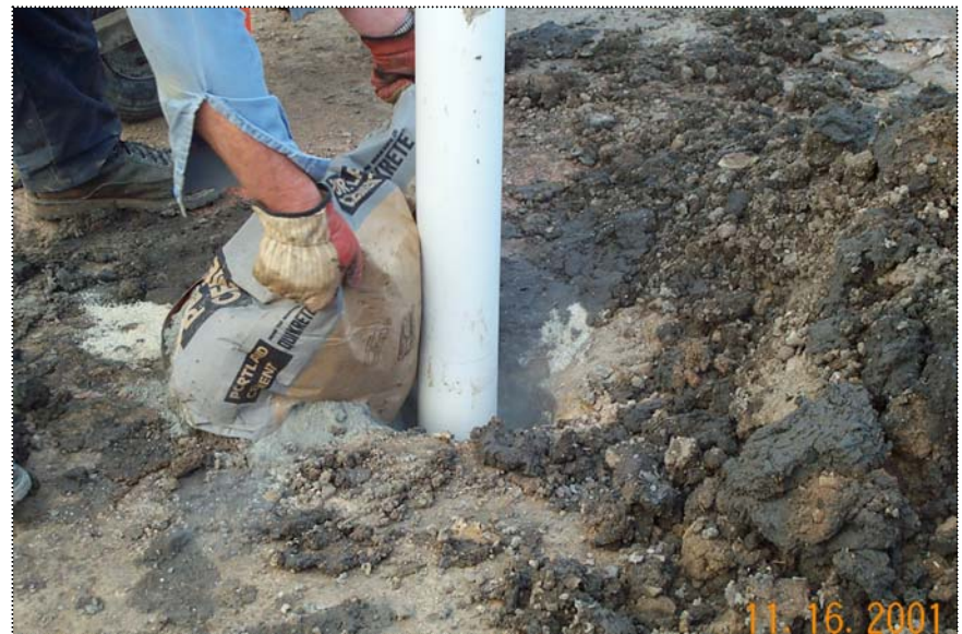
DCP1307 - Triad personnel placing dry cement around SS-12