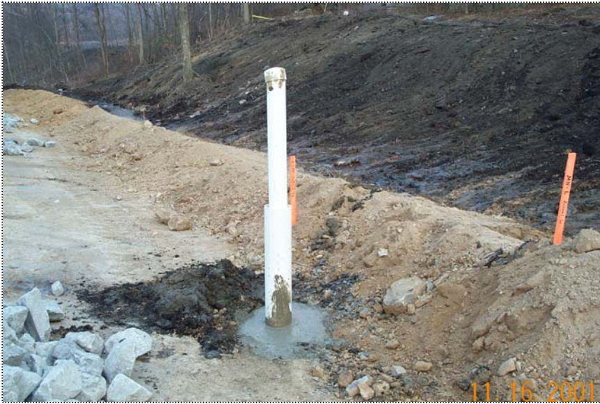
DCP1308 - View of Well MW-12 after installation of 6-inch PVC and concrete