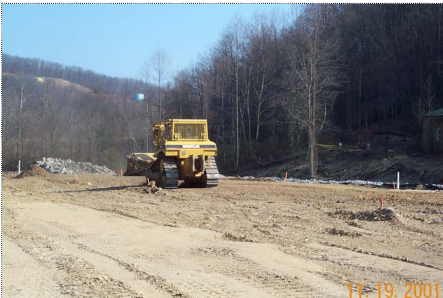
DCP1326 - Dozer scarifying the sub grade, preparing it to receive the first lift of cap material, (Southern half of the site)