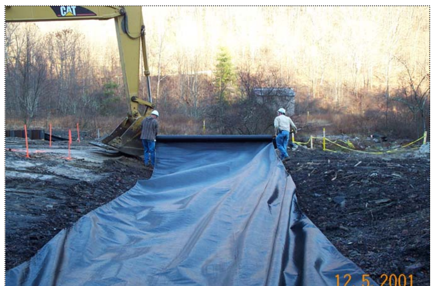
DCP1459 - WasteTron personnel un-rolling the filter fabric for the stone ditch