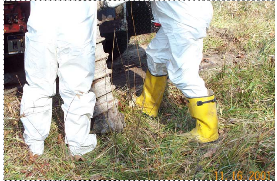
DCP1275 - Triad personnel trying to pull the casing on MW-7