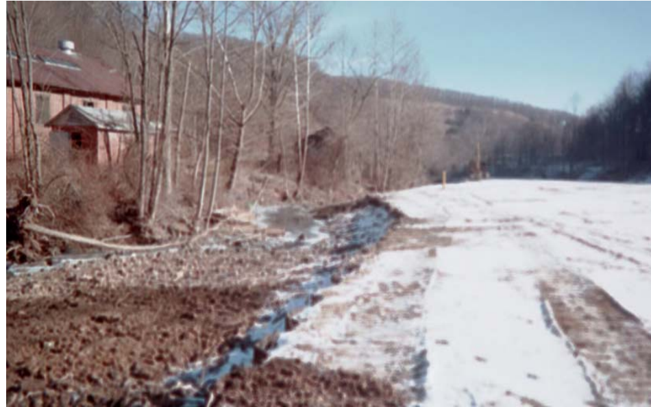
View of Cap and Sheet Pile Wall, looking east