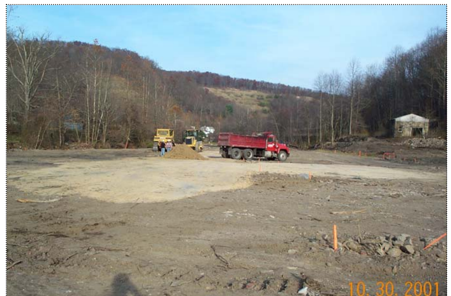
DCP01035 - General view of the area covered this date with sub base material.