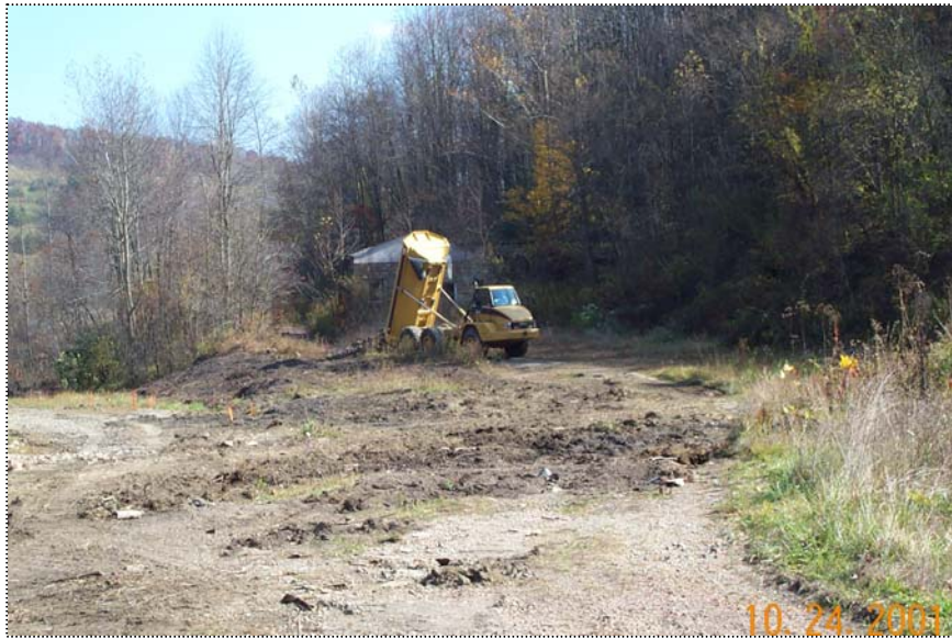
DCP1001 - View of the Rock Truck dumping stone in the new stockpile location