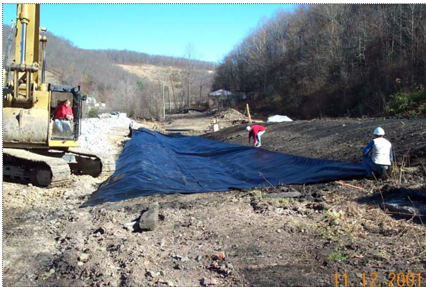
DCP1212 - WasteTron personnel laying filter fabric in the stone ditch. Two pieces were installed to fit across the ditch