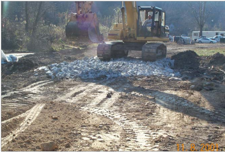
DCP1163 - Track hoe compacting new clean stone on the decon pad