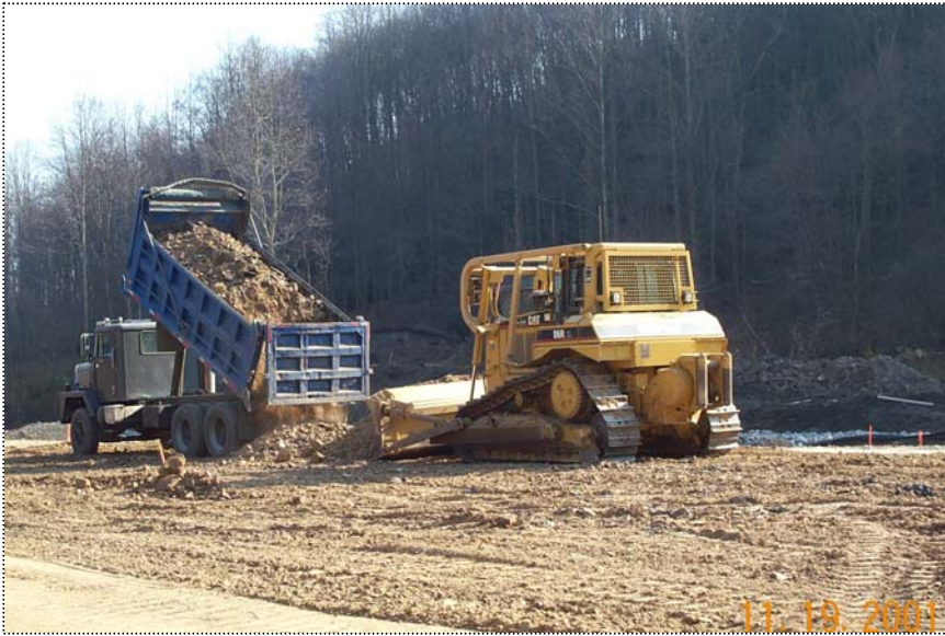
DCP1325 - View of truck dumping cap material in front of the dozer