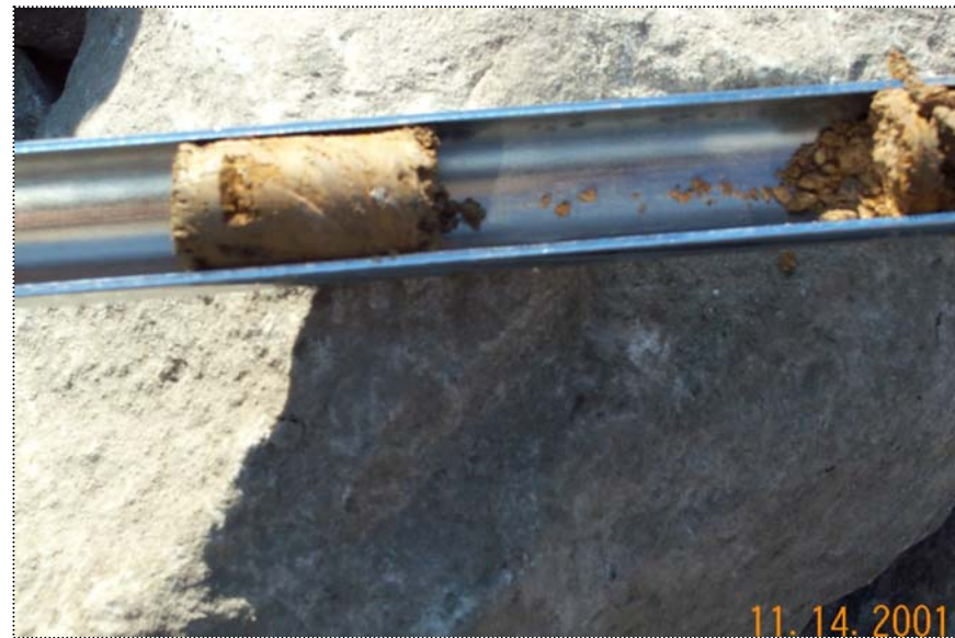
DCP1244 - View of a soil sample taken using a hand split spoon sampler. The ridges shown on the bottom edge are from the sampler