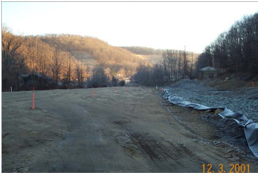
DCP1433 - General view looking downstream at the Southern half of the cap