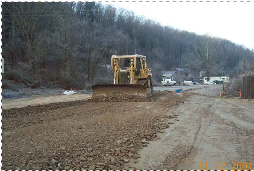
DCP1203 - View of dozer removing frozen soil from the Northwest fill area