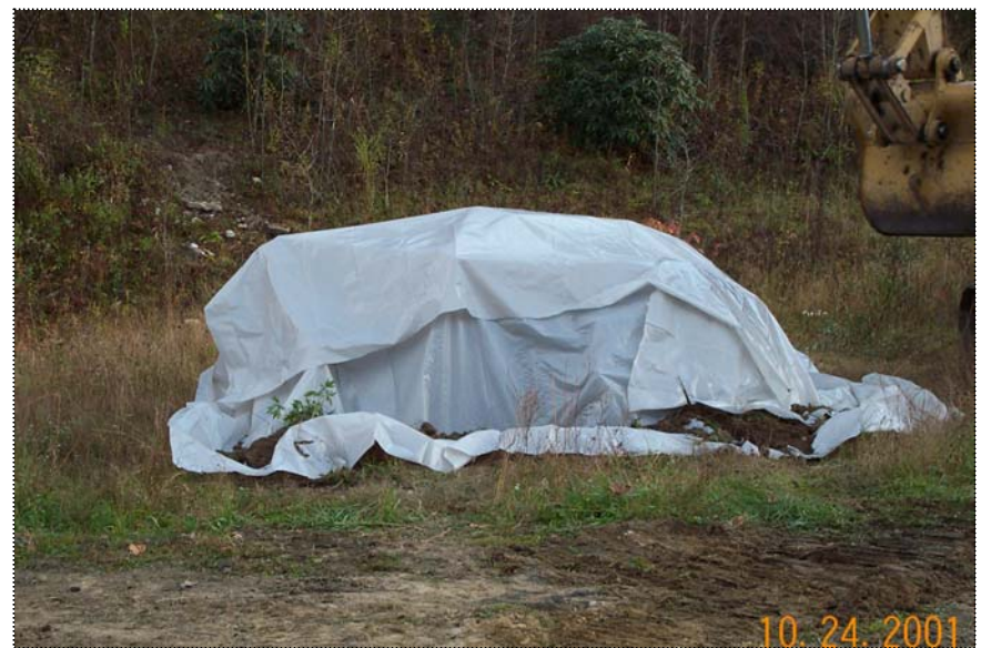
DCP1010 - General view of cell containing the tree roots