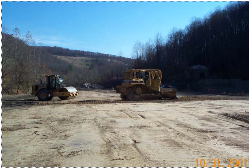
DCP01039 - General view of grading and compaction operations on the sub base Materials