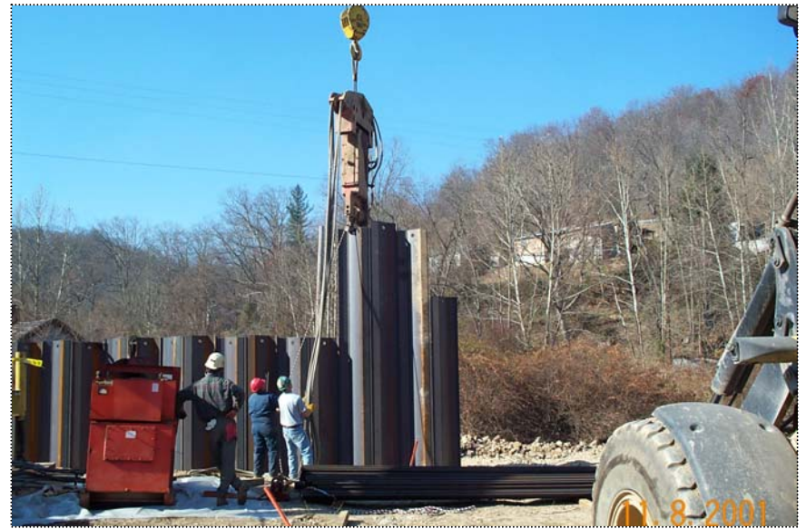
DCP1159 - View of driving operations at level D