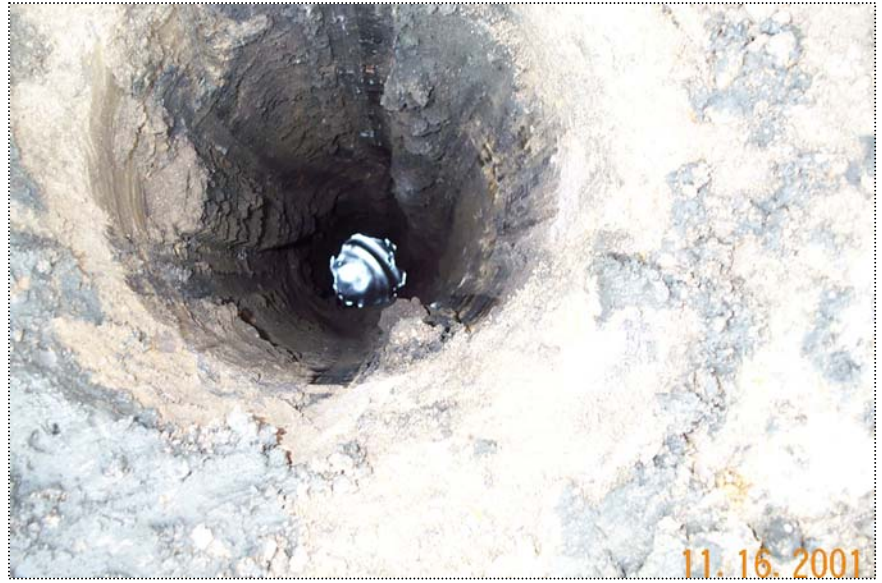
DCP1281 - View looking down the hole for new well SS-12