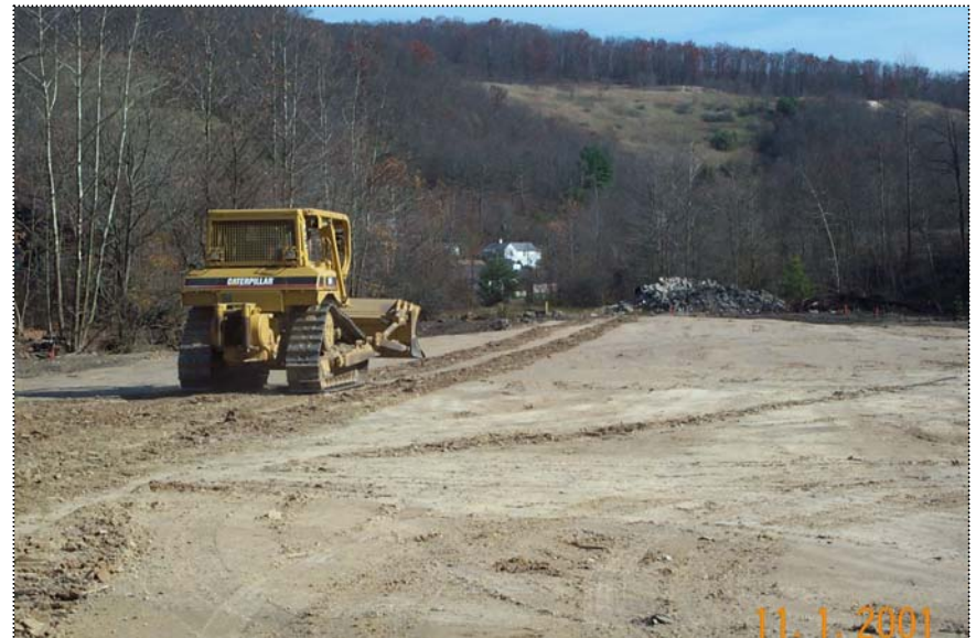
DCP01057 - Dozer scarifying the sub grade before the next lift