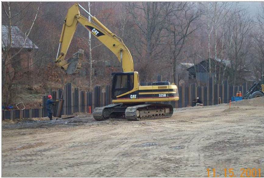
DCP1253 - Track Hoe removing cut sheets from the sheet pile wall