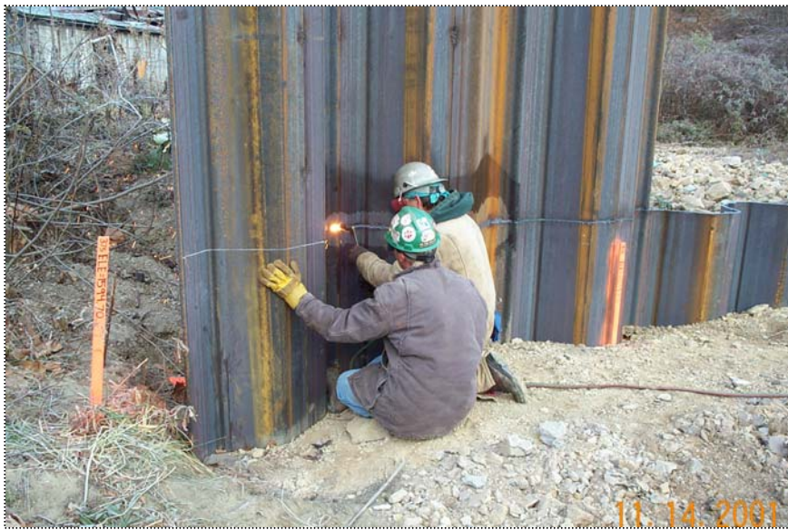
DCP1241 - Ahern personnel cutting the sheets to grade