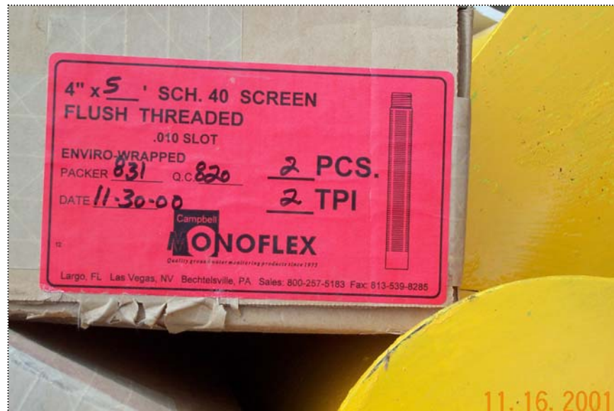
DCP1285 - Information on the Screen for the wells