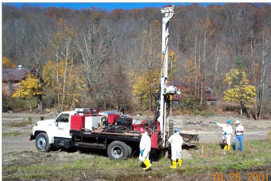
DCP01013 - General view of Triad's drill rig removing well MW-6 PIEZ