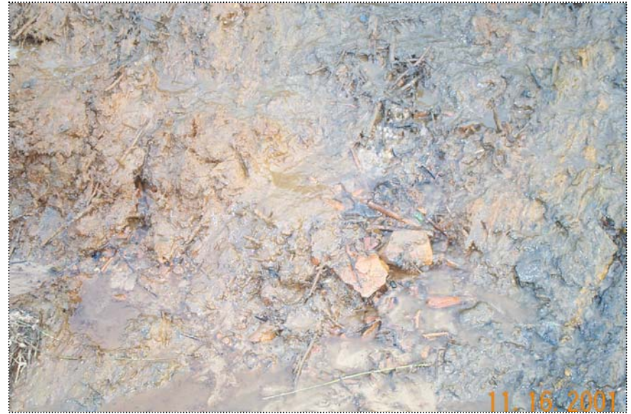
DCP1310 - Water flowing out of the north facing bank on the stone ditch