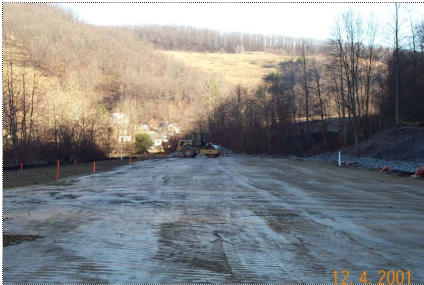
DCP1441 - General view of the Southern section of the site after compaction