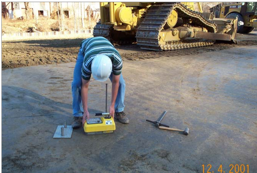
DCP1442 - Protesta tech preparing to start a compaction test