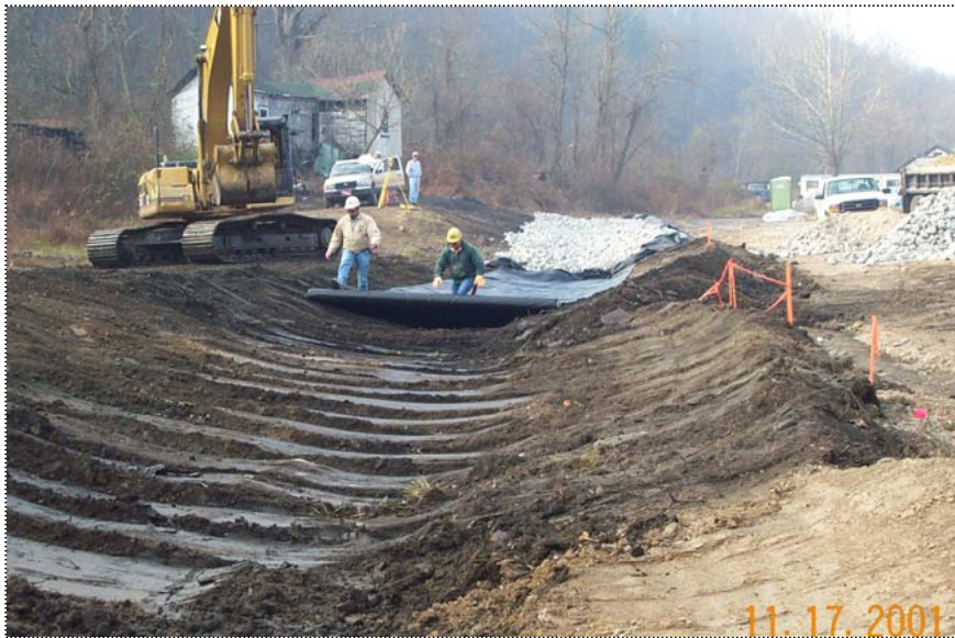
DCP1314 - WasteTron personnel placing filter fabric in the newly excavated Stone Ditch