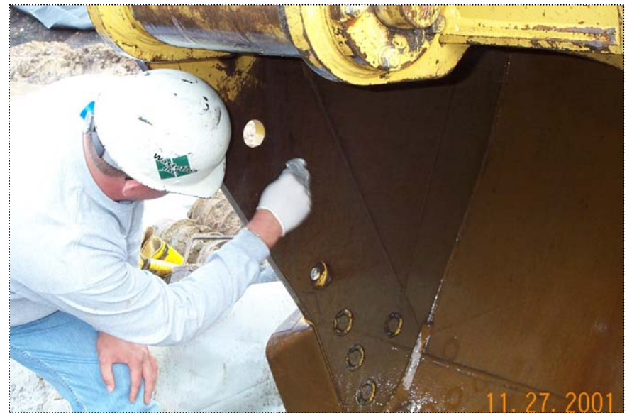
DCP1393 - Pinnacle health and safety swipe testing the bucket of the track Hoe