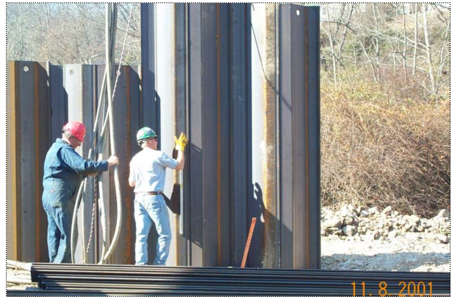
DCP1160 - Ahern personnel checking sheet for plumb before driving