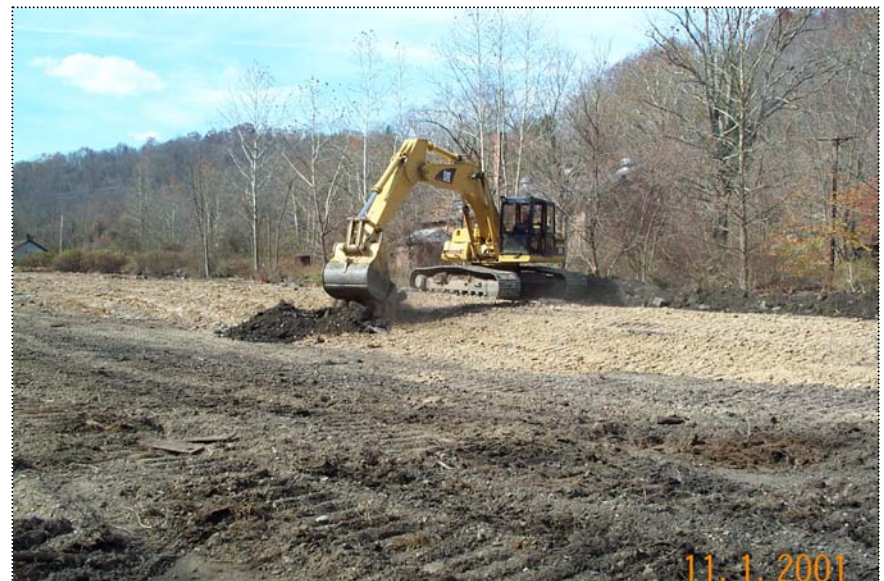
DCP01063 - Close up view of the Track Hoe e/cutting the slope for the cap excavation