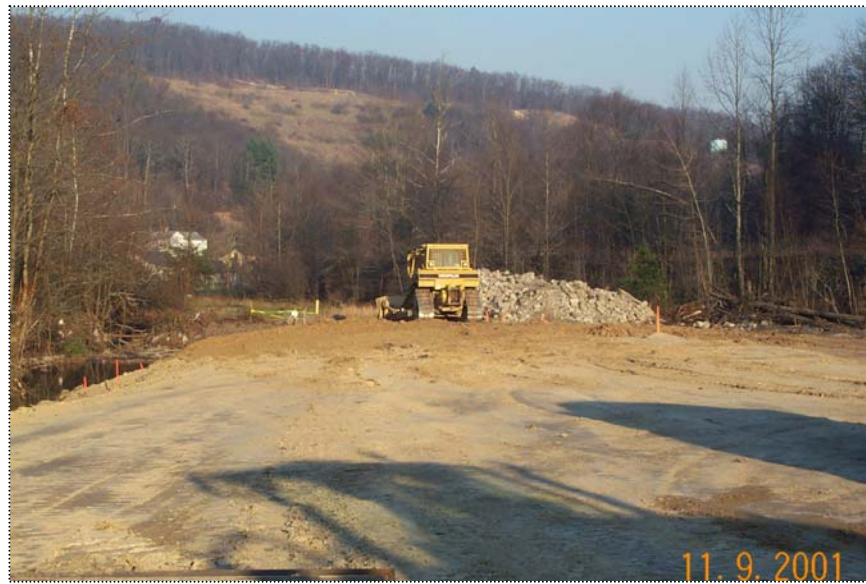
DCP1180 - Dozer spreading sub grade material from Richard Bailey's barrow area