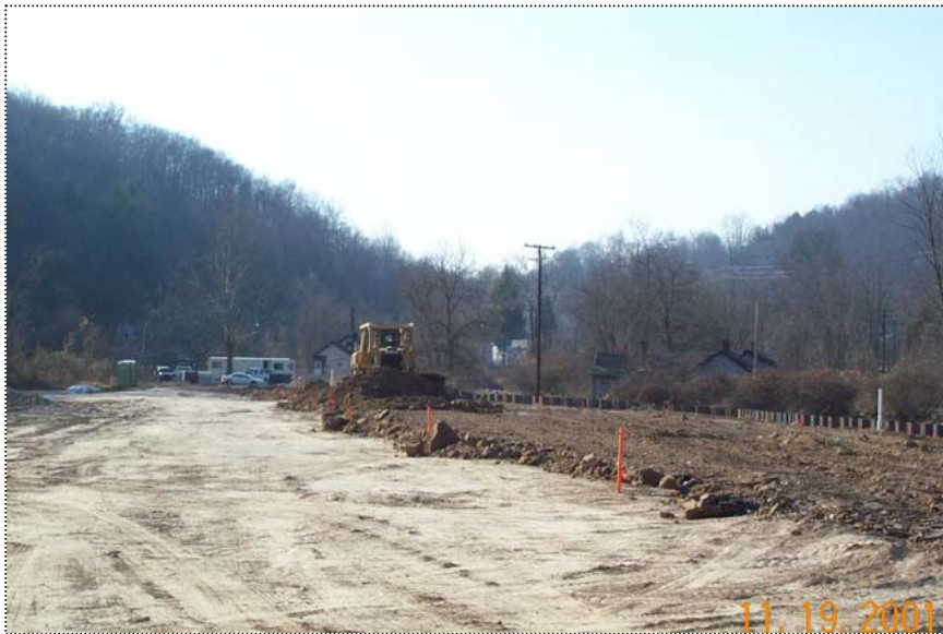
DCP1332 - Dozer spreading cap material in a lift