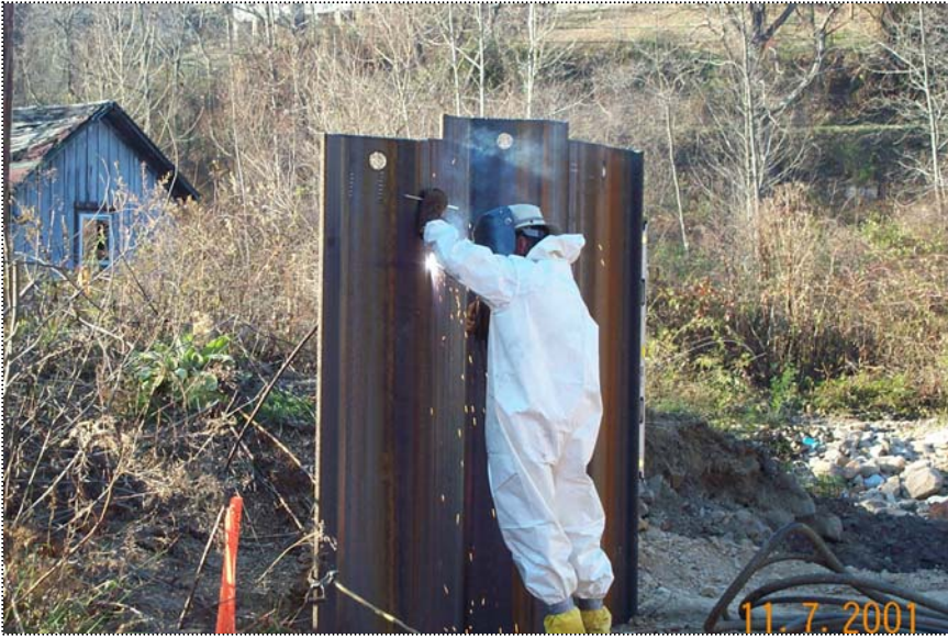
DCP1139 - Ahern personnel tack welding sheet 1 and 2, so they can plumb the sheets