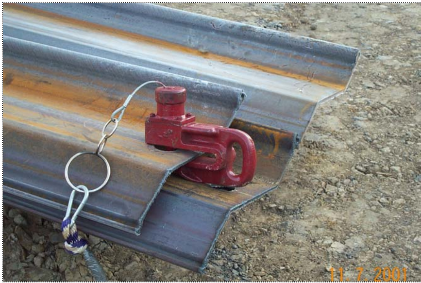
DCP1122 - Sheet pile lifting shackle with disconnect