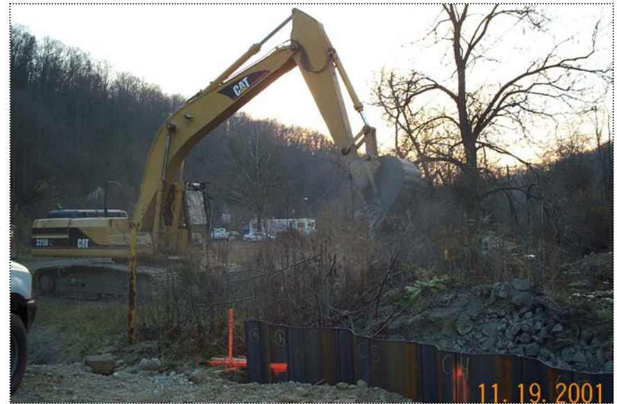
DCP1339 - Track Hoe starting to excavate the upstream ditch