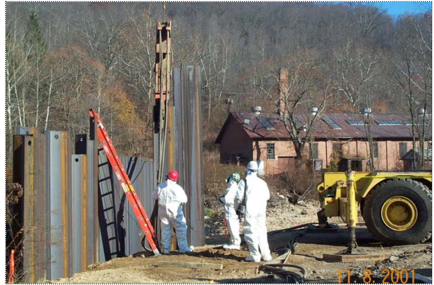
DCP1153 - View of Ahern personnel driving piling at level C