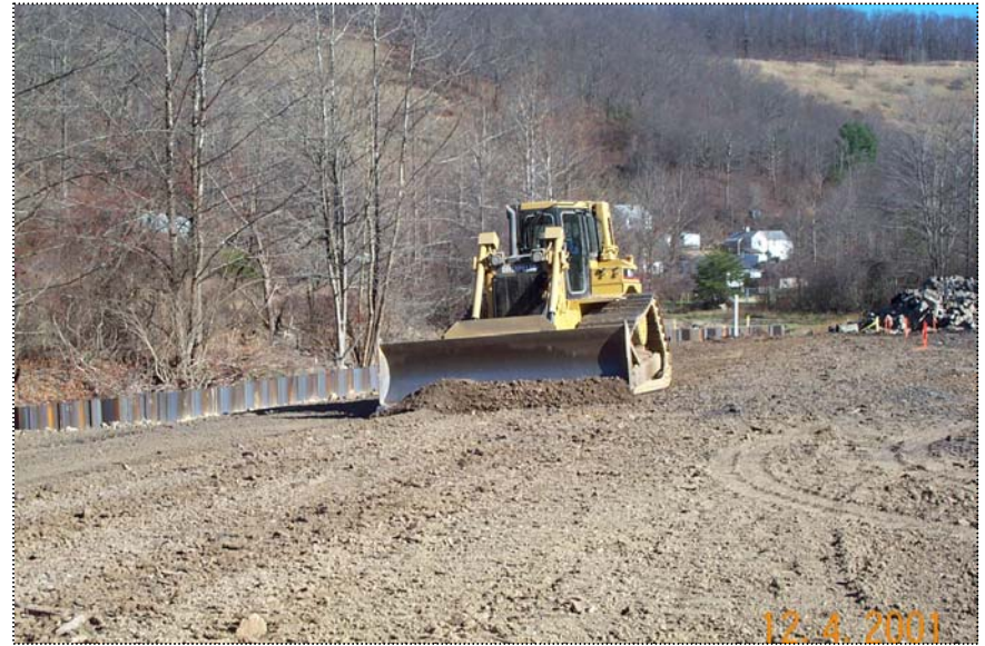
DCP1449 - Dozer grading the cap material on the Northern half of the site