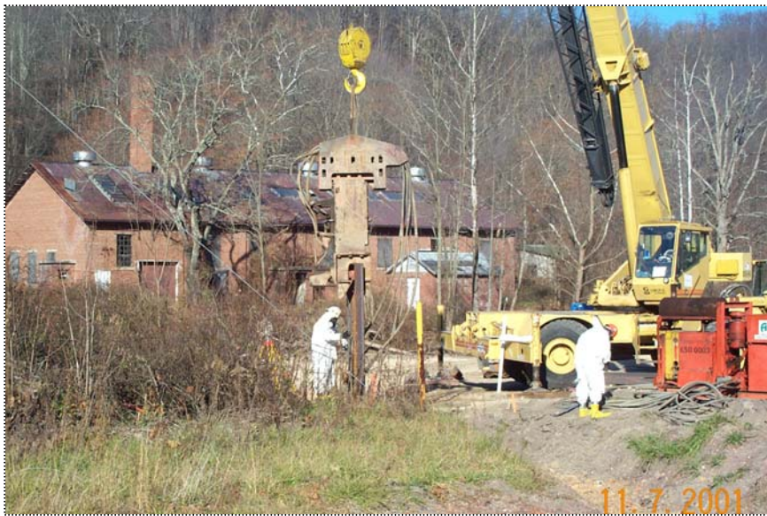
DCP1132 - Ahern personnel driving second sheet at level C