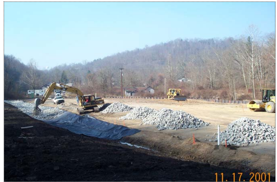
DCP1318 - View of over all site operations