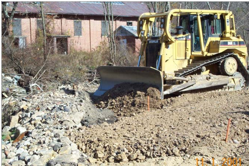
DCP01055 - Dozer placing sub grade material on the Western section of the site