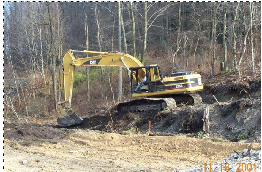
DCP1297 - WasteTron's track hoe excavating for the stone ditch