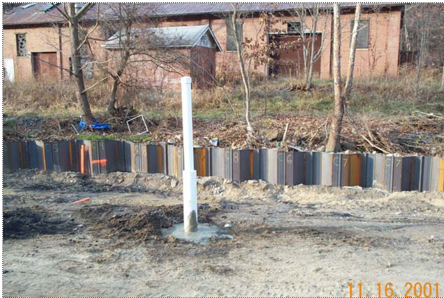
DCP1302 - Well MW-2 after installation of 6-inch PVC and concrete