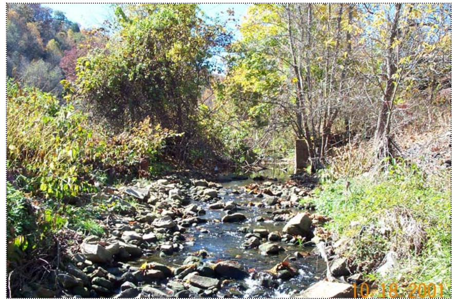
DCP0967 - View of the stream bank before clearing operations