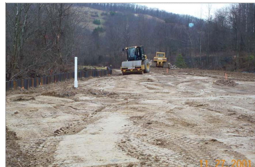
DCP1385 - General view of the Northern area next to the sheet pile wall