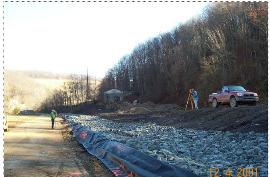
DCP1446 - Mountain State checking grade on the southern half of the site