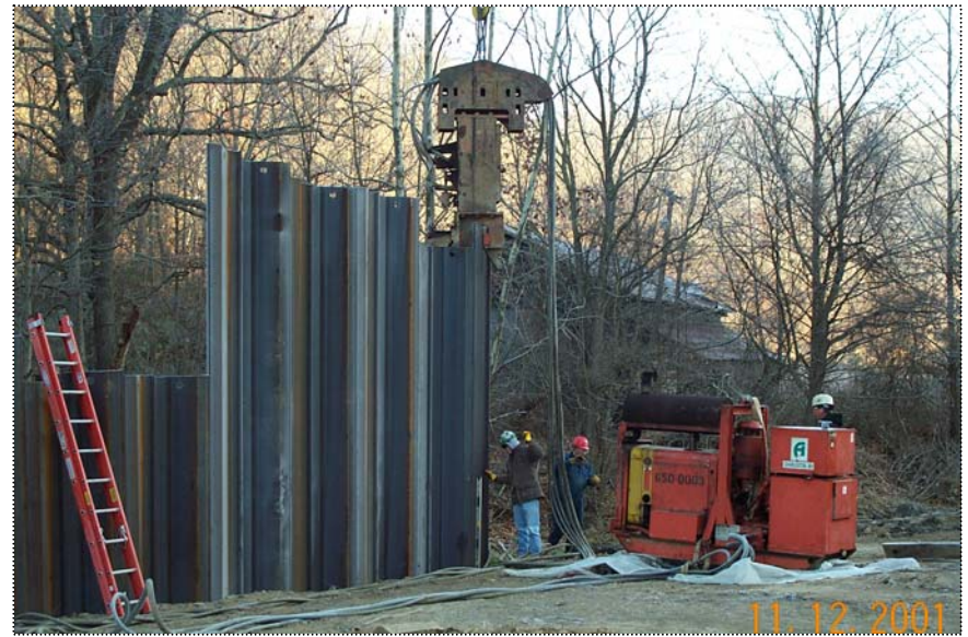
DCP1208 - Ahern pluming a sheet before driving