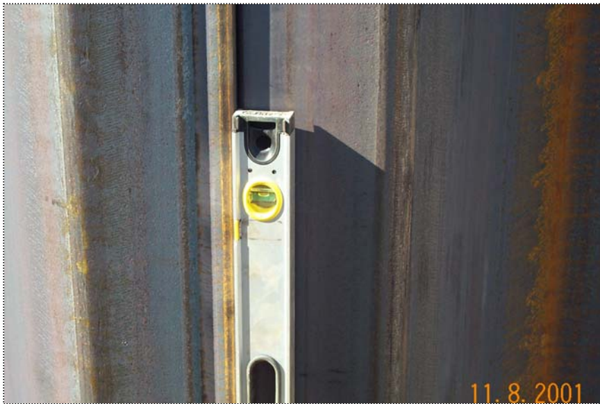
DCP1158 - Close up of view of level used to check sheets for plumb