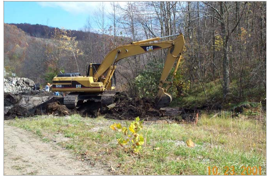
DCP0989 - Track Hoe excavating new drainage feature per drawings. (Found ditch intercepted a gas main, relocated entrance to Arbuckle creek)