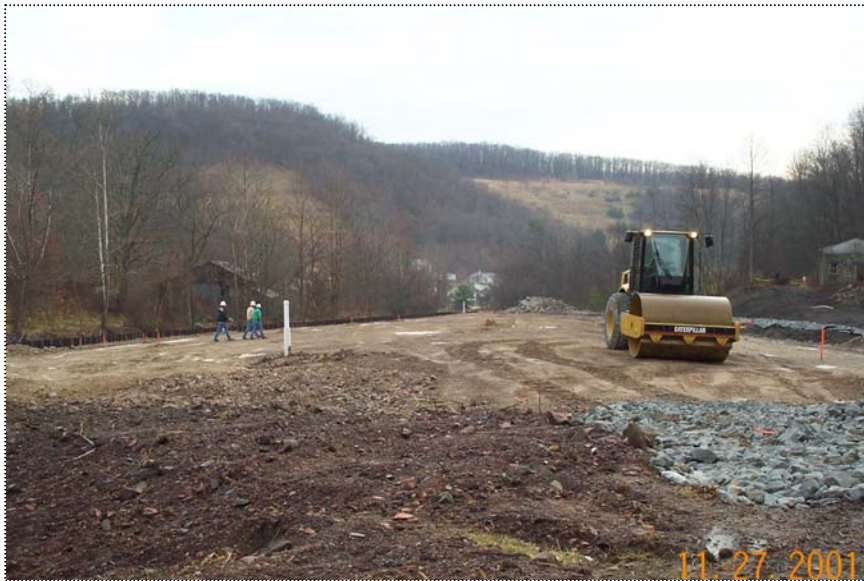
DCP1381 - General view of the site after the rain this weekend. WasteTron personnel checking the site for soft spots due to the rain