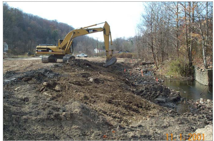
DCP01062 - Track Hoe cutting the slope on the Eastern section of the sheet pile wall