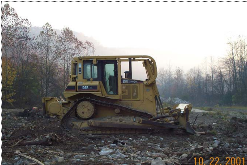
DCP0970 - Equipment used on site, a Walker Caterpillar D6R Dozer