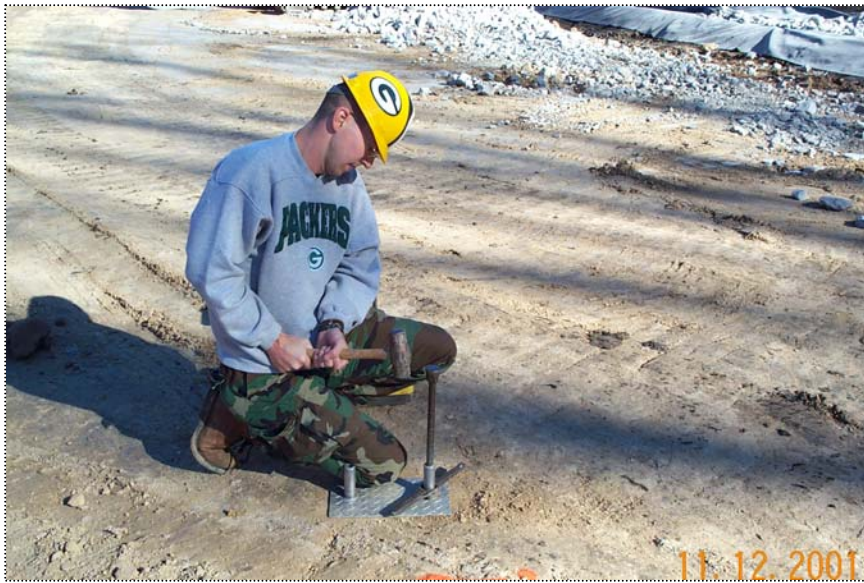
DCP1216 - View of Tech preparing test hole for the nuclear density gage