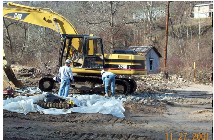
DCP1389 - WasteTron Personnel removing the gross materials by use of a shovel on the Track Hoe