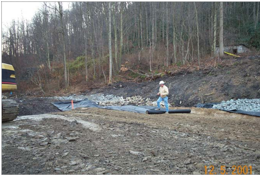
DCP1457 - WasteTron personnel rolling out filter fabric for the east portion of the stone ditch