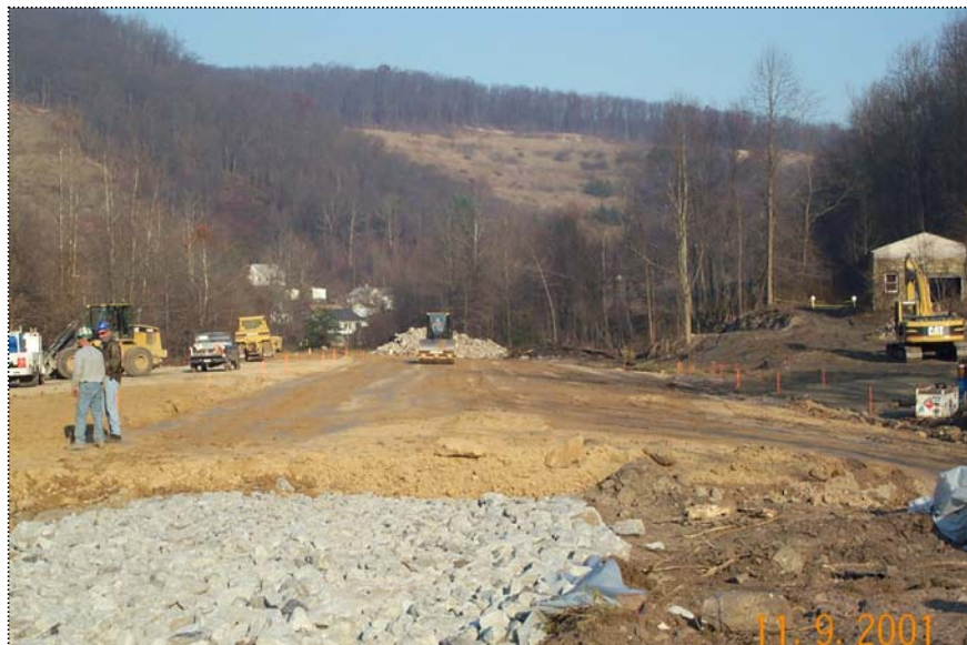
DCP1179 - General view of the southern half of the site, before and after compaction by the roller