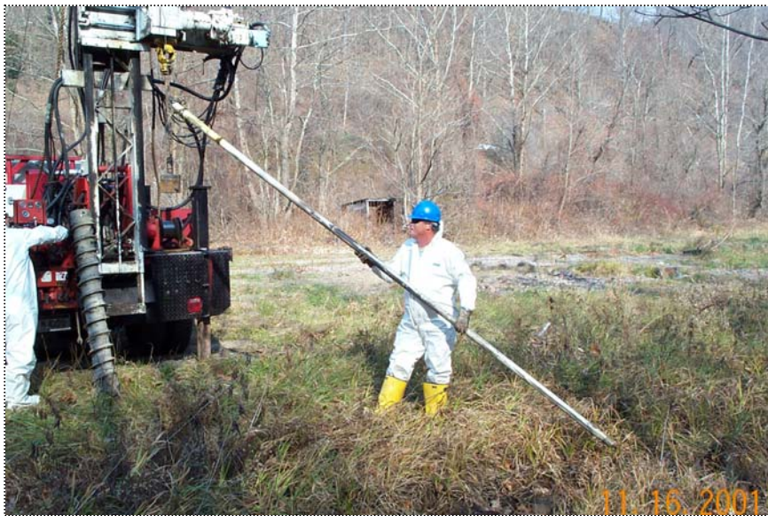
DCP1277 - View of the filter and stand pipe, approximately 14 feet