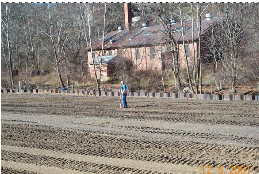
DCP1467 - Mountain State surveyors cross section the site