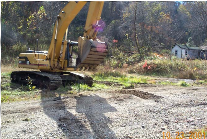
DCP0991 - Track Hoe scratching the surface looking for a manhole cover from Arbuckle P.S.D.