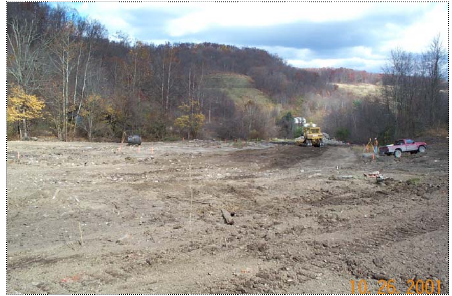
DCP01022 - General view of the site looking Northeast, (Downstream)