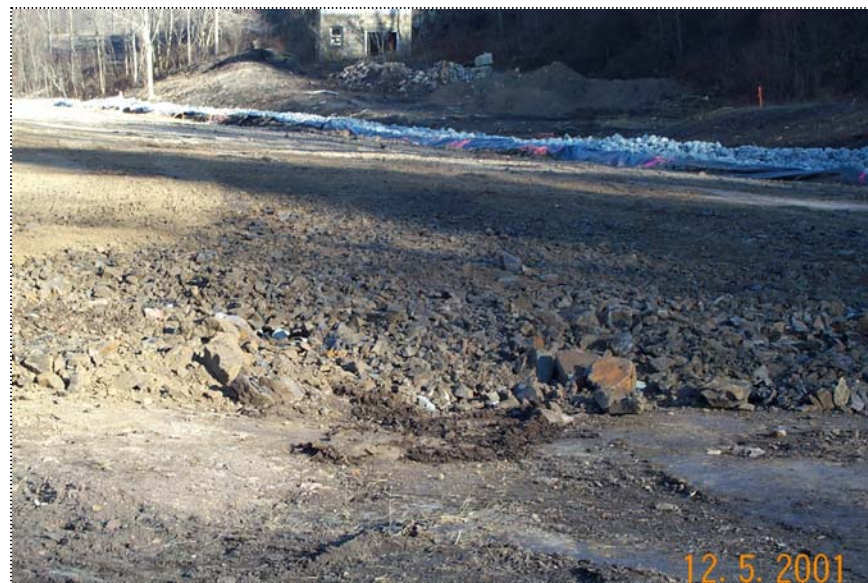
DCP1469 - Gary Cooper covered the decon pad with cap material