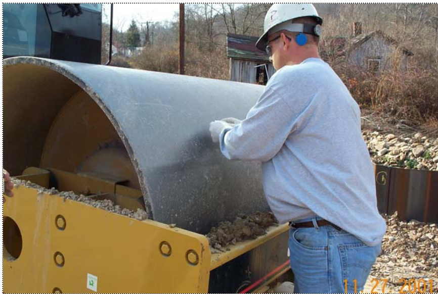
DCP1390 - Pinnacle health and safety swipe testing the roller