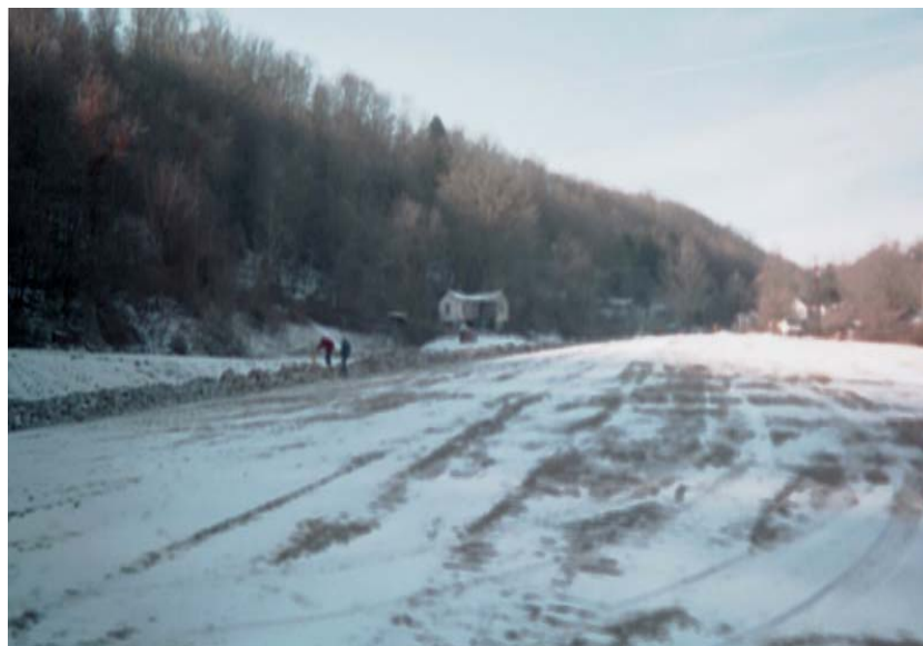
View of Cap, looking west