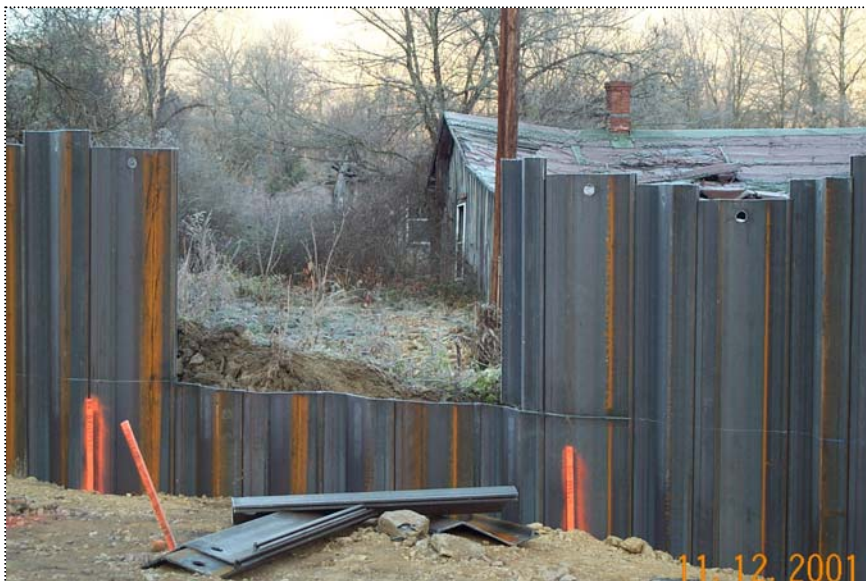
DCP1204 - View of sheets cut by Ahern's pile driver