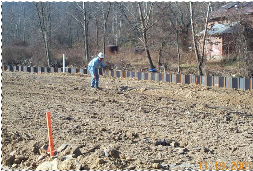
DCP1331 - Rodney Roberts removing roots from the cap material