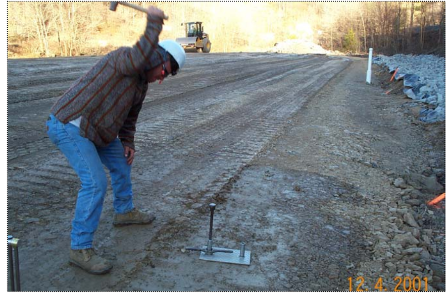
DCP1454 - WasteTron personnel driving the stake for the nuclear density meter