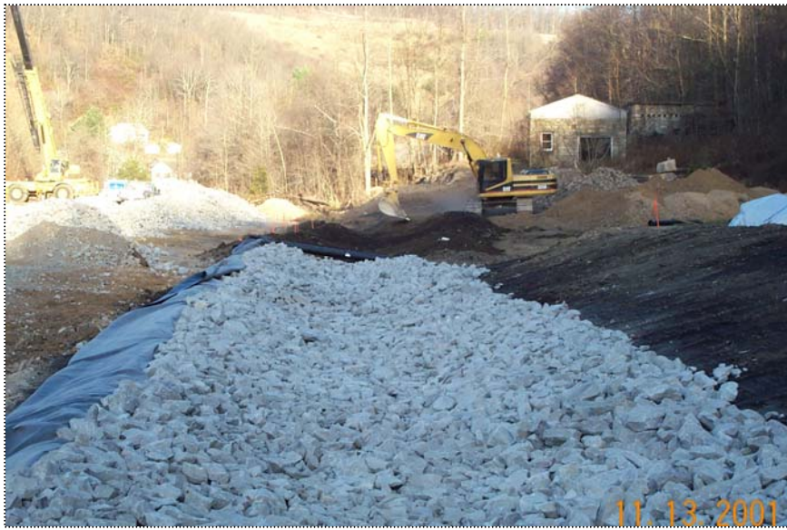
DCP1237 - Track Hoe rough out the next section on the stone ditch