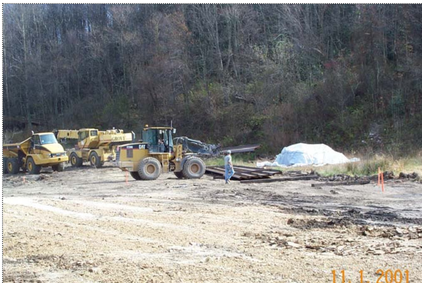
DCP01061 - Close up of the sheet pile being unloading