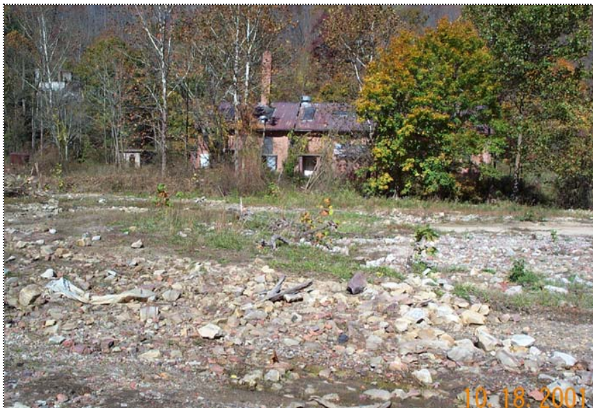
DCP0962 - General site view looking across the site at well MN-1 Piez