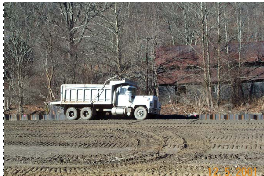
DCP1468 - Water truck placing moisture on the cap material before rolling