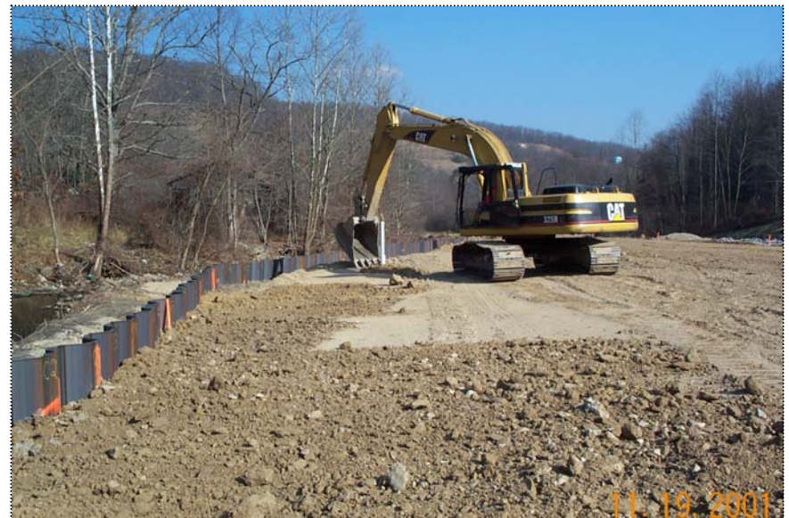
DCP1329 - General shot of Track Hoe making adjustments in the material next to the sheet pile wall