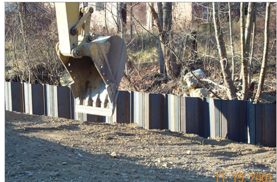
DCP1265 - Close up view of the Track Hoe removing excess soil from the edge of the sheet pile wall