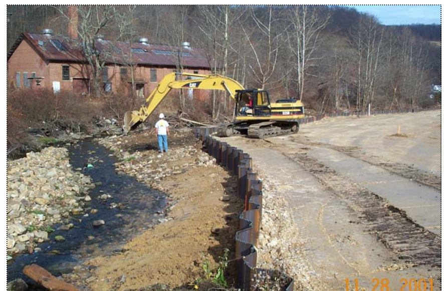
DCP1404 - Track Hoe pulling material up against the outside of the sheet pile wall