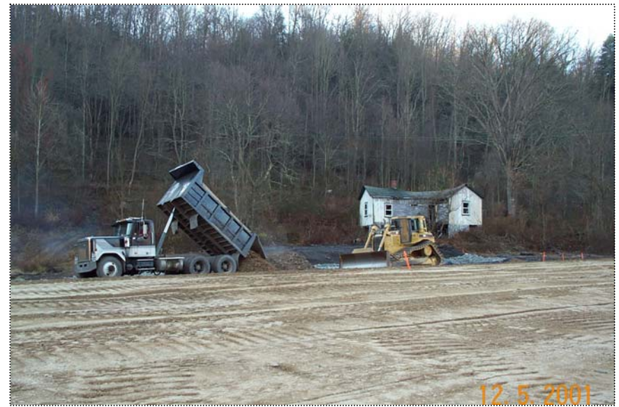
DCP1458 - Richard Bailey truck dumping cap material in front of the dozer