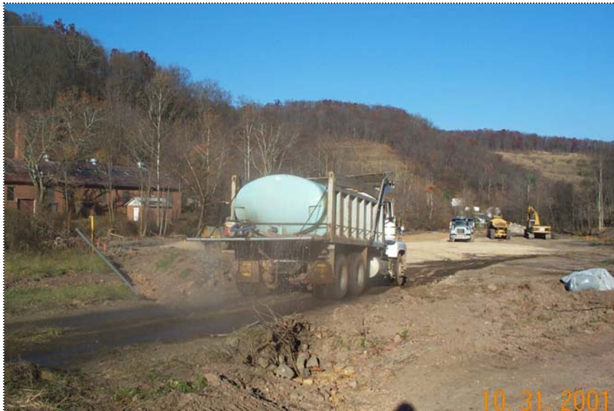
DCP01047 - Water truck spraying water on the access roads off site and on to maintain dust control