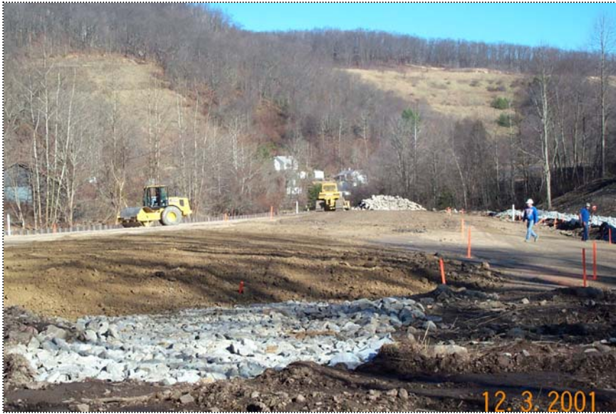
DCP1437 - General view of site operations, dozer spreading/tracking material on the southern half of the site, while roller compacts the soil on the Northern half of the site