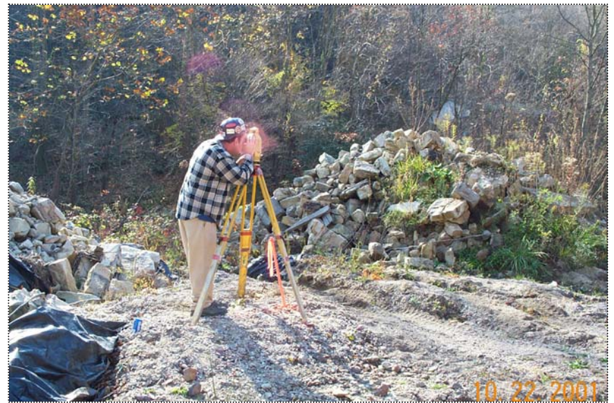
DCP0975 - Surveyors (Instrument person) setting limit and grade stakes for the cap