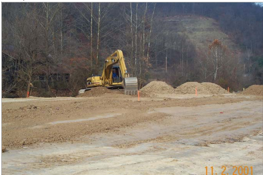
DCP01084 - View of Track Hoe placing backfill into the trench for the sheet pile wall