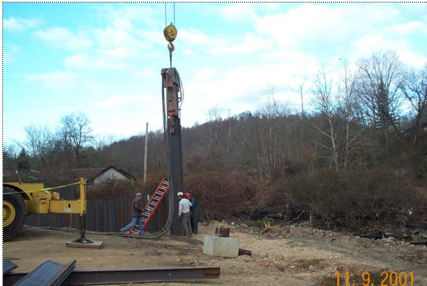
DCP1168 - Ahern personnel driving sheet pile