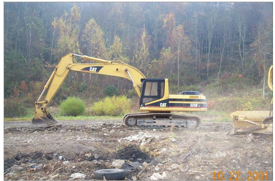
DCP0971 - Equipment used on site, a Walker Caterpillar 325B Track Hoe