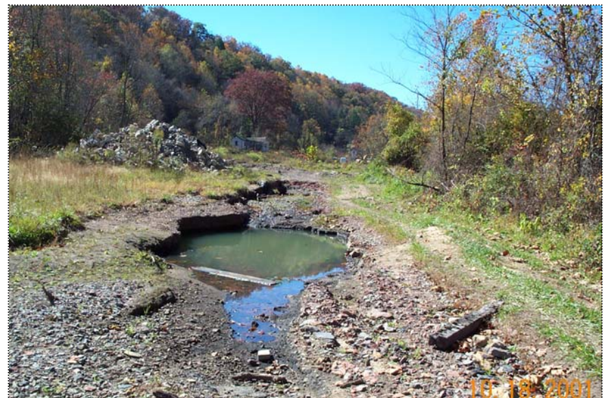
DCP0968 - View looking west, at erosion channels caused by the flood. (Located downstream of site)