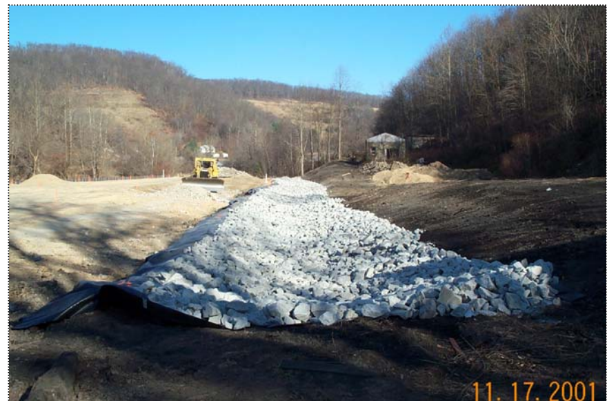
DCP1322 - View looking East, (down stream) of the installed Stone Ditch