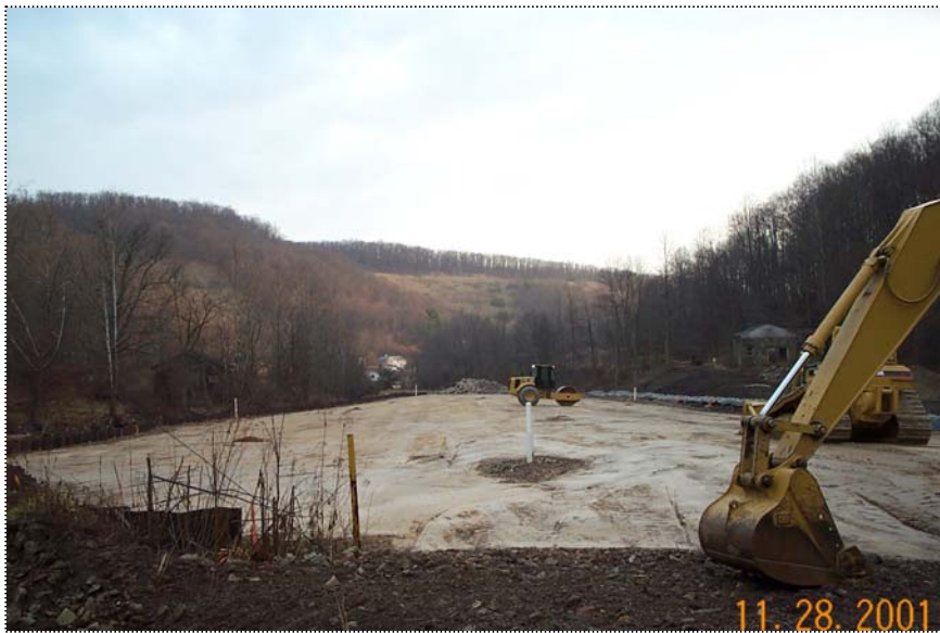
DCP1396 - General view of the site, before site operations began