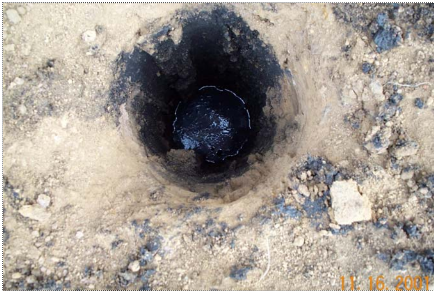
DCP1291 - View looking down the hole for well SS-14