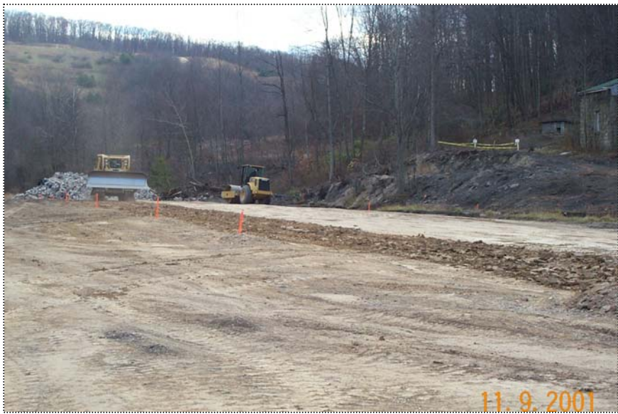
DCP1171 - General view of the Southwestern section of the site. The dozer is scarifying the central section of the southern half, while the roller compacts the edge of cap after applying water