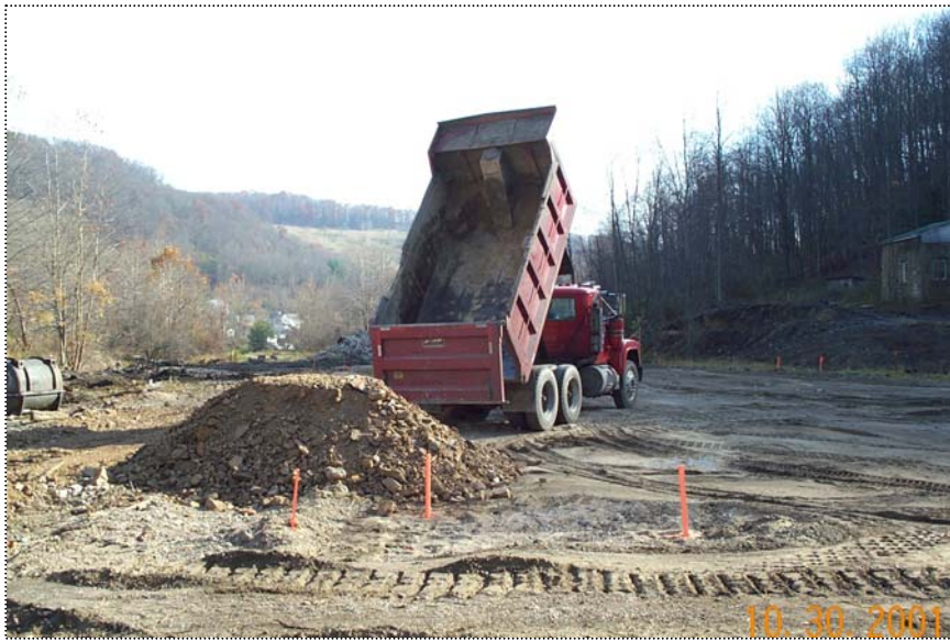
DCP01032 - Richard Baileys 20 ton dump truck delivering sub base material