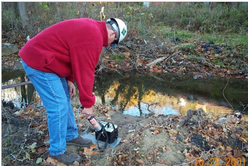
DCP01012 - Health and Safety from Pinnacle Environ. Checking area with a PID