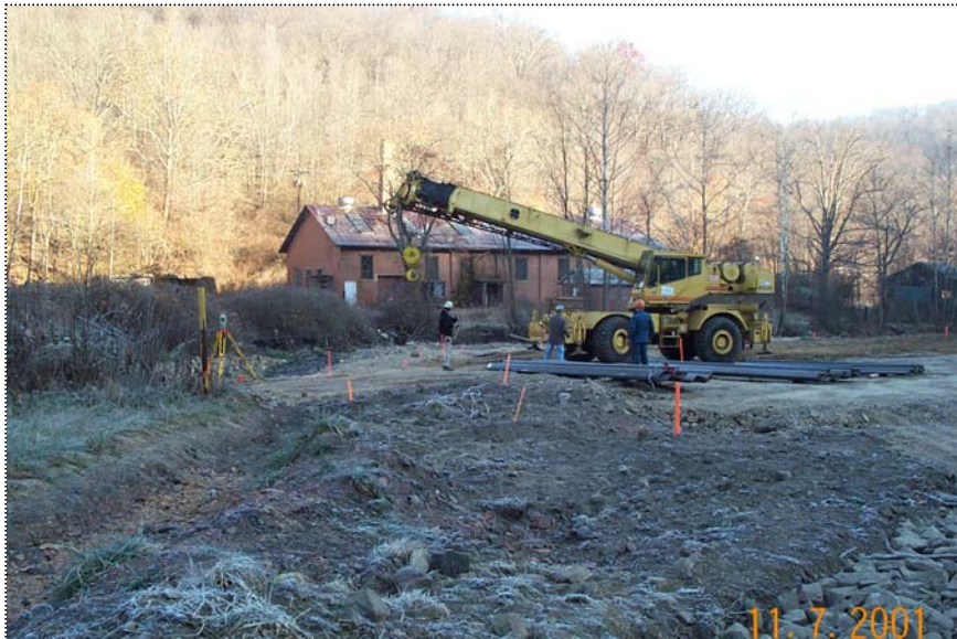
DCP1123 - Ahern moving crane to west sheet pile wing wall