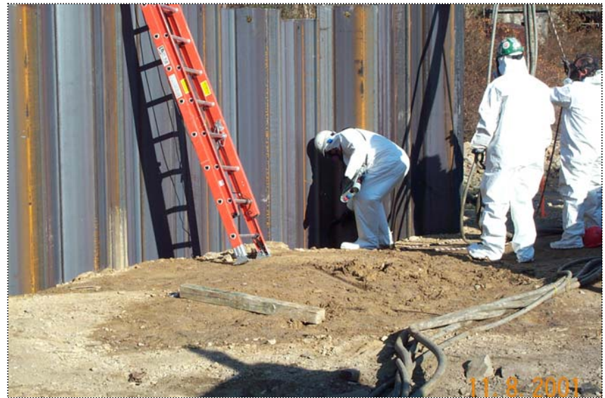
DCP1154 - Health & Safety testing area with PID