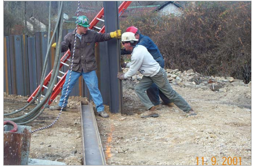
DCP1169 - Ahern personnel aligning a sheet on the line and motioning to the crane to stick the sheet