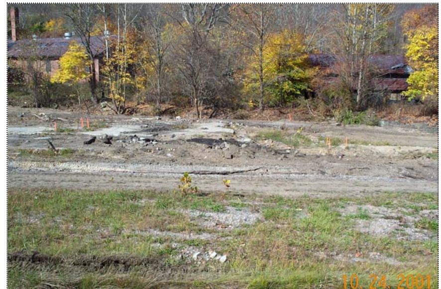
DCP1004 - General site view upstream, looking North (left to right)