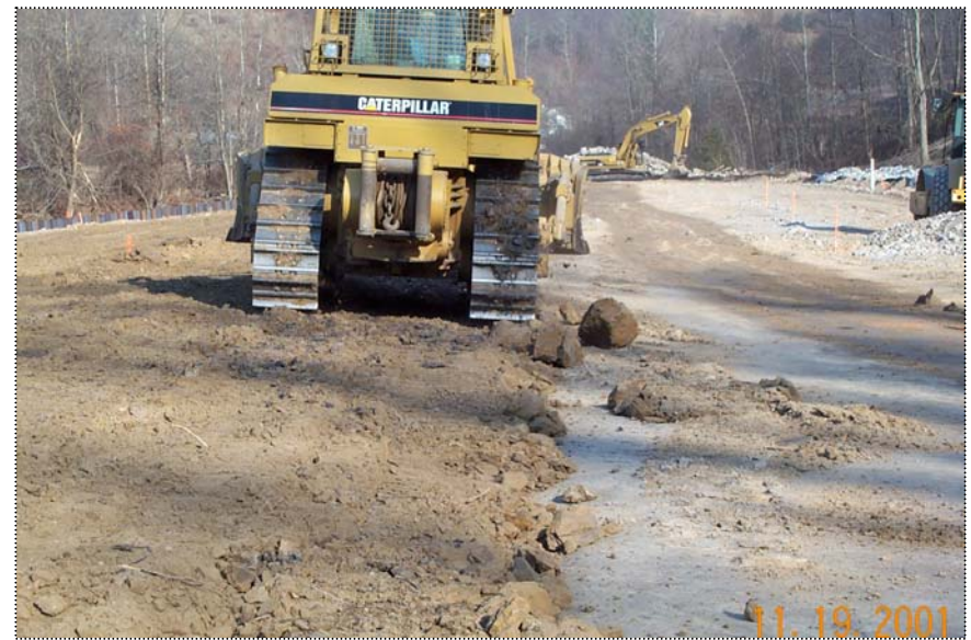
DCP1336 - Dozer tracking the edge of the lift. This to bond sections and to break up large pieces of material