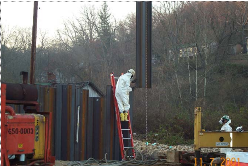
DCP1142 - Ahern personnel guiding sheet into interlock