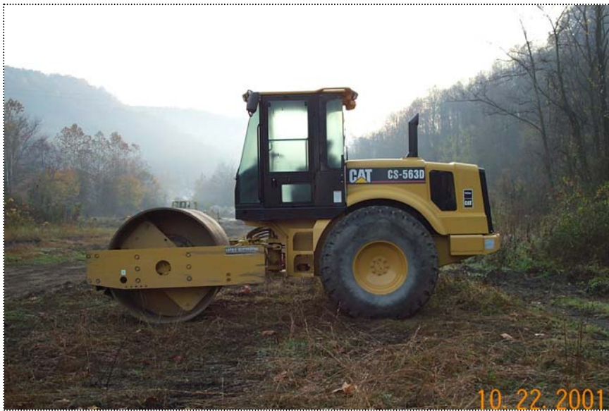
DCP0969 - Equipment used on site, a Walker Caterpillar CS-563D Roller