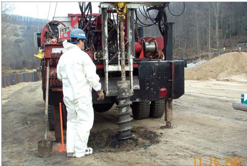
DCP1290 - Triad drilling on Well MW-2 first hole