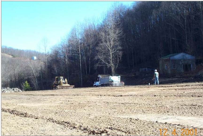
DCP1450 - General view of site operations