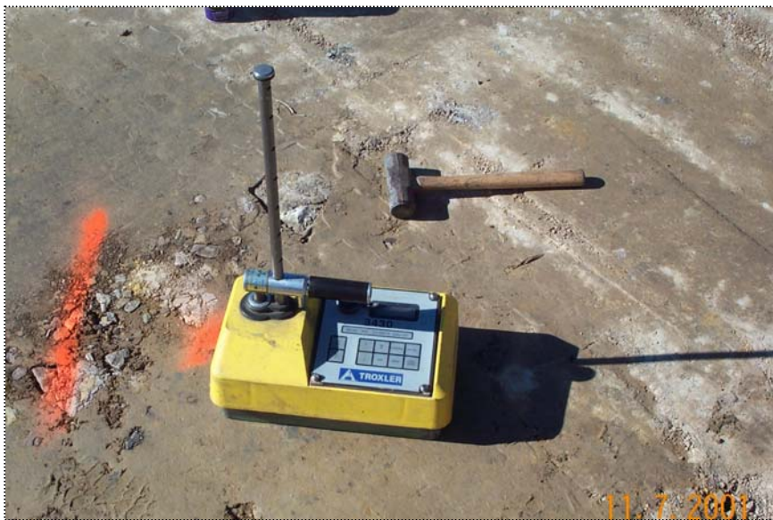
DCP1129 - View of the soil test equipment used to check soil density and moisture