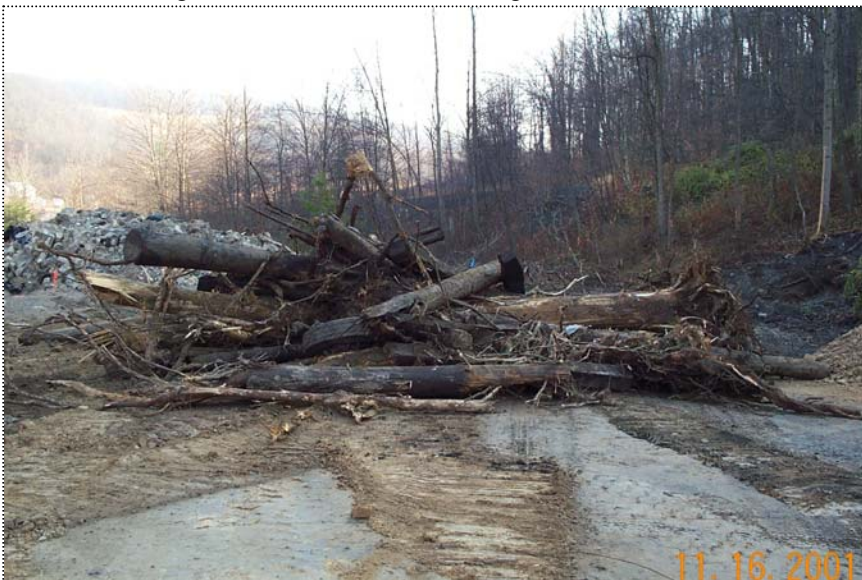
DCP1271 - View of the materials to be loaded on the two Jar-Bet trucks and delivered to Sycamore Landfill