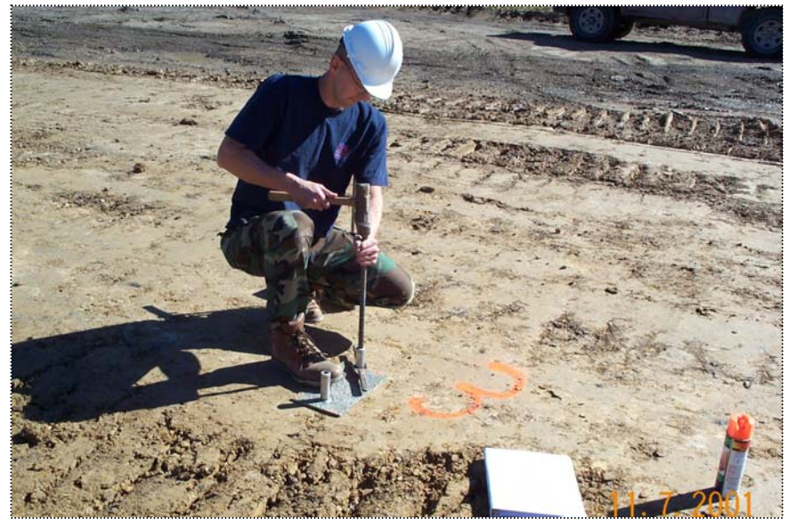
DCP1130 - Potesta Inc. personnel preparing to test the sub base