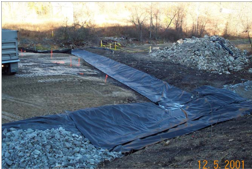
DCP1461 - General view of the filter fabric in the east side of the stone ditch