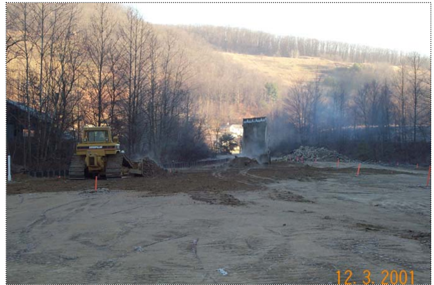
DCP1436 - View of Northwest section of the site, of the dozer spreading, while a Richard Bailey truck delivering cap material