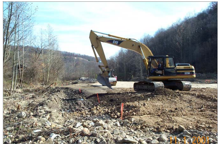
DCP01056 - View of Track Hoe cutting the slope on the edge of cap