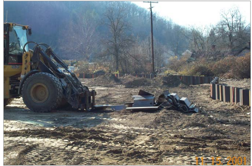
DCP1262 - Ahern removing the last of the cut sheets from the cap