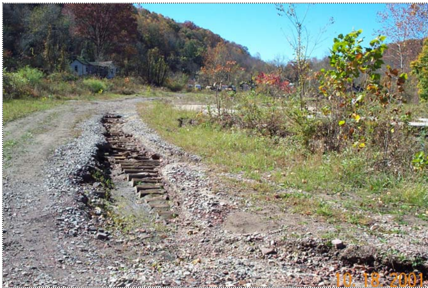
DCP0965 - View looking west, at erosion channels caused by the flood. (Located southern side of concrete foundation)