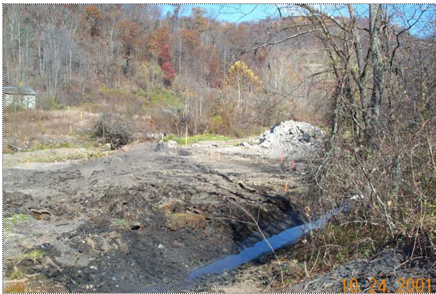
DCP1006 - General site view Downstream, looking Northeast (left to right)