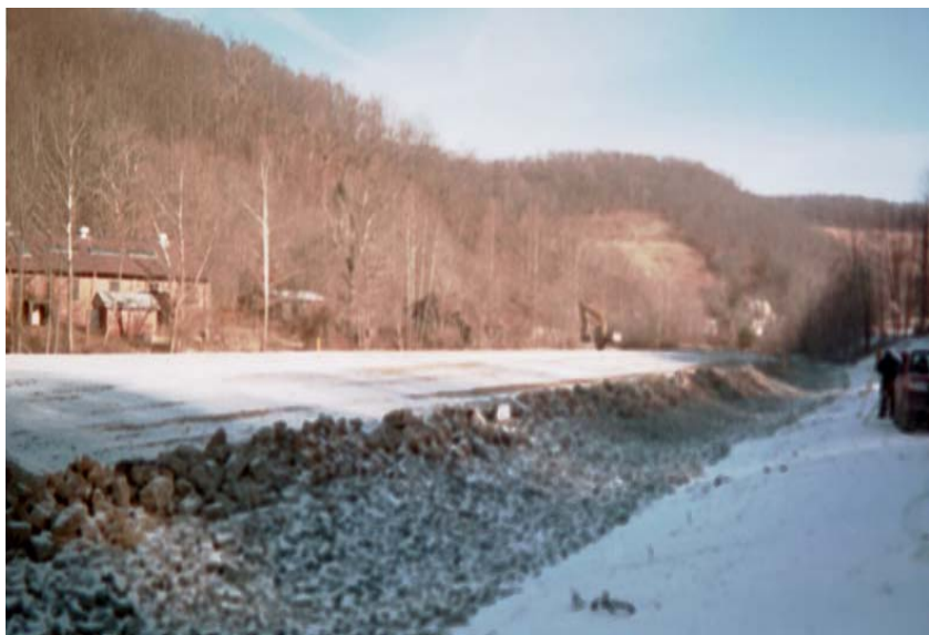
Southern Portion of Cap, shows drainage ditch