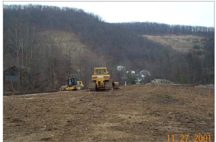
DCP1384 - Dozer and roll grading and compacting/sealing the site. Preparing the site for the expected heavy rains this evening (11/27/01).