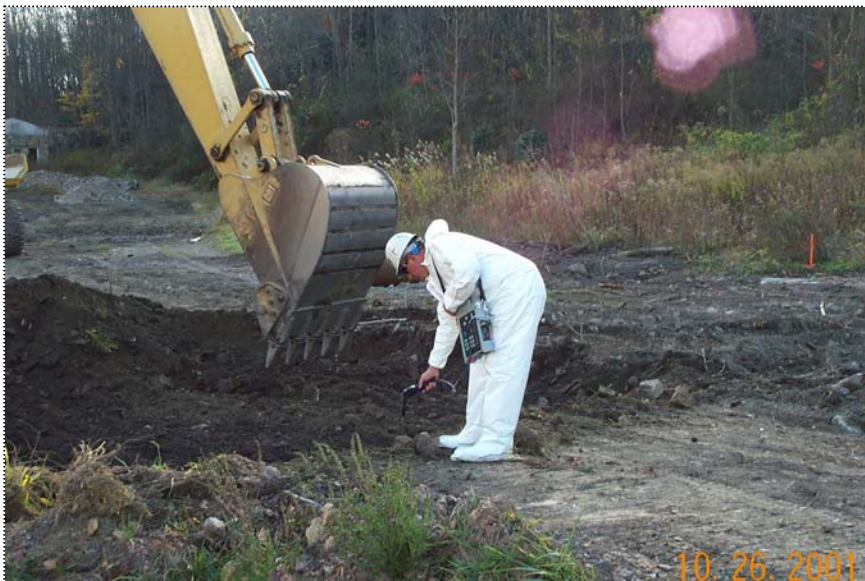
DCP01021 - Health and Safety from Pinnacle Environ. Checking excavation for equipment decon with a PID