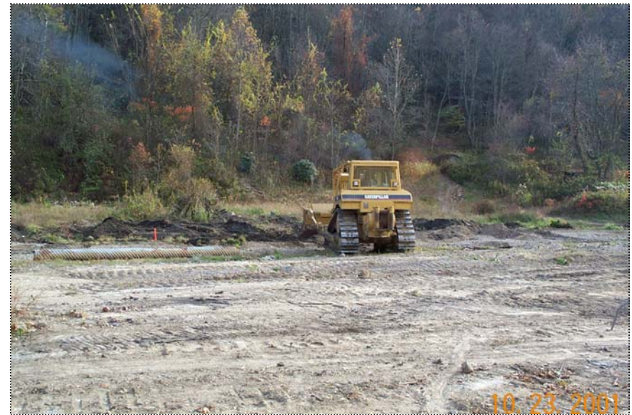
DCP0994 - Cat Dozer grading and compacting manhole search area