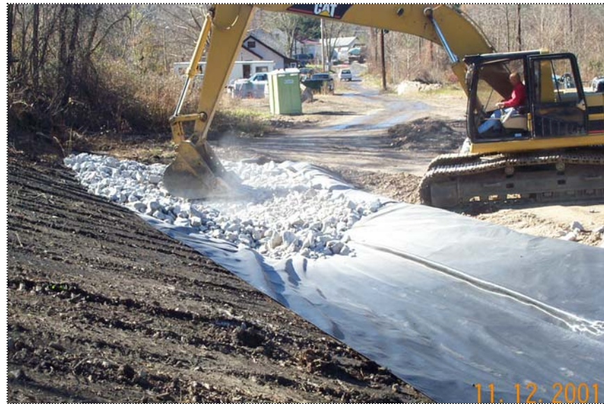
DCP1213 - Track Hoe placing stone on the filter fabric