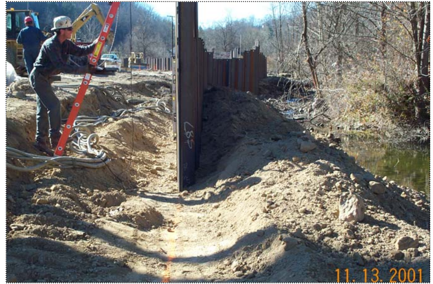
DCP1235 - General view of the sheet alignment. The orange line is used to maintain the correct alignment for the wall