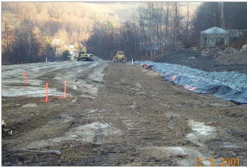
DCP1456 - Dozer tracking cap fill before placing more