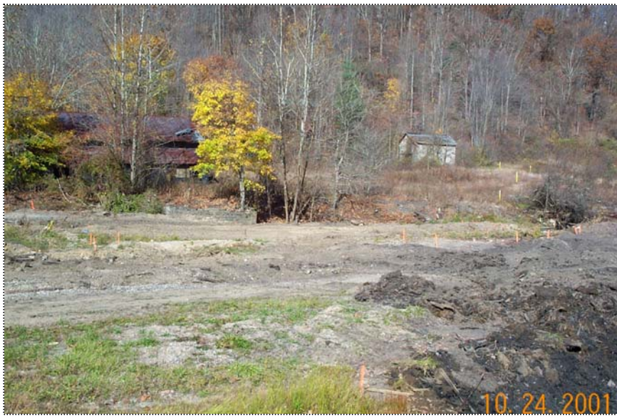
DCP1005 - General site view Downstream, looking Northeast (left to right)