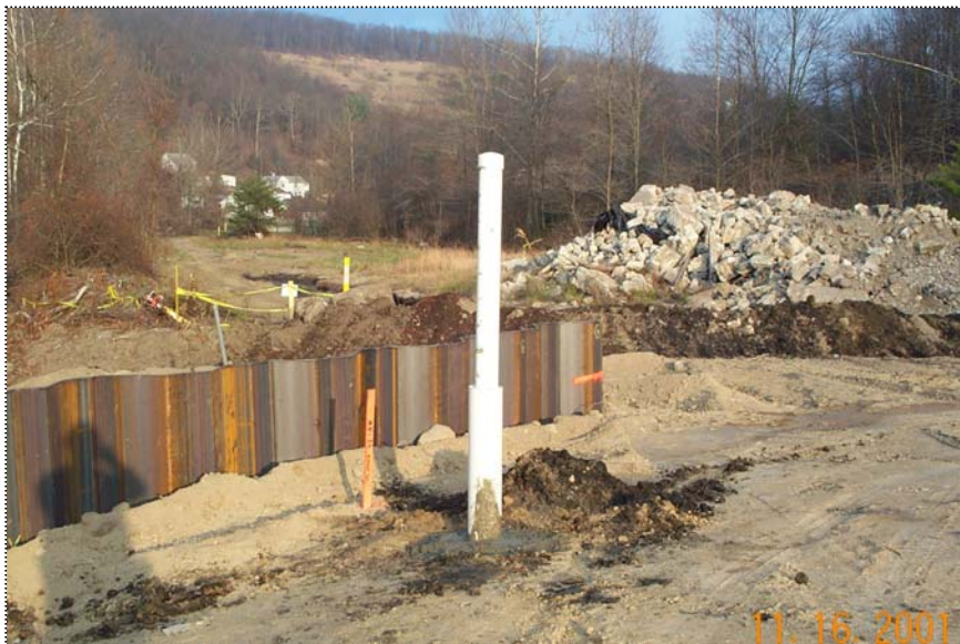
DCP1304 - View of Well SS-14 after installation of 6-inch PVC and concrete