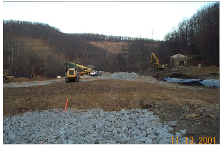
DCP1239 - General view of the Southern section of the site