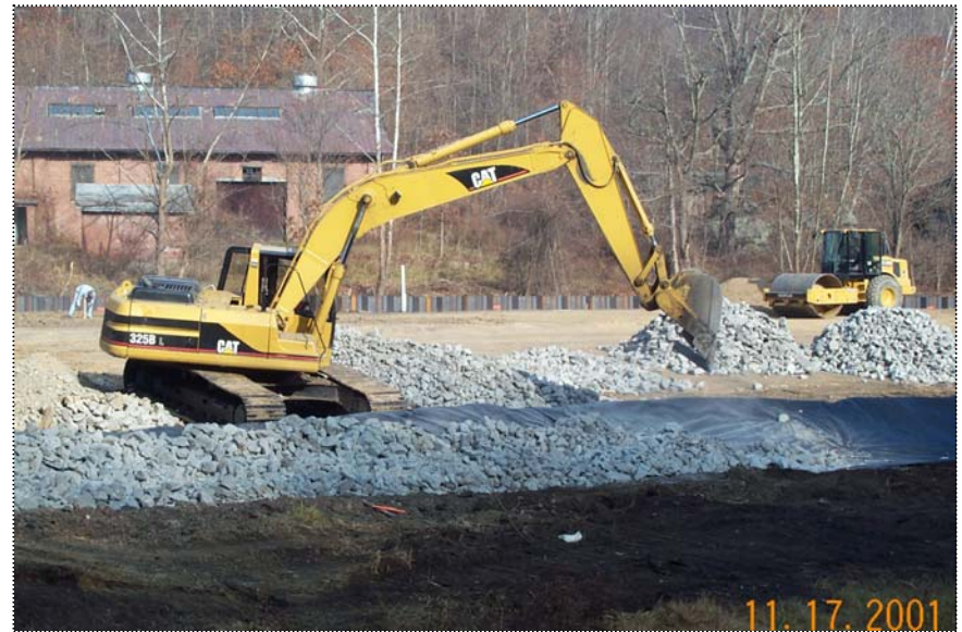
DCP1317 - View of Track Hoe placing stone on filter fabric