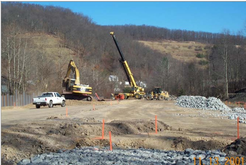
DCP1233 - General view of site activities by WasteTron and Ahern