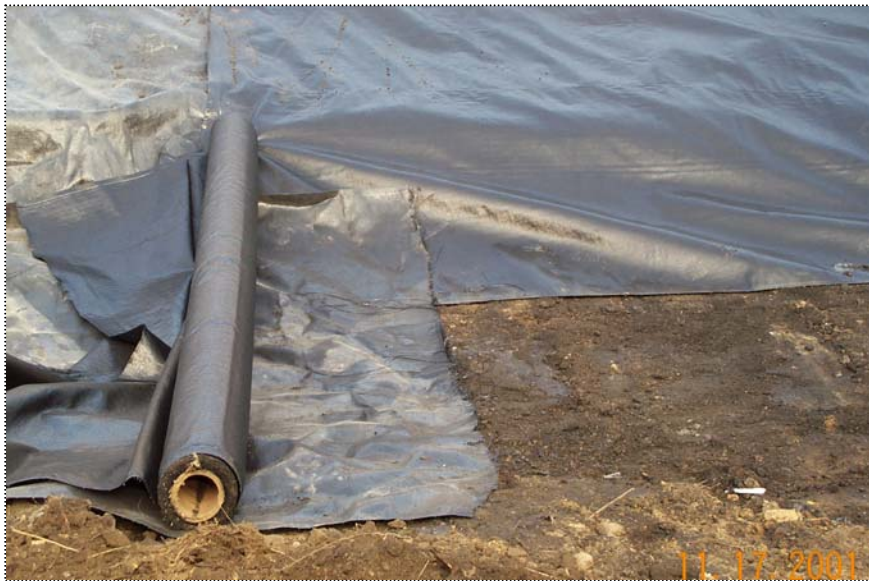
DCP1315 - View of the overlap in the sheets of filter fabric