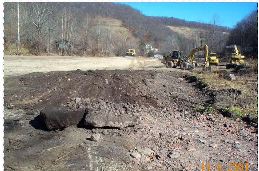
DCP1118 - View of edge of cap cut on the southwest section of the site