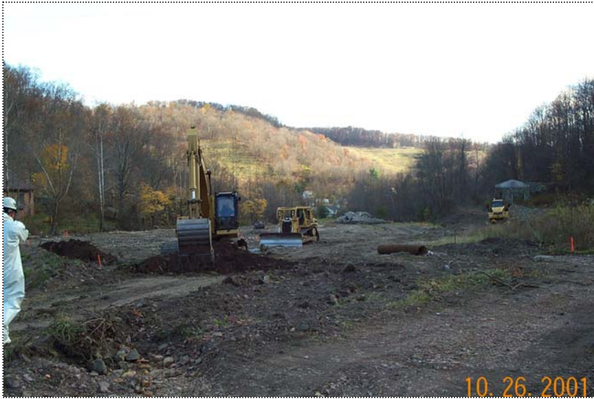
DCP01020 - Track Hoe excavating for the equipment decon pad