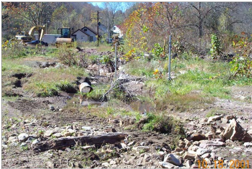
DCP0961 - View looking West upstream of the cap, at erosion channels caused by the flood.