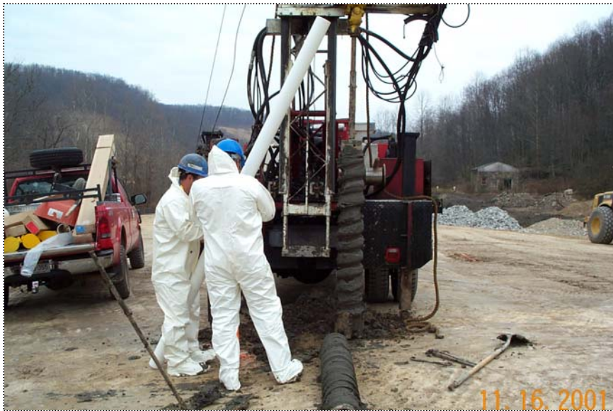
DCP1282 - Triad personnel assembling the casing for the well