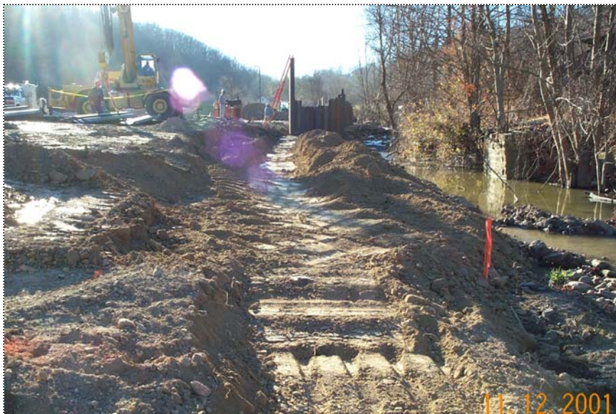
DCP1219 - View of step cut by the track hoe for the sheet pile wall