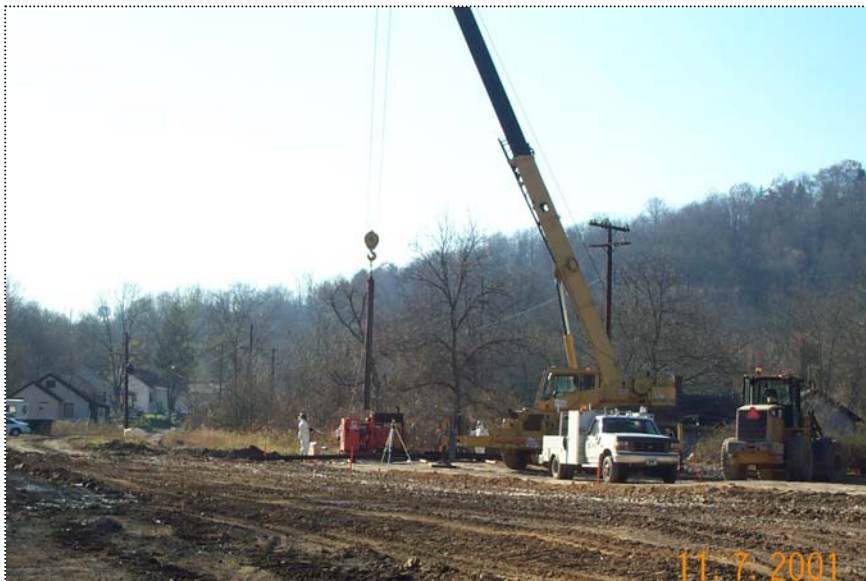
DCP1134 - Crane move sheet into position on the sheet pile wall