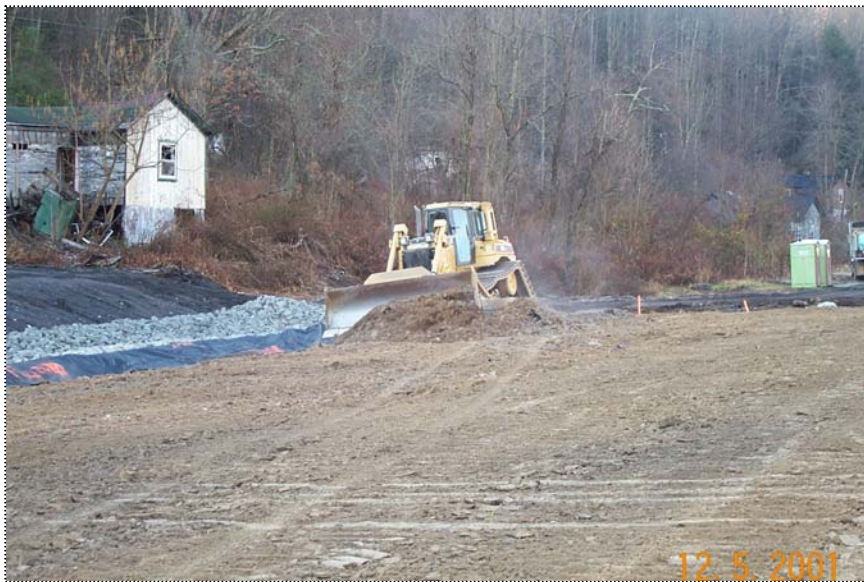
DCP1460 - Dozer spreading fill next to the western end of the stone ditch