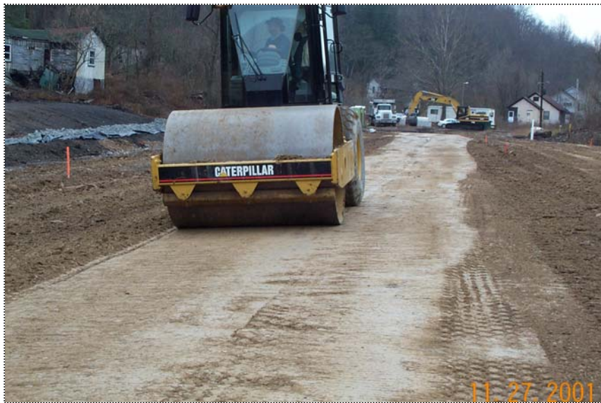
DCP1386 - Close up view of the of the roll compacting/sealing the cap material