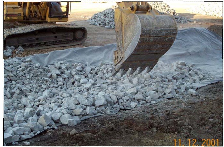
DCP1220 - Close up view of track hoe placing stone on the filter fabric, (stone ditch)