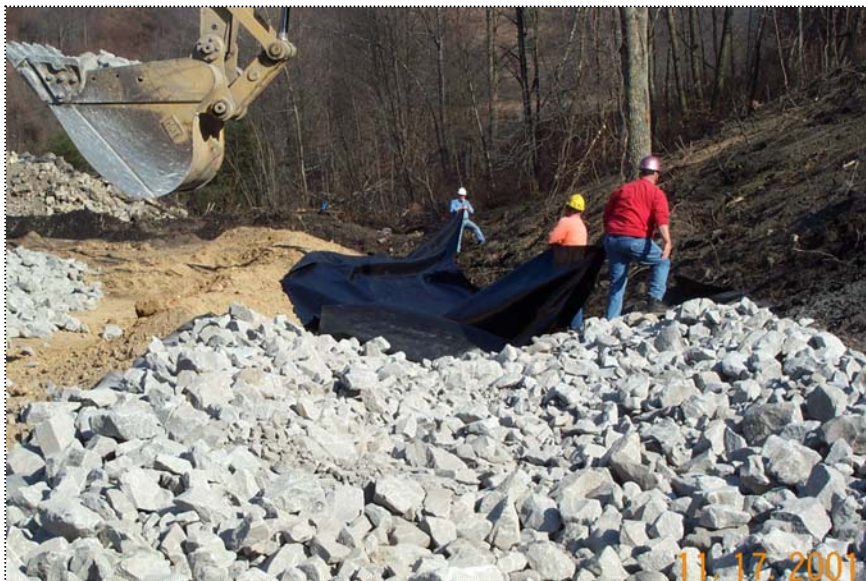
DCP1321 - WasteTron personnel installing a section of filter fabric in the excavation for the Stone Ditch