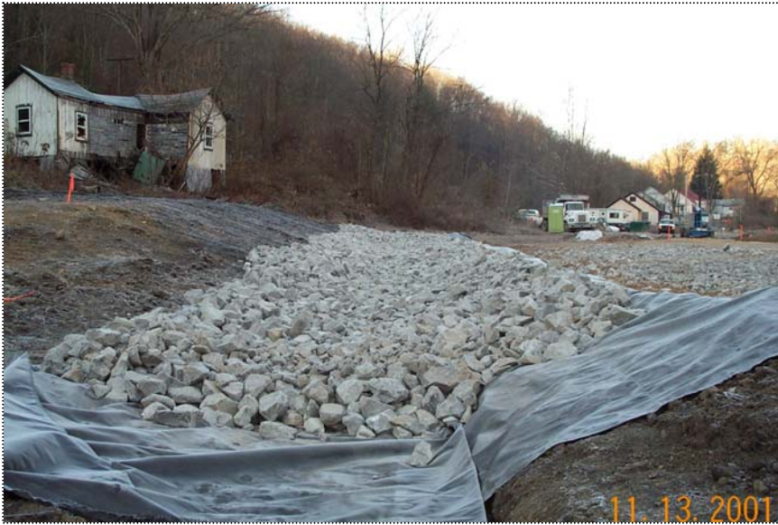
DCP1222 - View of the Stone placed in the Western 125 feet of the stone Ditch