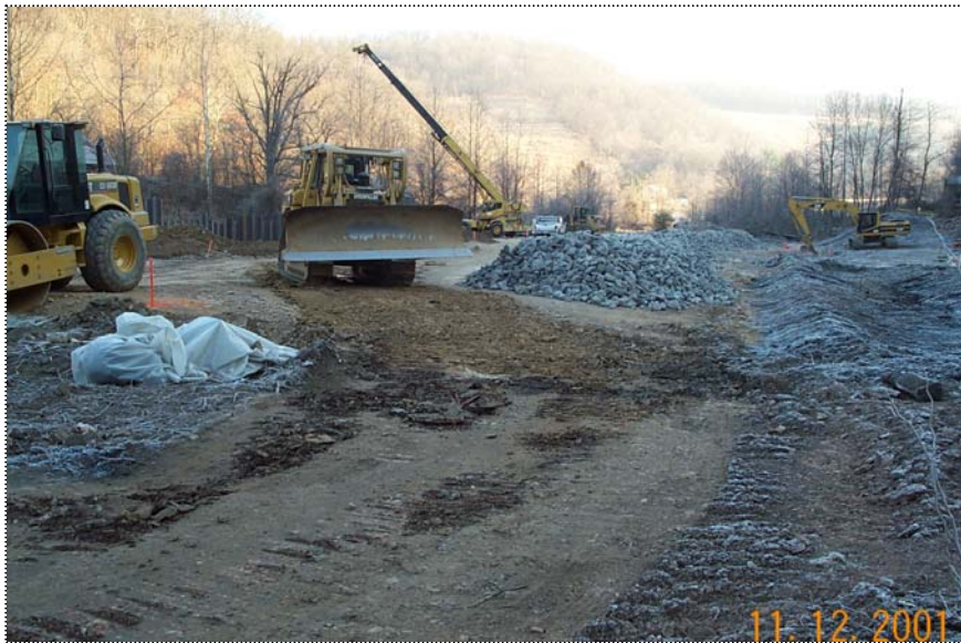
DCP1210 - Dozer scarifying frozen soil at the access to the fill