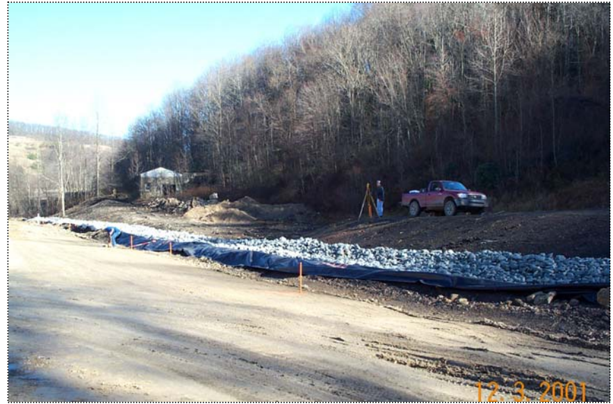
DCP1438 - View of Mountain State personnel installing grade stakes along the stone ditch for the cap material