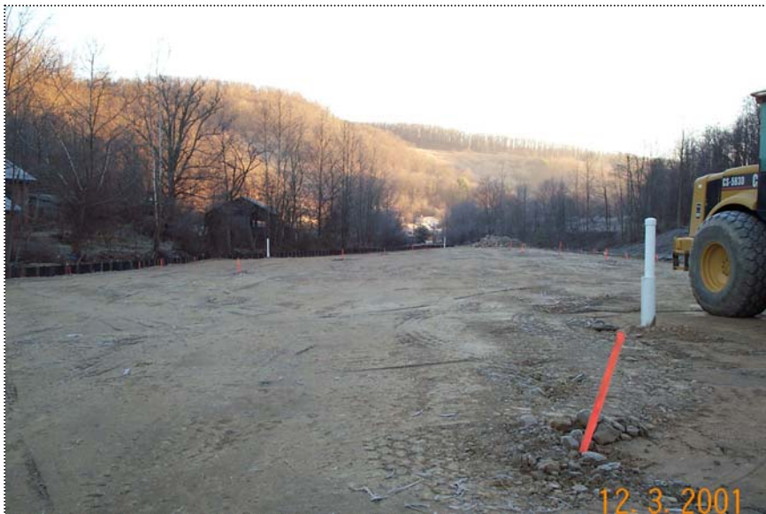
DCP1434 - General view looking downstream at the Northern half of the cap