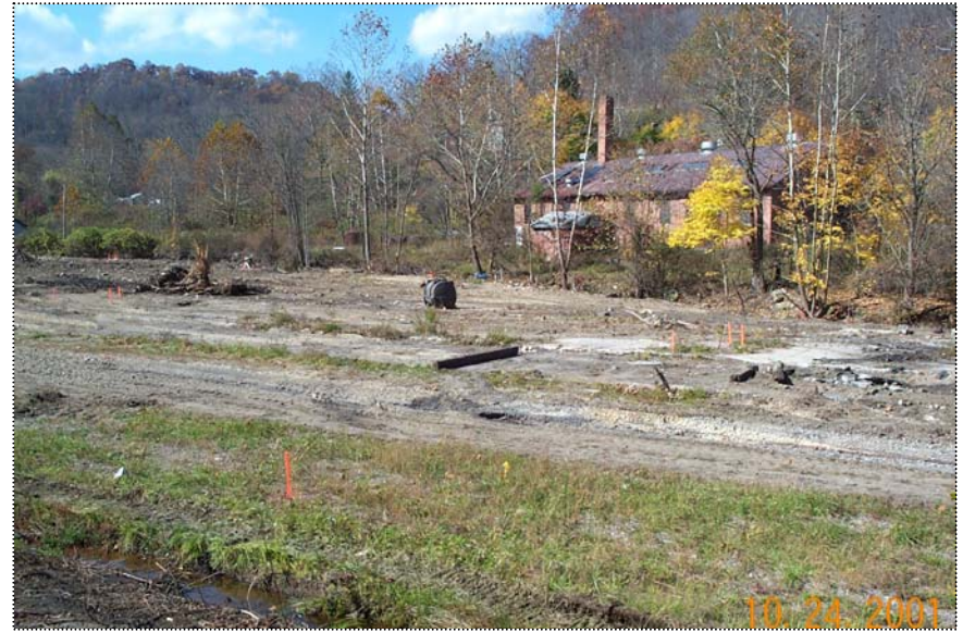
DCP1003 - General site view upstream, looking Northwest (left to right)