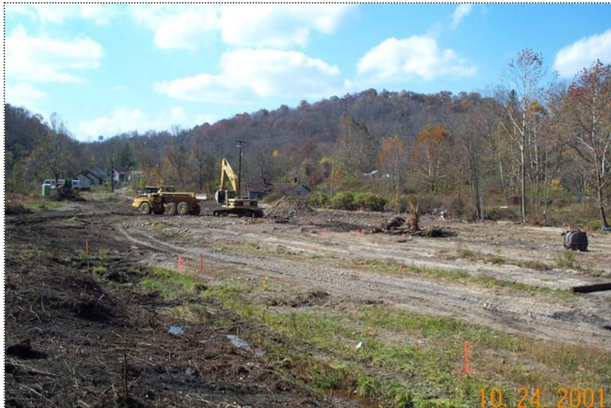
DCP1002 - General view looking West (upstream) of site operations