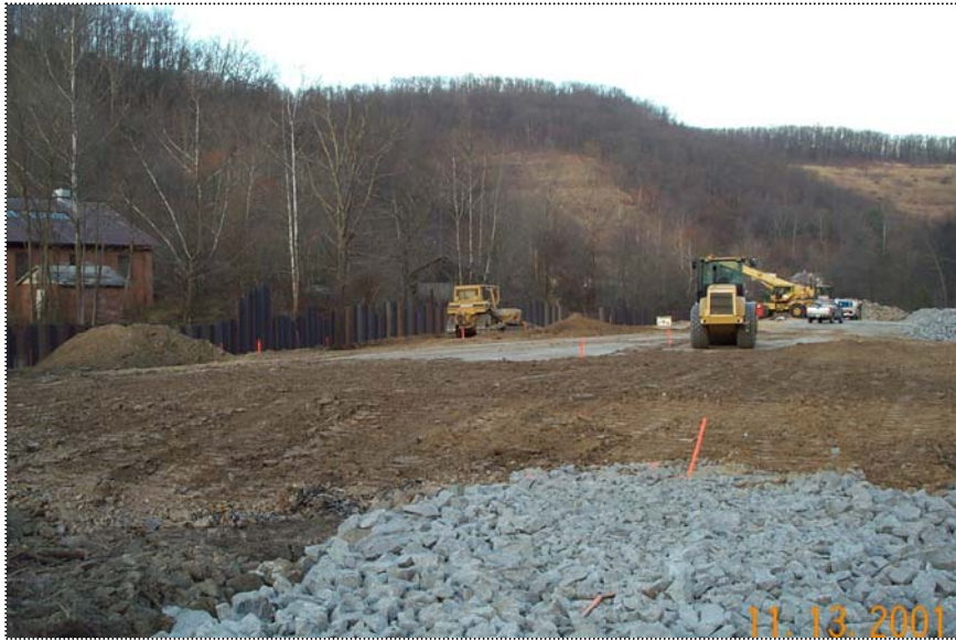
DCP1238 - General view of the Northern section of the site