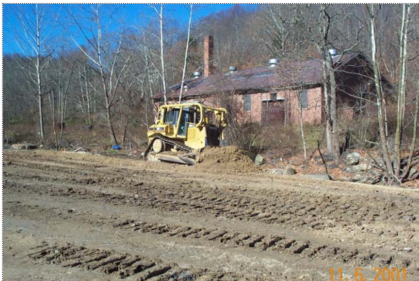
DCP1117 - Dozer making cut along Arbuckle creek