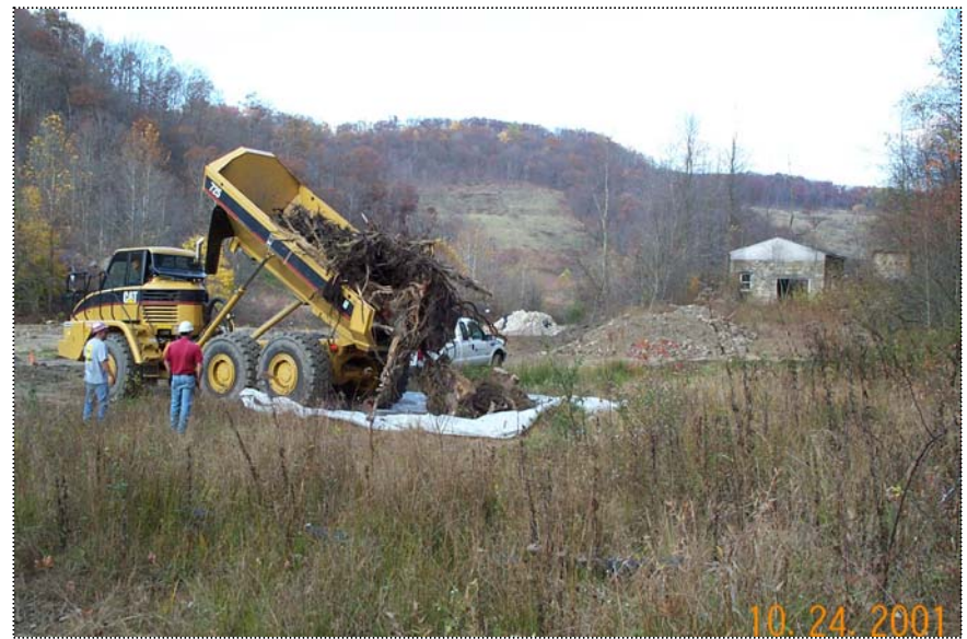
DCP1009 - View of Rock Truck placing stumps and roots in a cell