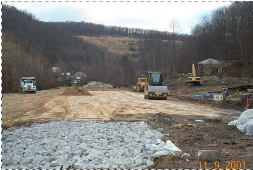
DCP1164 - General view of the Southern section of the site. The dozer is scarifying the Eastern half, while the roller compacts the Western