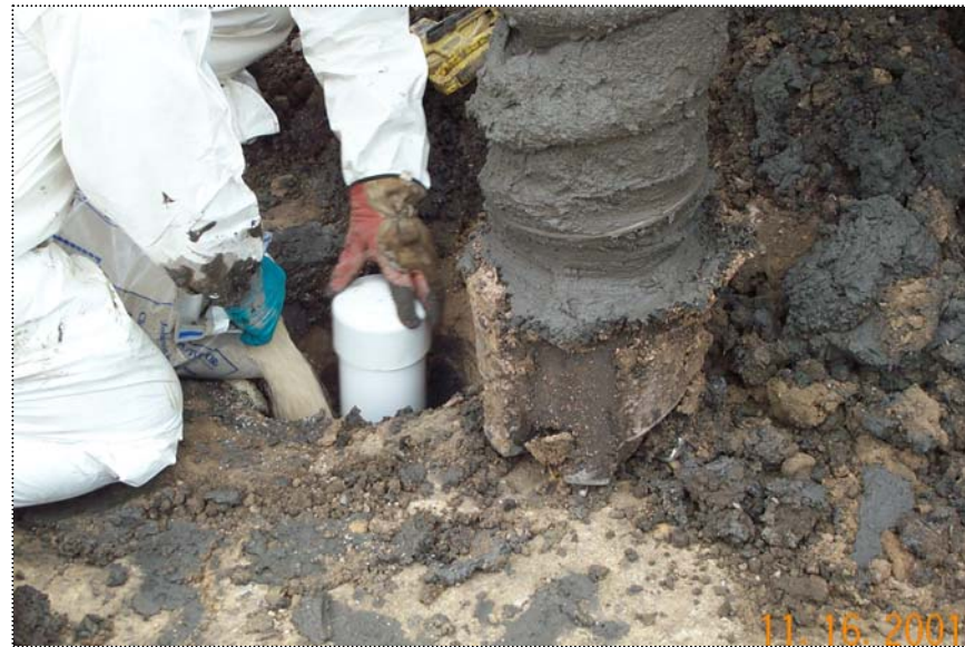
DCP1284 - Well SS-12 with casing installed and Triad placing filter pack