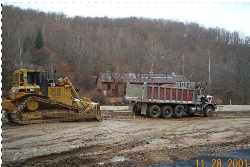
DCP1397 - Load of soil being dumped in front of the dozer for spreading