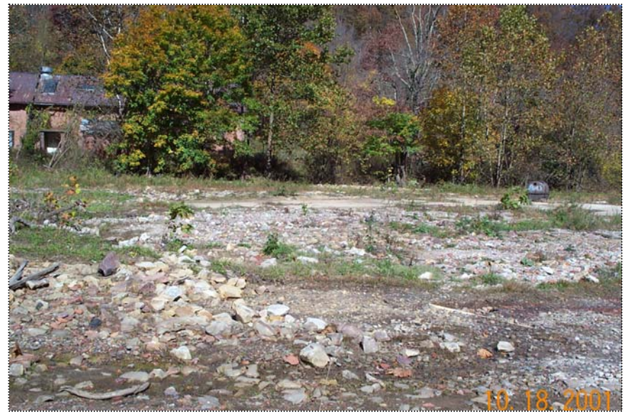
DCP0963 - General site view east of well MN-1 Piez