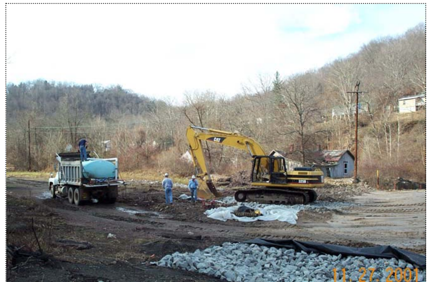
DCP1388 - WasteTron Personnel preparing to decon the Track Hoe