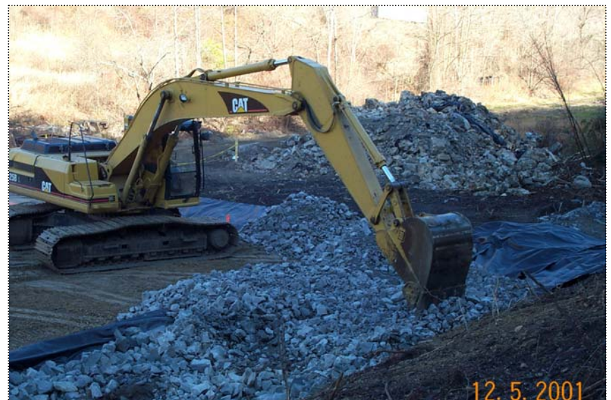
DCP1464 - Track Hoe spreading stone on the filter fabric in the ditch