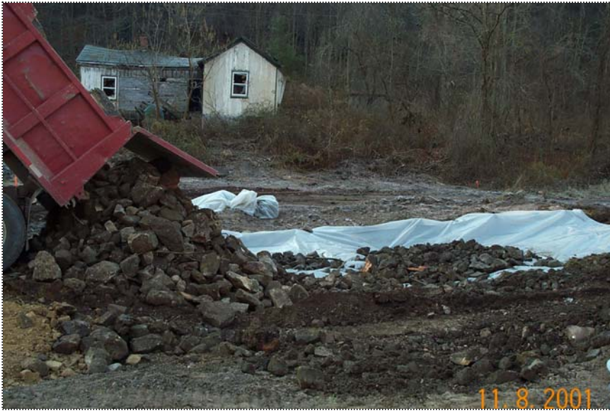
DCP1150 - View of the construction of the 2 nd decon pad. Truck dumping stone for the base of the pad