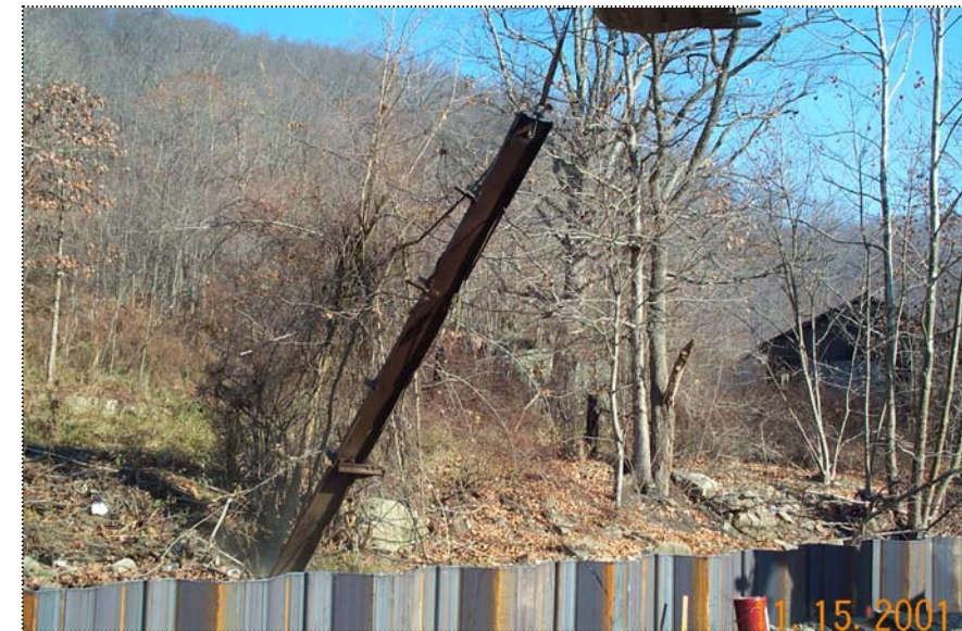
DCP1257 - Track Hoe removing 12-inch beam that laid across Arbuckle Creek