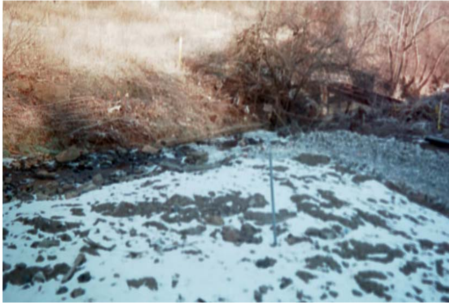
View of Northeastern corner of cap (Gasline is adjacent to this area)