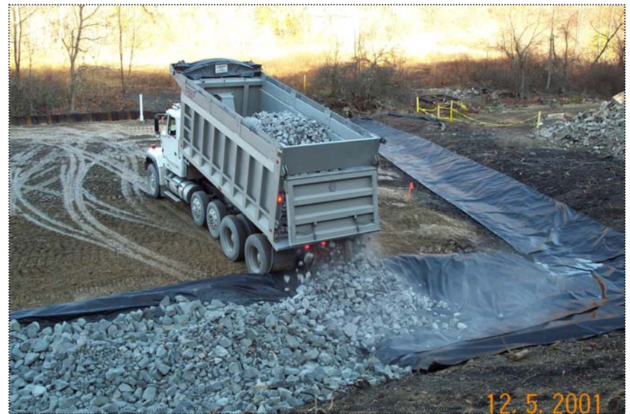
DCP1462 - Stone being dumped into the ditch