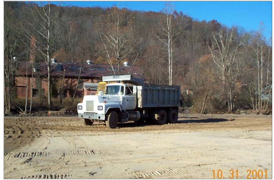
DCP01048 - Water truck wetting sub grade material for better compaction and dust control