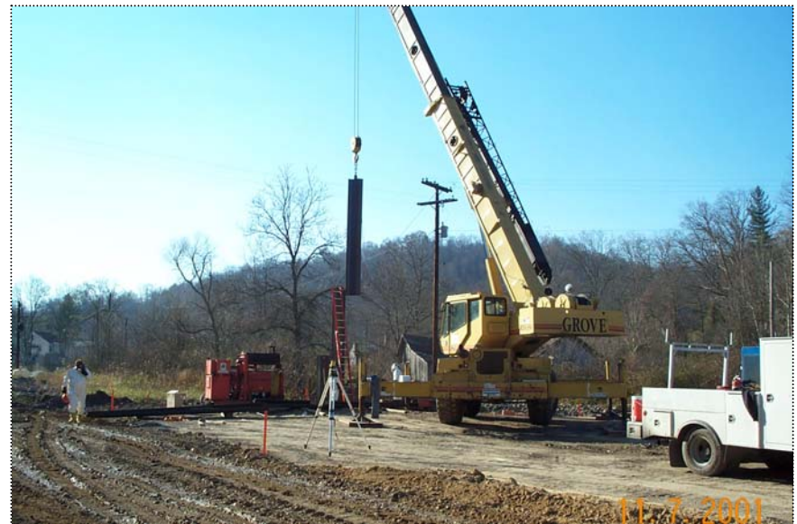
DCP1136 - View of the sheet starting in interlock