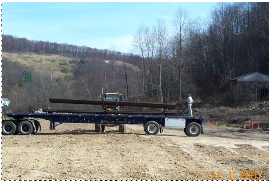
DCP01060 - IT28G off road fork unloading Sheet pile materials