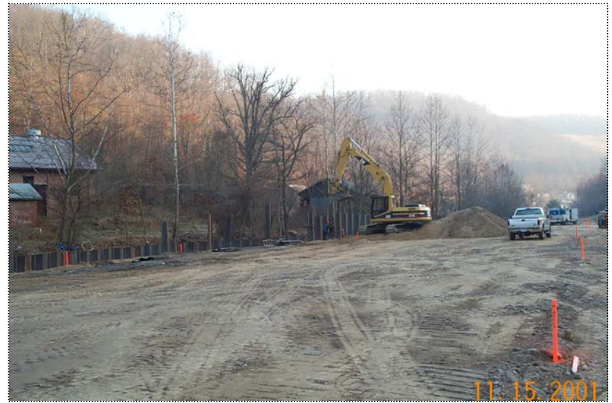
DCP1256 - General view of site operations