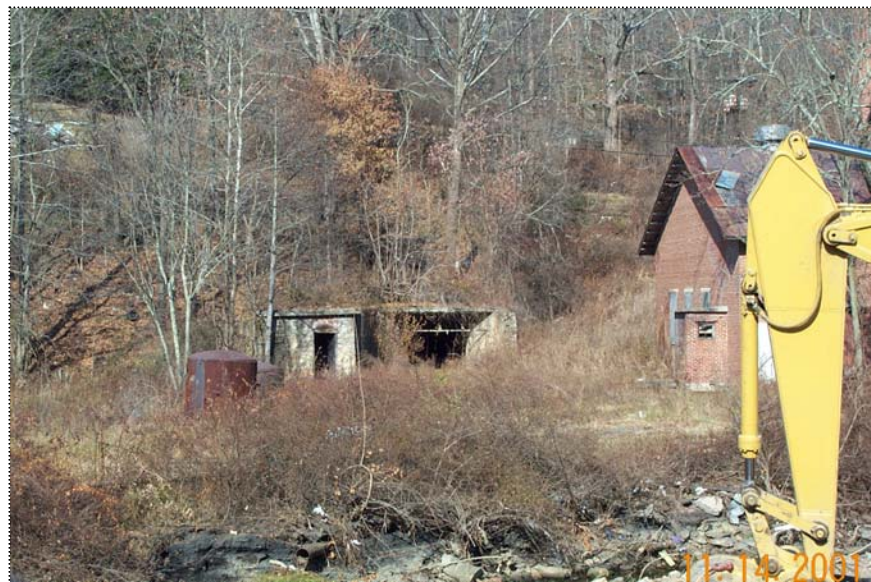
DCP1248 - View of the Coal Mine directly across from the site