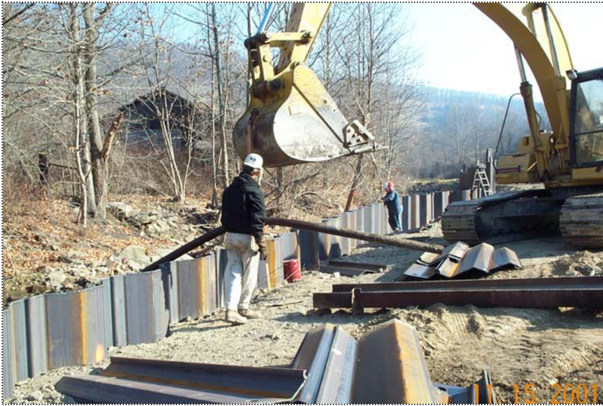
DCP1258 - View of Track Hoe removing a 4-inch pipe that laid across Arbuckle Creek