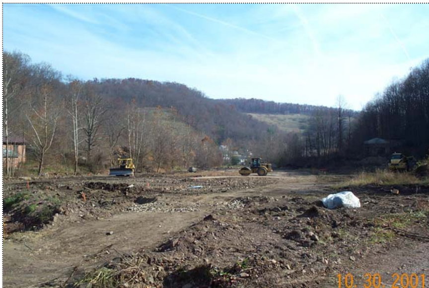
DCP01033 - D6R Dozer spreading sub base material, while CS5630 roller compacts the general site