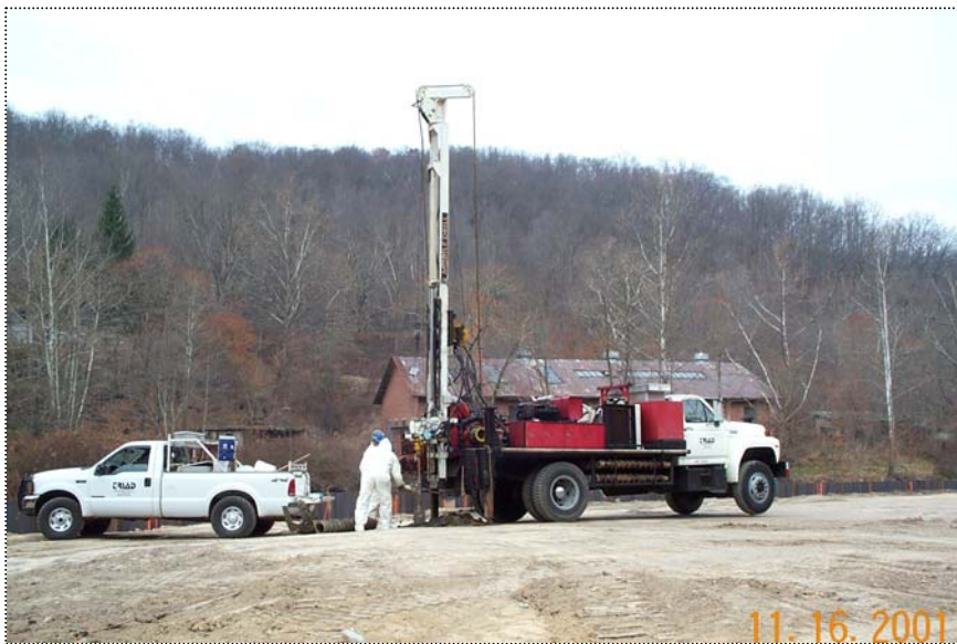
DCP1278 - Triad's drill setup to drill new well SS-12 at the West end of the site