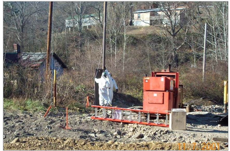
DCP1135 - Ahern ground personnel guiding sheet into position