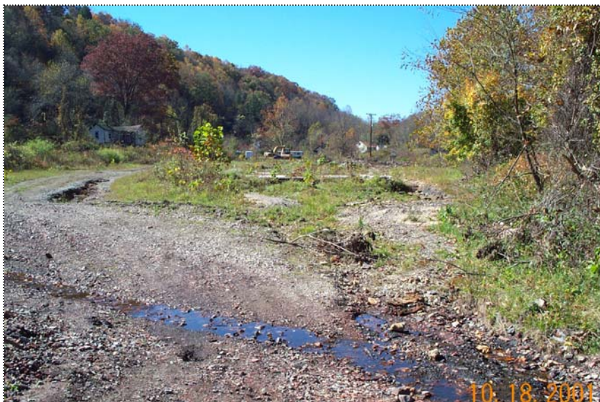
DCP0966 - General view of the site looking West, (Notice perched water lower right in picture)