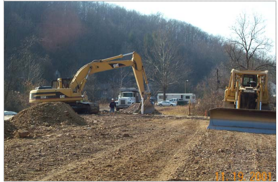
DCP1327 - Track Hoe removing excess cap material from around the wells