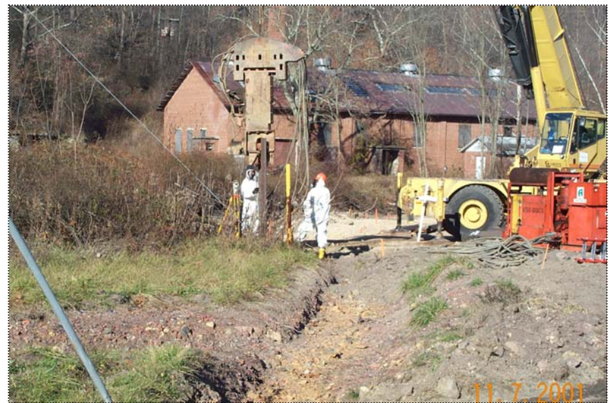
DCP1131 - Ahern personnel driving first sheet at level C