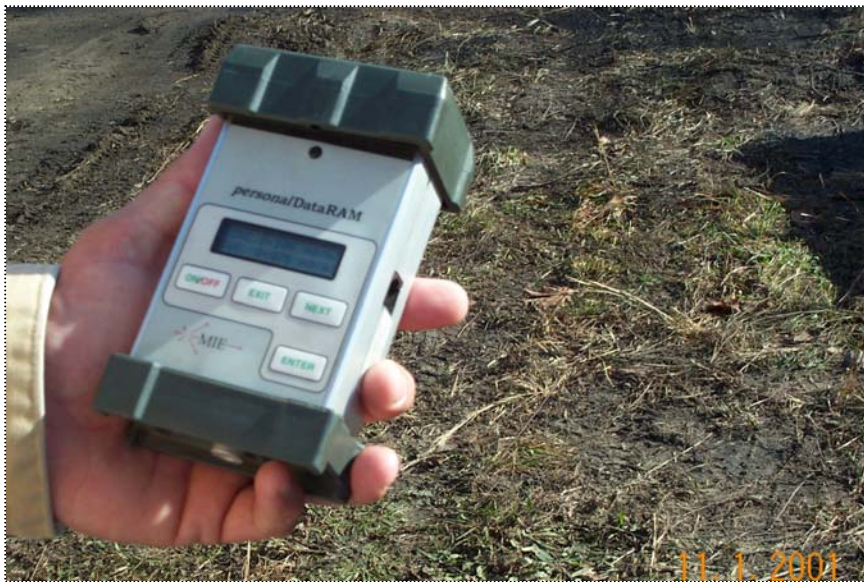
DCP01054 - View of a personnel /Data Ram, instrument measures the dust in the area