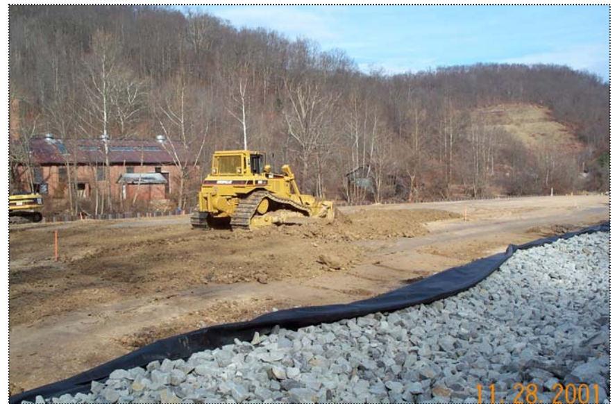
DCP1403 - Dozer spreading material on the southern section of the site