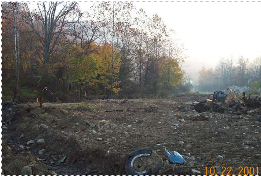
DCP0973 - General view looking West, (Downstream) along Arbuckle creek after clearing operations