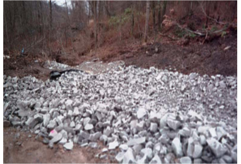
Southeast side of riprap ditch