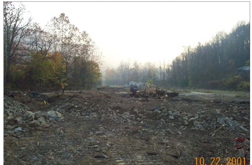
DCP0972 - General view of site, looking East, (Downstream) along the center line of the job