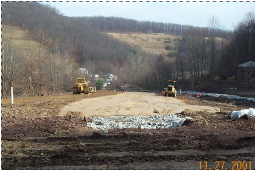
DCP1387 - General view of the area compacted/sealed by the roller