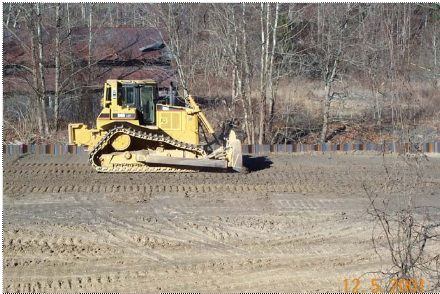
DCP1466 - Dozer grading the center section of the site, next to the center line