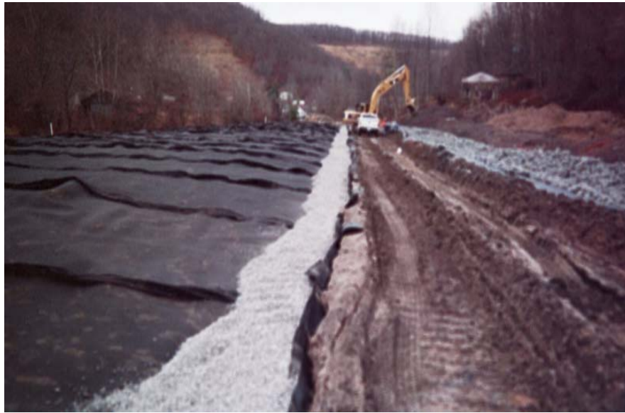
Installation of South Ditch