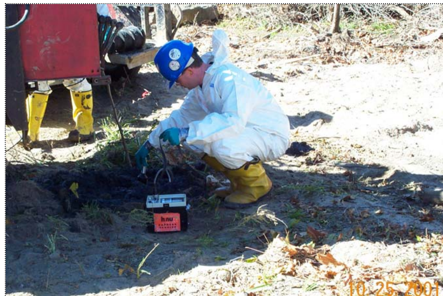
DCP01017 - Health and Safety from Triad checking MW-2 PIEZ with PID meter after casing removal