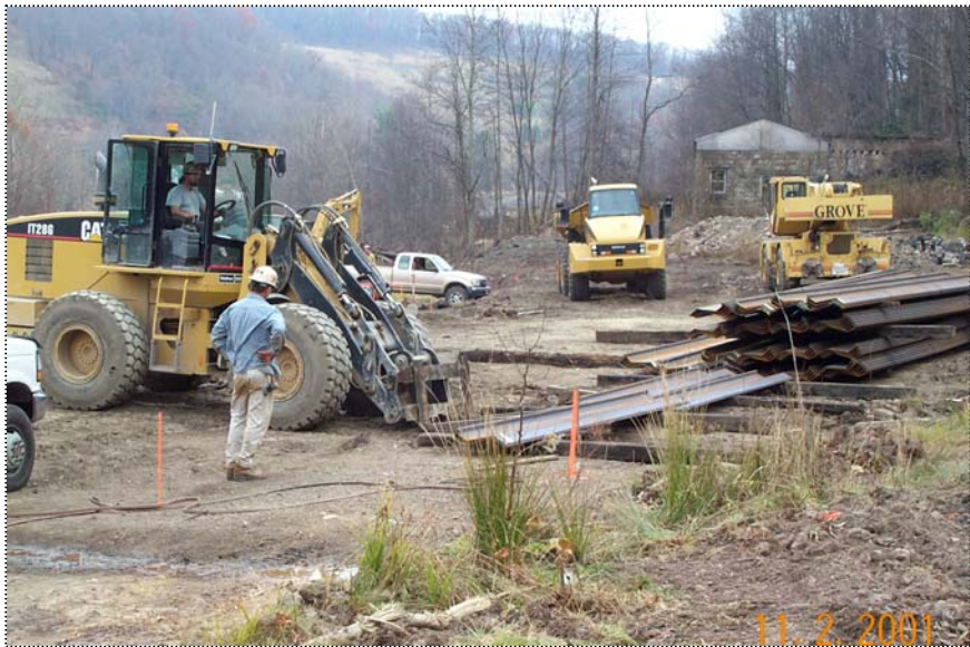
DCP01083 - Ahern equipment and personnel moving 32 foot sheets into position to be cut