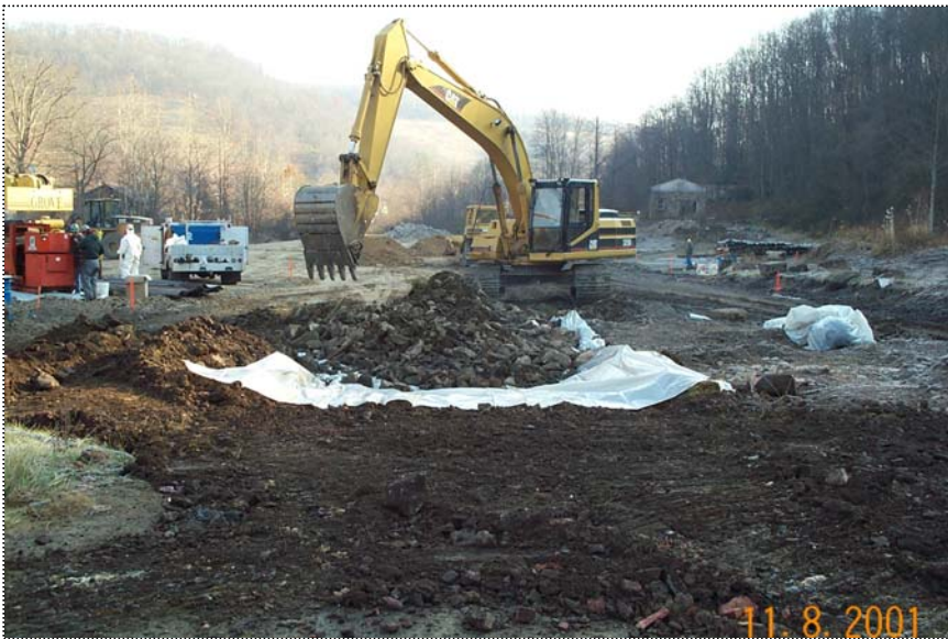
DCP1151 - Track Hoe placing stone for the base of the decon pad