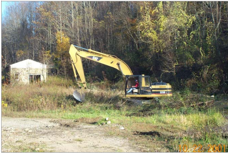
DCP0987 - Track Hoe clearing brush to enable the surveyors to lay out and stake the drainage features on the site.