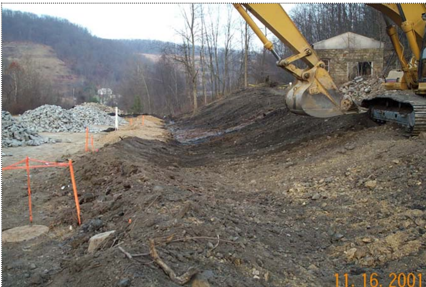
DCP1309 - View along the excavation for the stone ditch