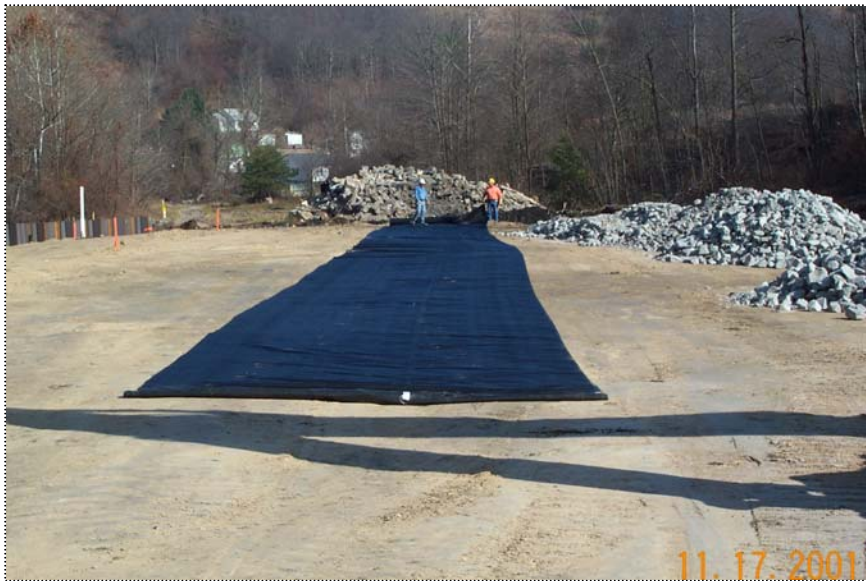
DCP1319 - WasteTron personnel laying out filter fabric for the length of the ditch