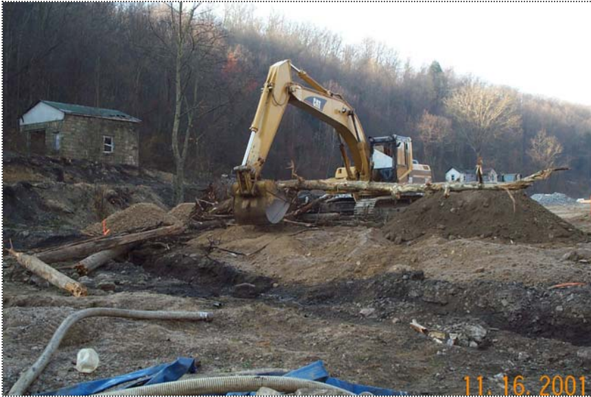
DCP1270 - Track Hoe pulling trees, rail road ties and other materials on the east edge of the sub base for loading