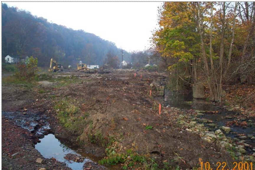
DCP0974 - General view of site looking west, (Upstream) along Arbuckle creek after clearing operations