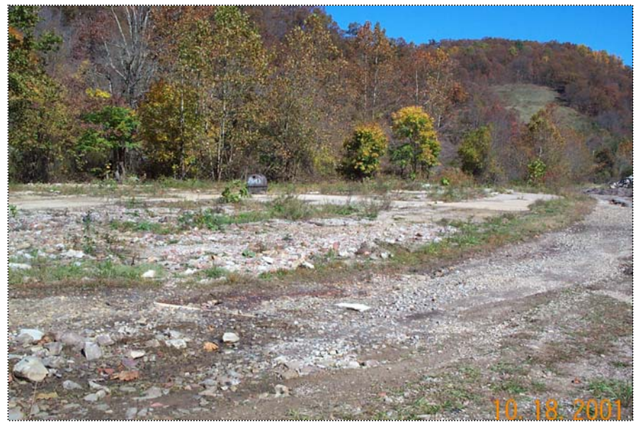
DCP0964 - General overview of the site looking downstream (northeast)