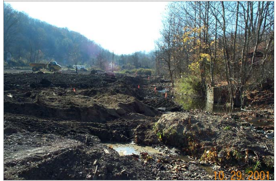
DCP01026 – View of the excavation looking West, (upstream)