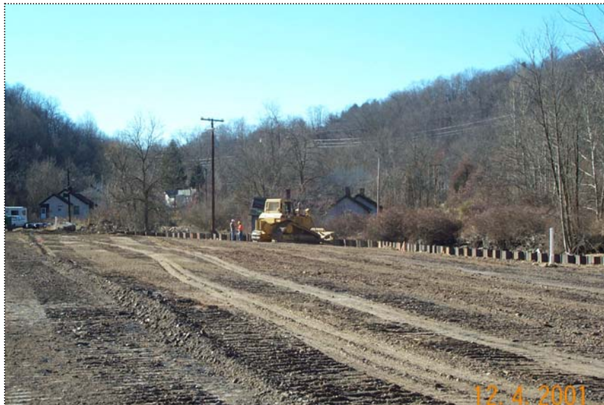
DCP1451 - Dozer grading around the wells on the Western end of the site