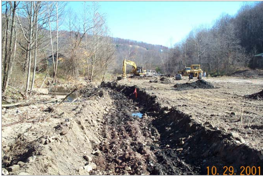
DCP01024 - Close up view of the excavation of the sheet Pile alignment