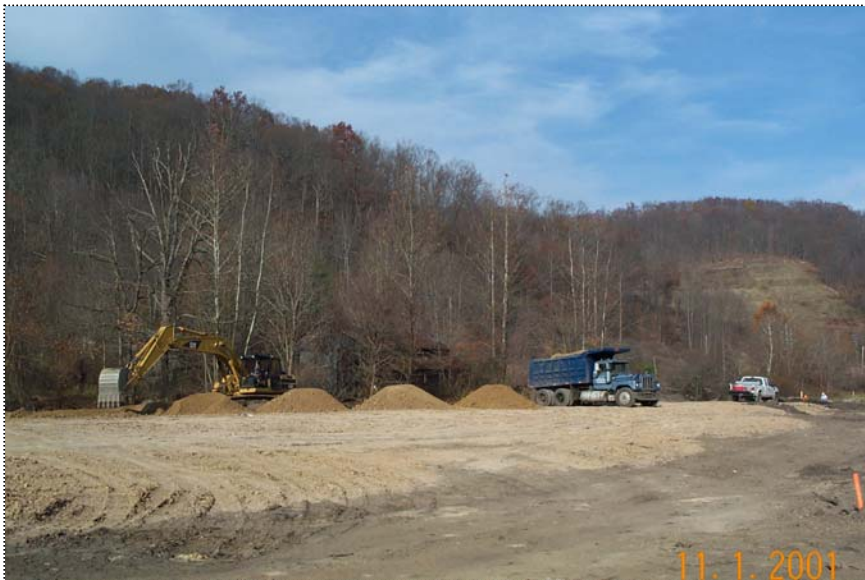
DCP01077 - View of the Track Hoe placing fill in the sheet pile alignment trench and trucks delivering soil