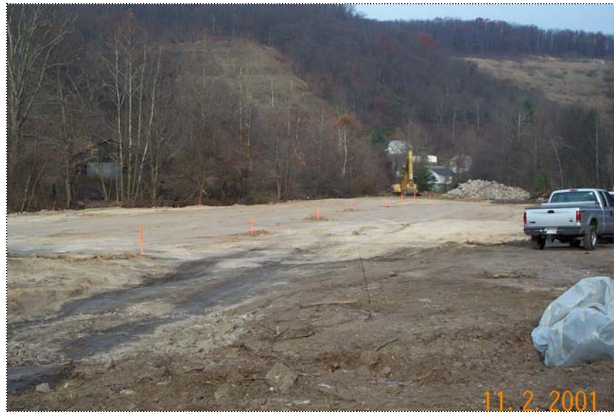
DCP01086 - General view looking downstream (east) at the site