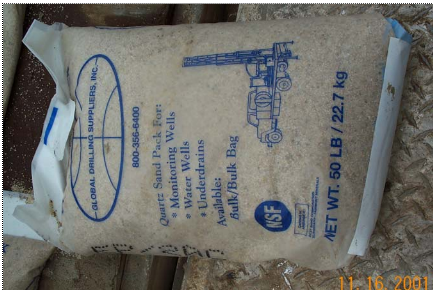
DCP1283 - 50 LB bag of filter sand for the filter pack