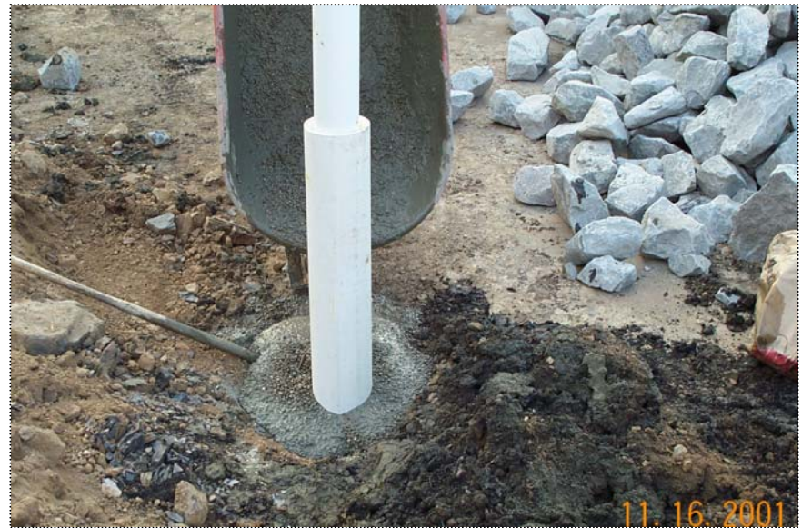
DCP1306 - Triad personnel placing concrete around MW-6