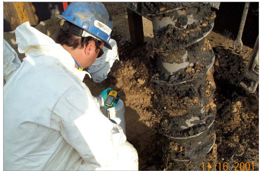
DCP1296 - Triad's driller using a GPS for well location