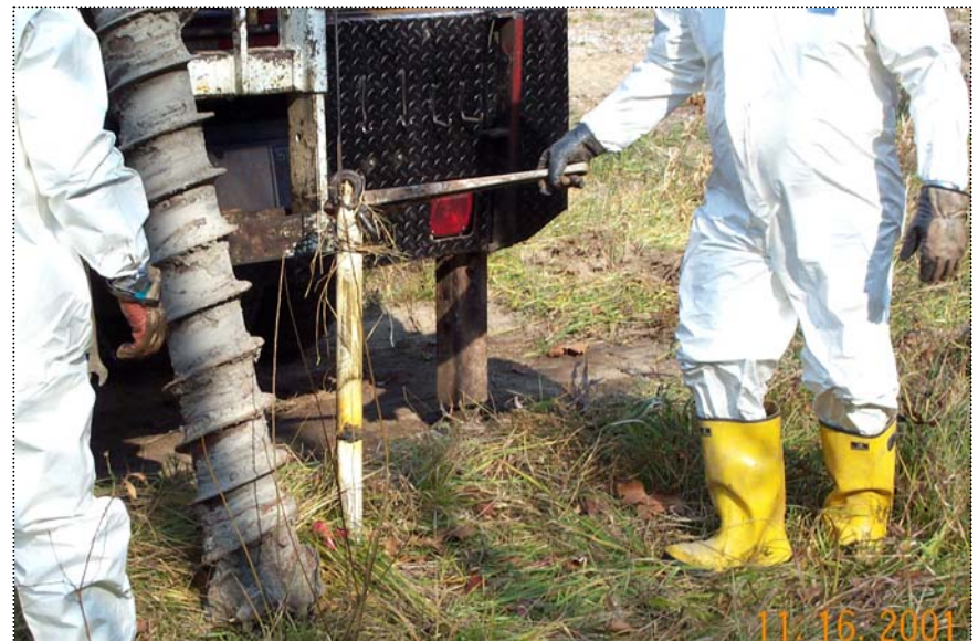
DCP1276 - View of the MW-7's casing coming out of the ground