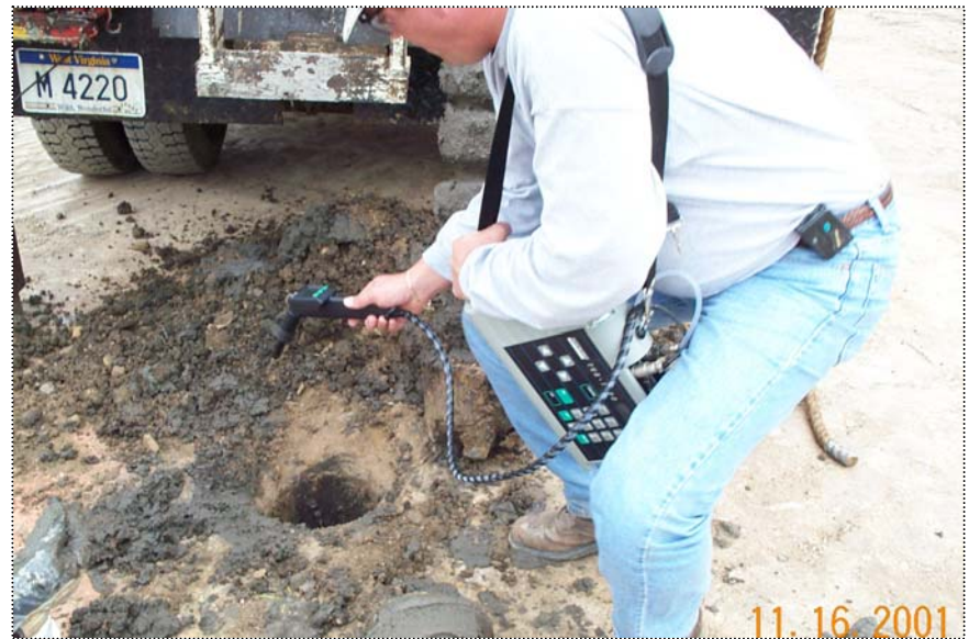
DCP1280 - Health and Safety checking bore hole with PID