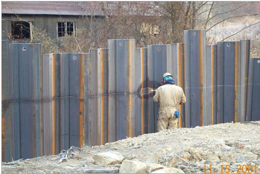
DCP1254 - Ahern Personnel cutting sheets to final grade