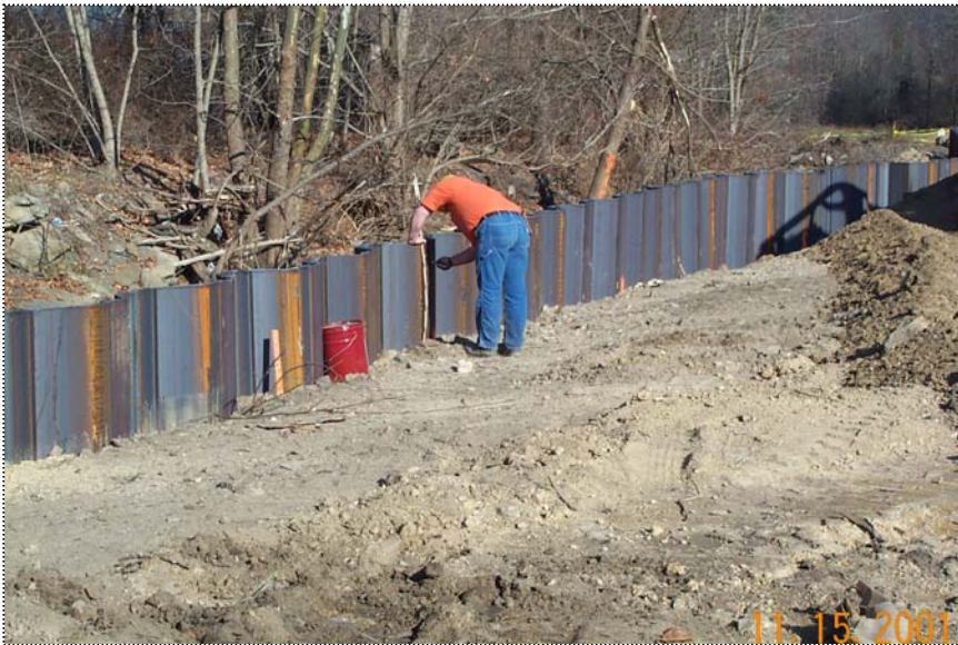
DCP1261 - WasteTron personnel marking cut/fills on each sheet of the sheet pile wall