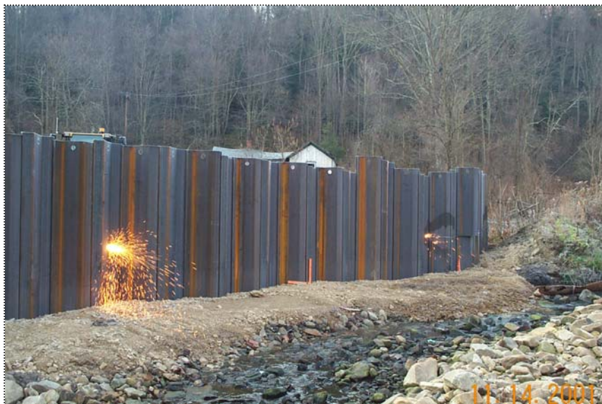
DCP1243 - View of the Arbuckle Creek side of the sheet pile wall during cutting operations