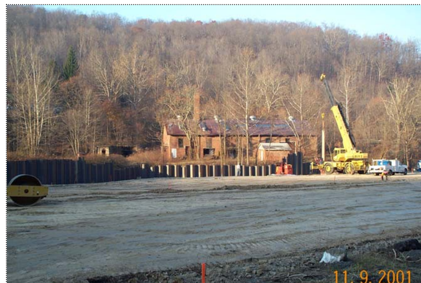
DCP1181 - General view of the sheet pile wall