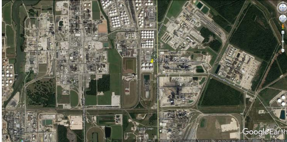
Figure 1: ITC, Deer Park, TX

ASPECT response to this Mission/Incident was in support of: