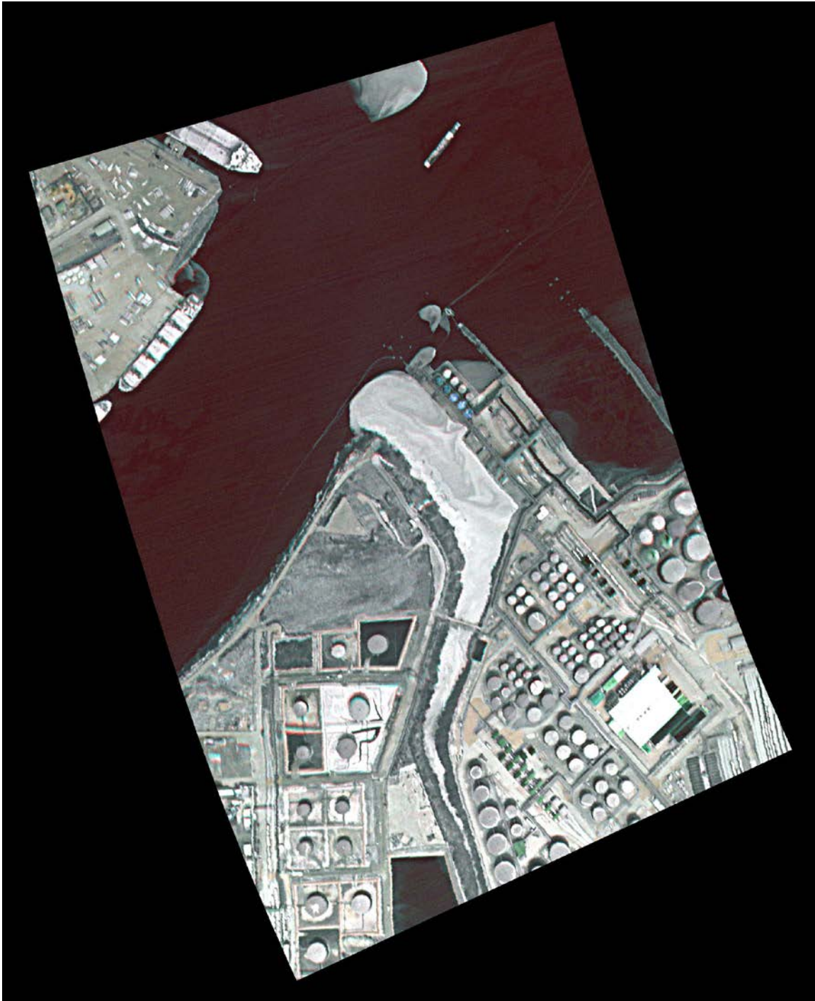
Figure 5: IR Image of Contained Oil 25 March 2019, Fight 12, Run 6