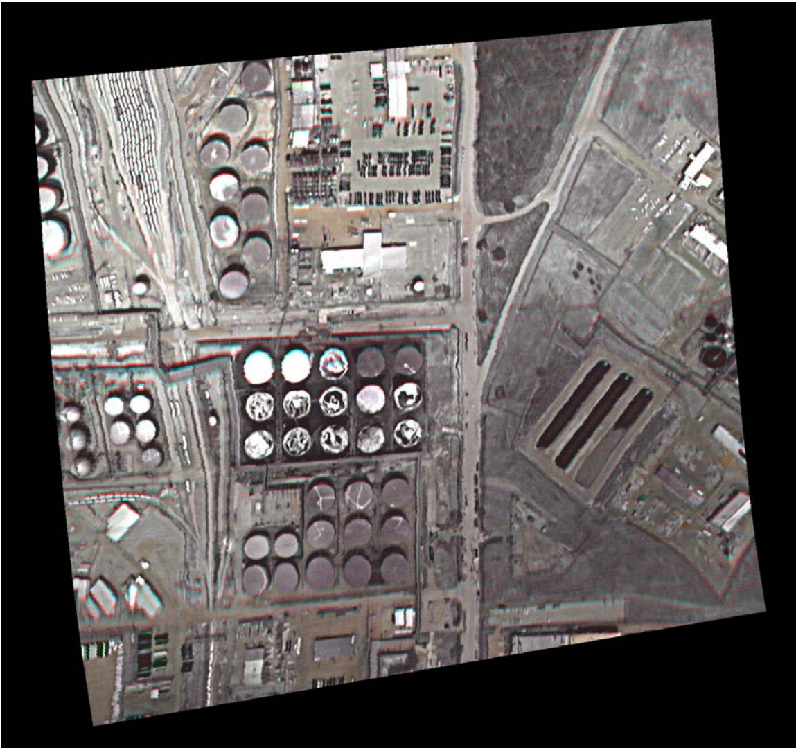
Figure 3: IR image of ITC data for 25 March 2019, Flight 12 Run 5