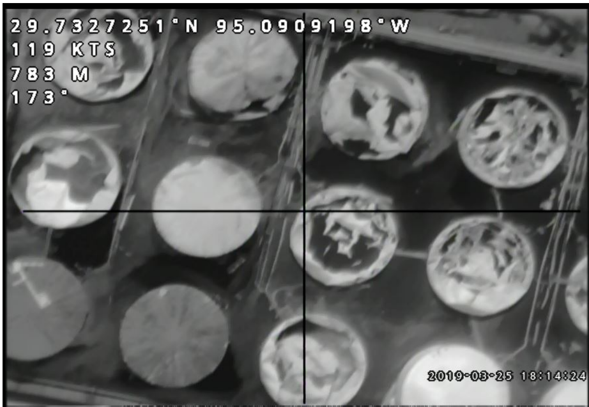
Figure 4: IR Thermal Analysis 25 March 2019, Flight 12, Run 5