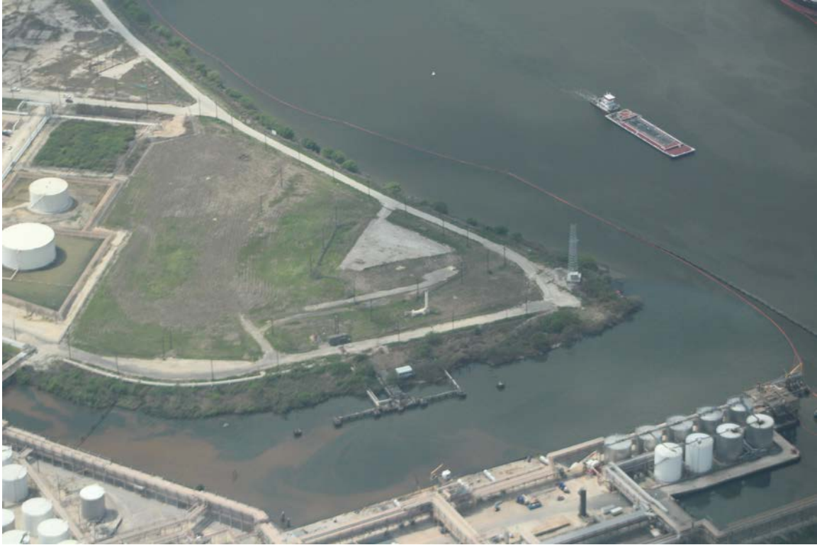
Figure 7: Oblique Image of the Ship Channel Boom Area, 23 March 2019, Flight 10