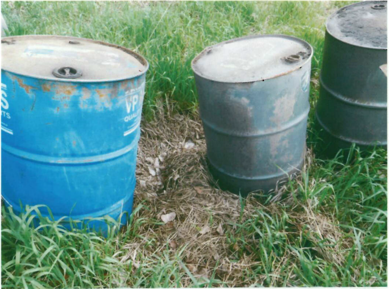
Photo 1169, DSCN1169.jpg, 5/15/2019 9:41 am, photo of stressed vegetation in between drums.

Facility Name: Lodge Grass Drum Site Facility Location: Lat/Long: 45.305631, -107.359759 Date of Inspection: May 15, 2019