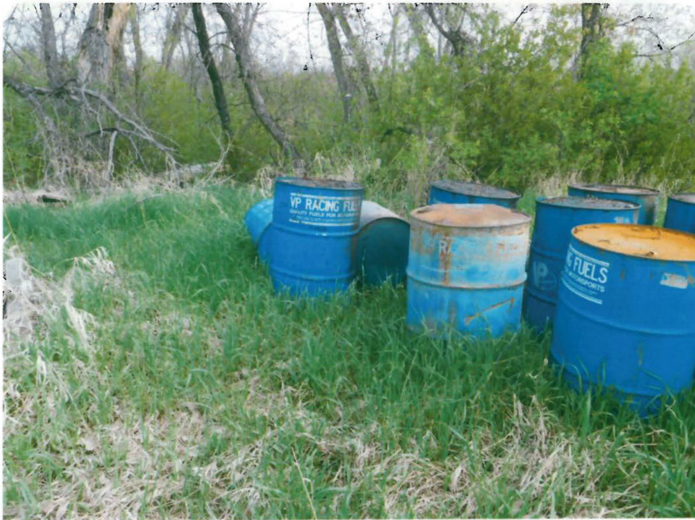
Photo 1163, DSCN1163.jpg, 5/15/2019 9:40 am, photo of westernmost section of drums. Photo includes two drums on their sides and one drum with a bulging top.

Facility Name: Lodge Grass Drum Site Facility Location: Lat/Long: 45.305631, -107.359759 Date of Inspection: May 15, 2019