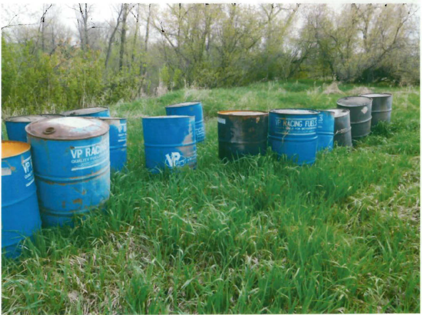
Photo 1165, DSCN1165.jpg, 5/15/2019 9:40 am, photo of easternmost section of drums.

Facility Name: Lodge Grass Drum Site Facility Location: Lat/Long: 45.305631, -107.359759 Date of Inspection: May 15, 2019