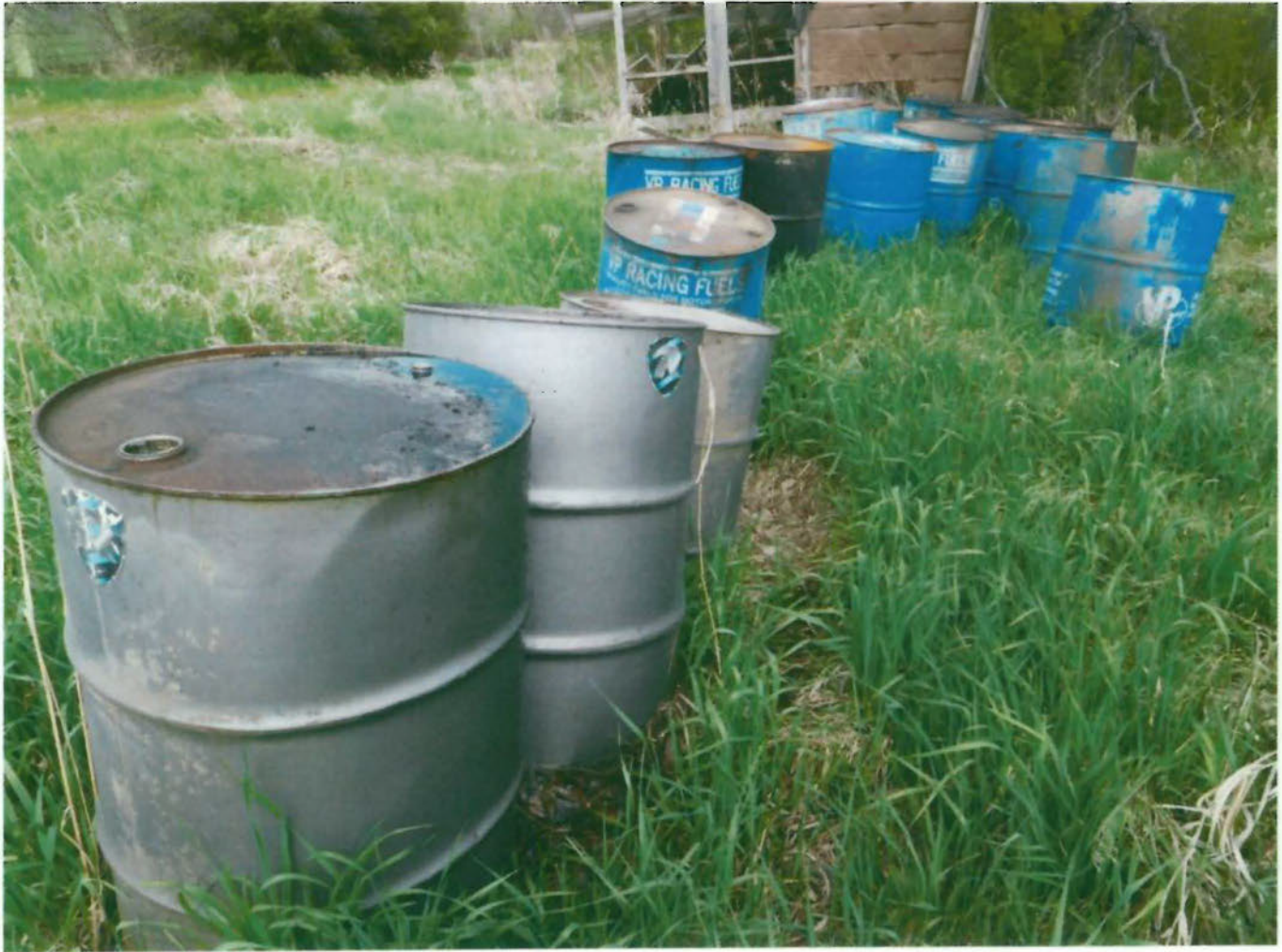
Photo 1177, DSCN1177.jpg, 5/15/2019 9:50 am, photo of all 20 drums, taken facing west.

Facility Name: Lodge Grass Drum Site Facility Location: Lat/Long: 45.305631, -107.359759 Date of Inspection: May 15, 2019