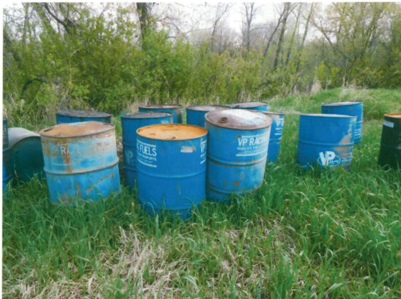
Photo 1164, DSCN1164.jpg, 5/15/2019 9:40 am, photo central section of drums, including two drums with bulging tops (one of which was also shown in photo 1163).

Facility Name: Lodge Grass Drum Site Facility Location: Lat/Long: 45.305631, -107.359759 Date of Inspection: May 15, 2019