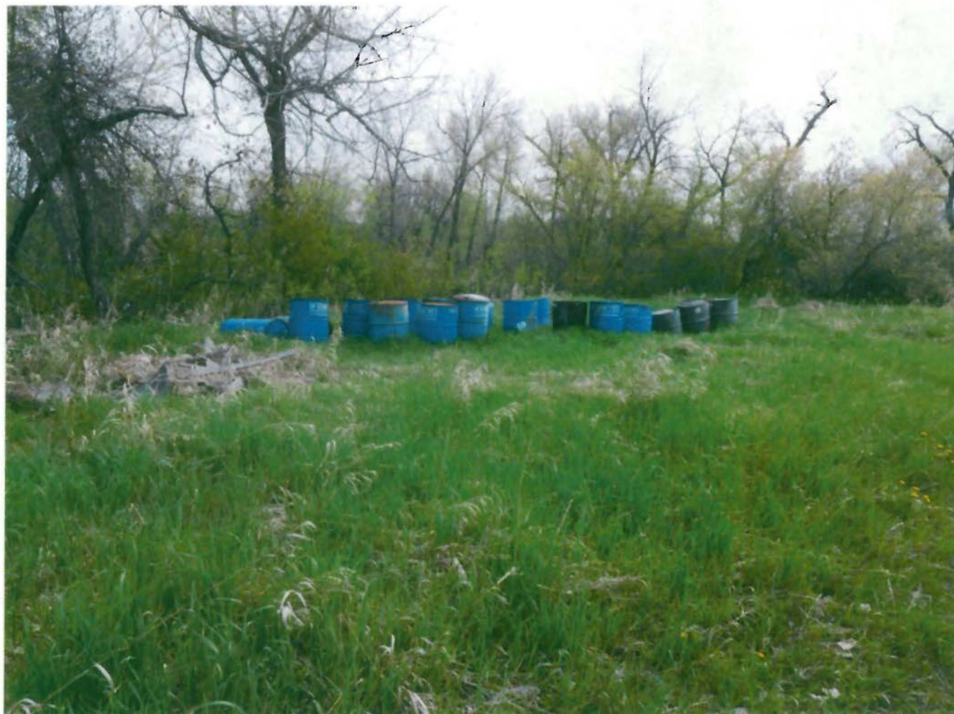
Photo 1162, DSCN1162.jpg, 5/15/2019 9:39 am, photo of drums, showing all 20 drums. Photo taken facing north/northeast.

Facility Name: Lodge Grass Drum Site Facility Location: Lat/Long: 45.305631, -107.359759 Date of Inspection: May 15, 2019