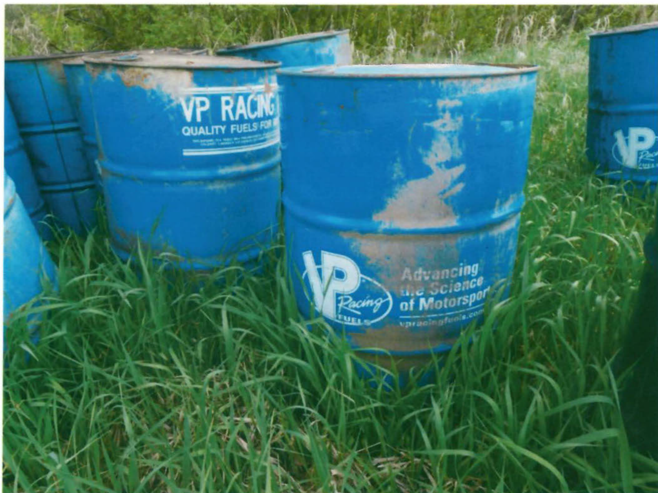
Photo 1168, DSCN1168.jpg, 5/15/2019 9:41 am, photo of drum labeling.

Facility Name: Lodge Grass Drum Site Facility Location: Lat/Long: 45.305631, -107.359759 Date of Inspection: May 15, 2019