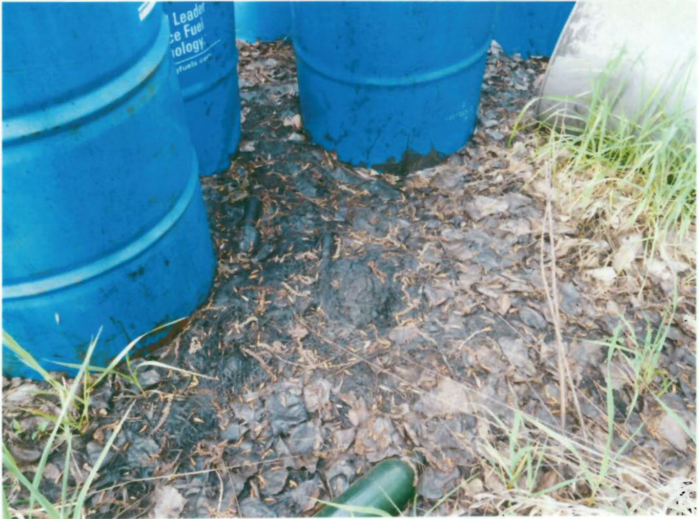
Photo 1173, DSCN1173.jpg, 5/15/2019 9:42 am, photo of spilled or leaked oily-looking waste on ground on north side of drum area

Facility Name: Lodge Grass Drum Site Facility Location: Lat/Long: 45.305631, -107.359759 Date of Inspection: May 15, 2019