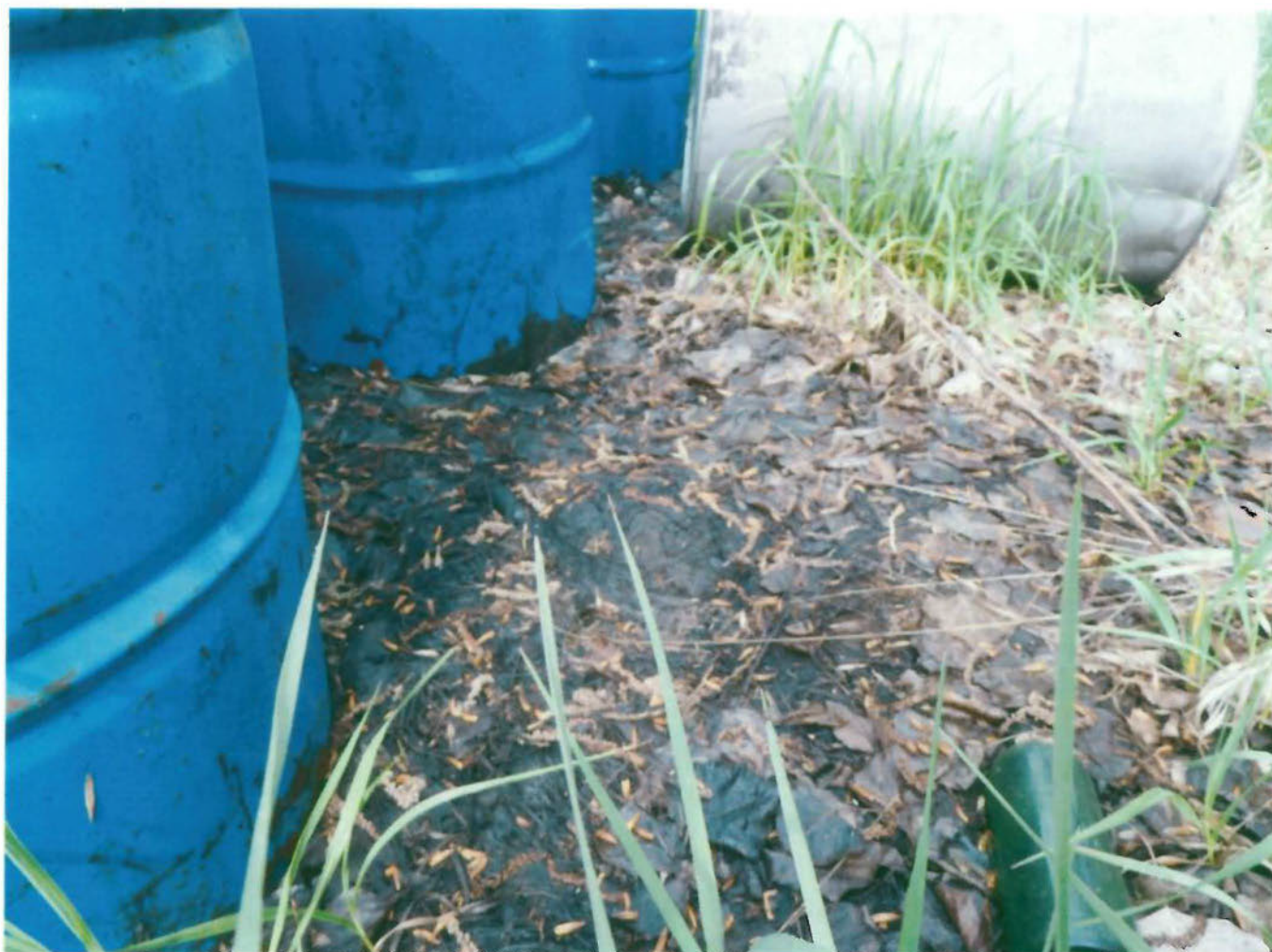
Photo 1174, DSCN1174.jpg, 5/15/2019 9:46 am, photo of spilled or leaked oily-looking waste on ground on north side of drum area.

Facility Name: Lodge Grass Drum Site Facility Location: Lat/Long: 45.305631, -107.359759 Date of Inspection: May 15, 2019