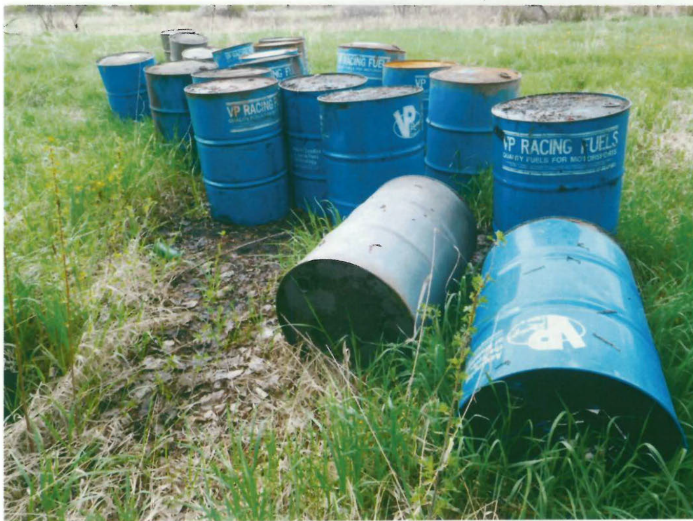
Photo 1167, DSCN1167.jpg, 5/15/2019 9:41 am, photo of all 20 drums, taken facing southeast.

Facility Name: Lodge Grass Drum Site Facility Location: Lat/Long: 45.305631, -107.359759 Date of Inspection: May 15, 2019