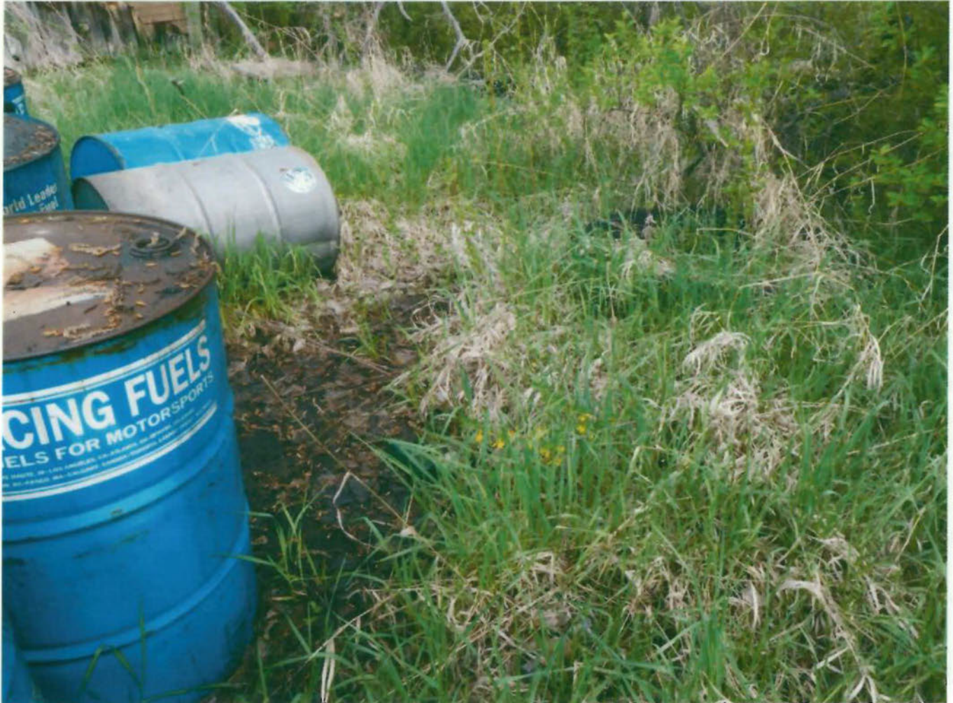
Photo 1172, DSCN1172.jpg, 5/15/2019 9:42 am, photo of spilled or leaked oily-looking waste on ground on north side of drum area.

Facility Name: Lodge Grass Drum Site Facility Location: Lat/Long: 45.305631, -107.359759 Date of Inspection: May 15, 2019