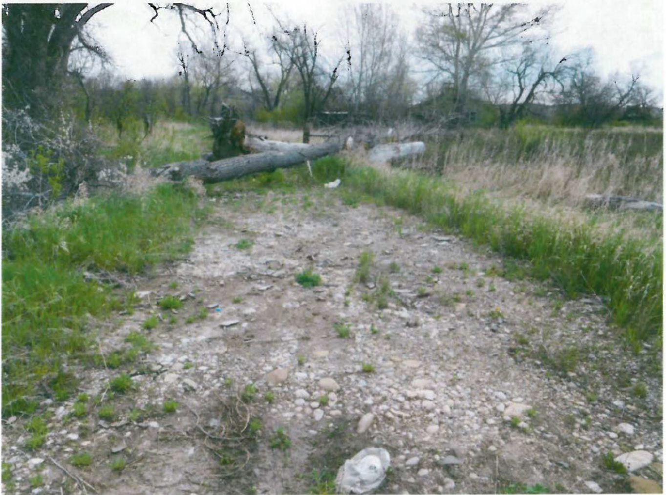
Photo 1159, DSCN1159.jpg, 5/15/2019 9:37 am, photo of driveway leading to area where drums are located. A fallen tree blocks vehicle access to the site. Photo taken facing east.

Camera Model and ID: Nikon Coolpix S7000, B00227