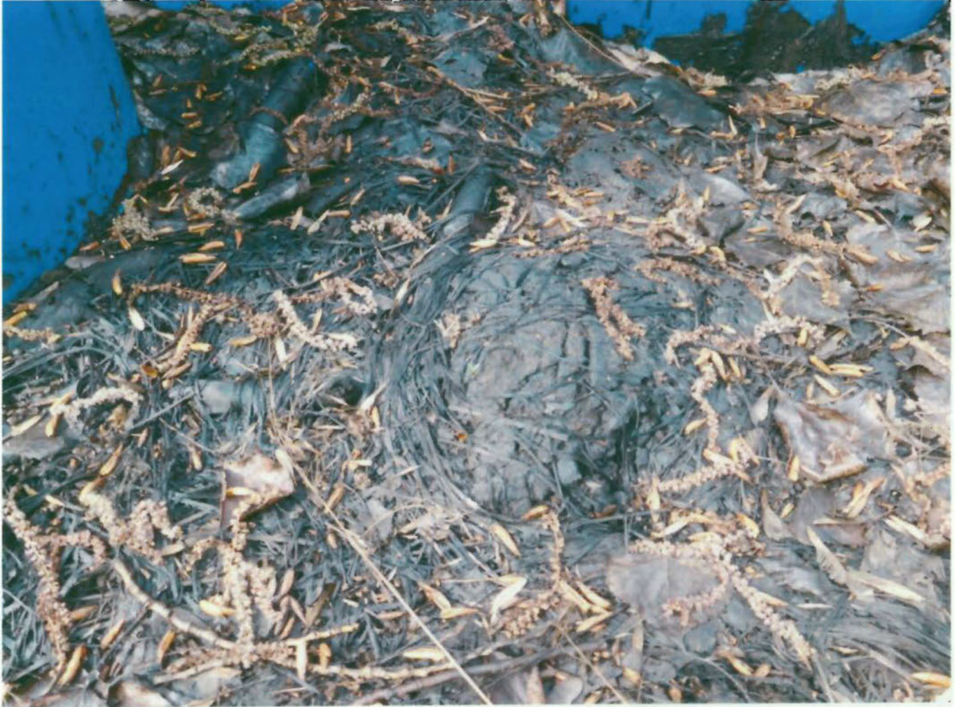
Photo 1175, DSCN1175.jpg, 5/15/2019 9:46 am, photo of spilled or leaked oily-looking waste on ground on north side of drum area.

Facility Name: Lodge Grass Drum Site Facility Location: Lat/Long: 45.305631, -107.359759 Date of Inspection: May 15, 2019