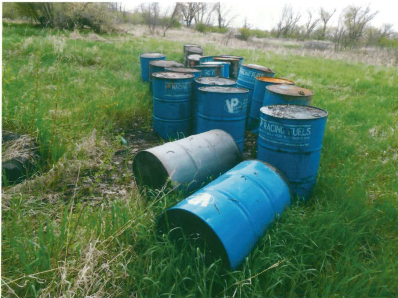
Photo 1166, DSCN1166.jpg, 5/15/2019 9:40 am, photo of all 20 drums, taken facing south.

Facility Name: Lodge Grass Drum Site Facility Location: Lat/Long: 45.305631, -107.359759 Date of Inspection: May 15, 2019