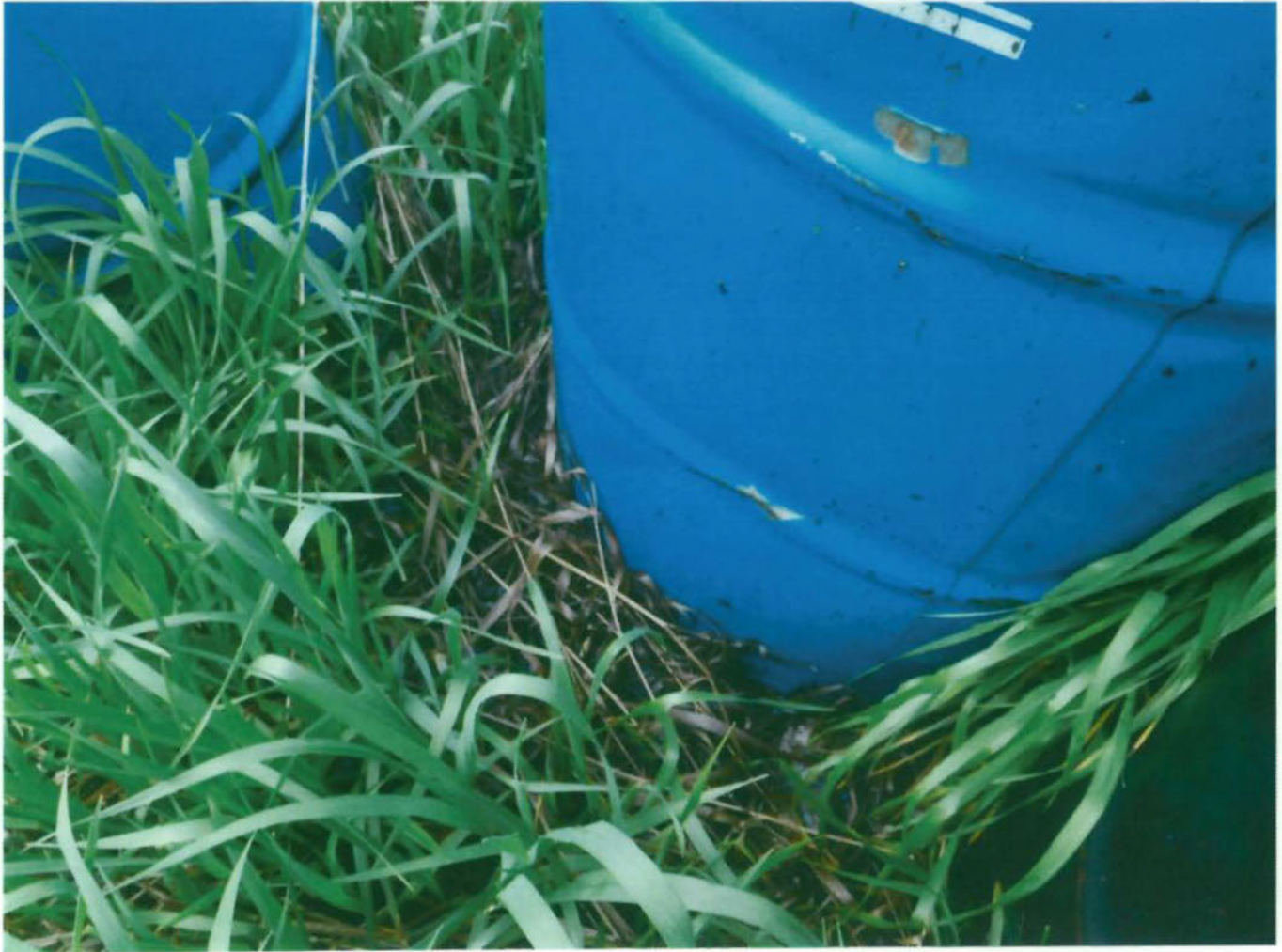
Photo 1181, DSCN1181.jpg, 5/15/2019 9:51 am, photo of stressed vegetation.

Facility Name: Lodge Grass Drum Site Facility Location: Lat/Long: 45.305631, -107.359759 Date of Inspection: May 15, 2019