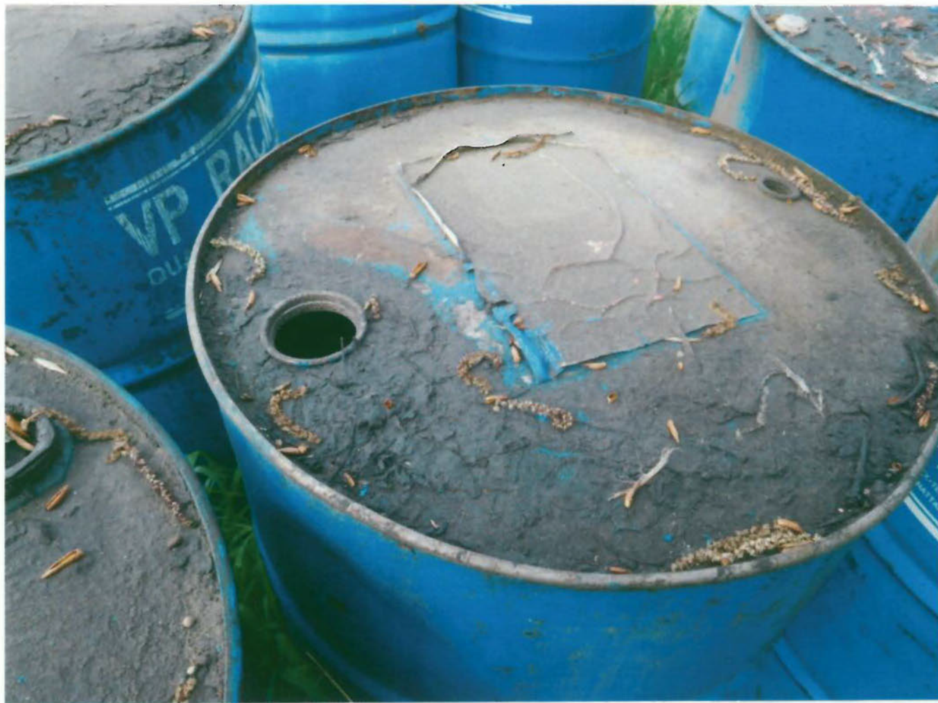
Photo 1171, DSCN1171.jpg, 5/15/2019 9:42 am, photo of an open drum.

Facility Name: Lodge Grass Drum Site Facility Location: Lat/Long: 45.305631, -107.359759 Date of Inspection: May 15, 2019