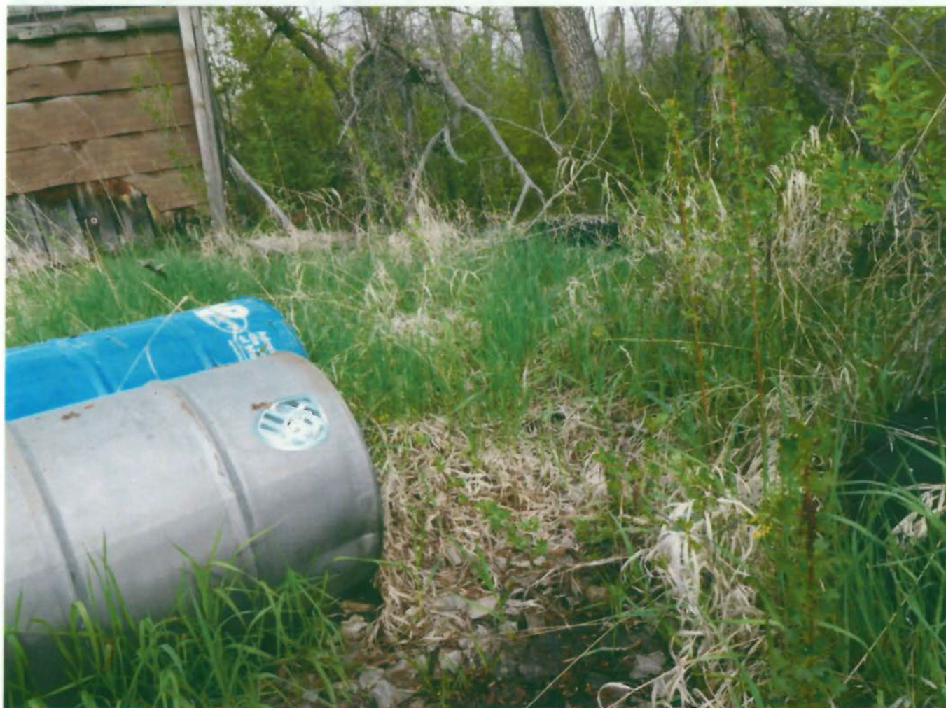
Photo 1176, DSCN1176.jpg, 5/15/2019 9:46 am, photo of spilled or leaked oily-looking waste on ground on north side of drum area, facing toward lower-elevation area located approximately 15 feet to the north of the drums.

Facility Name: Lodge Grass Drum Site Facility Location: Lat/Long: 45.305631, -107.359759 Date of Inspection: May 15, 2019