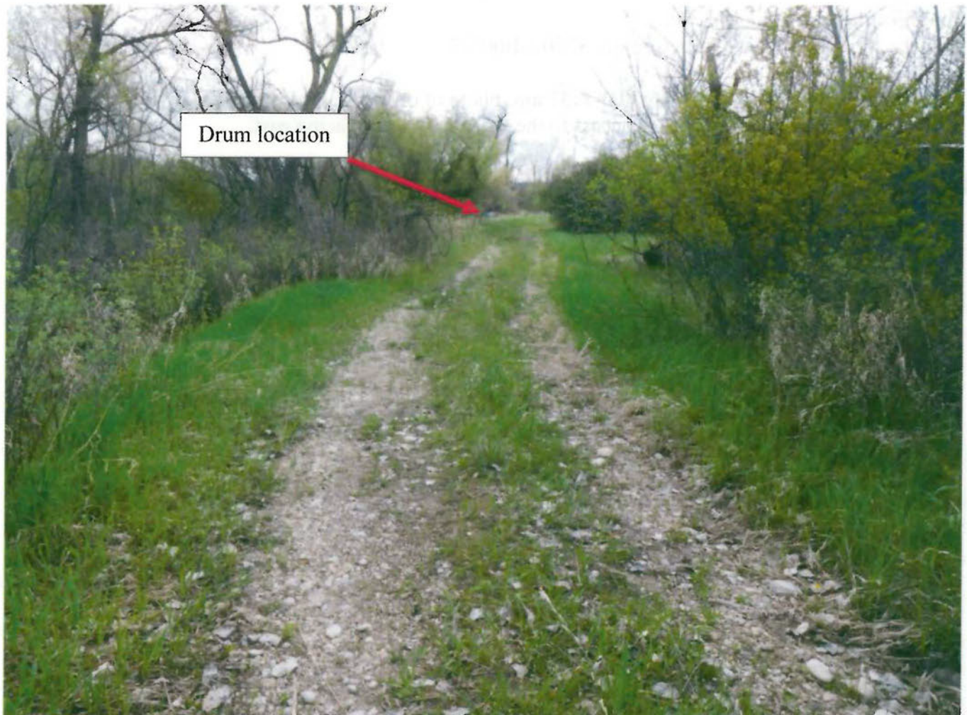
Photo 1160, DSCN1160.jpg, 5/15/2019 9:38 am, photo of driveway beyond (east of) the fallen tree with drums visible in background.

Facility Name: Lodge Grass Drum Site Facility Location: Lat/Long: 45.305631, -107.359759 Date of Inspection: May 15, 2019