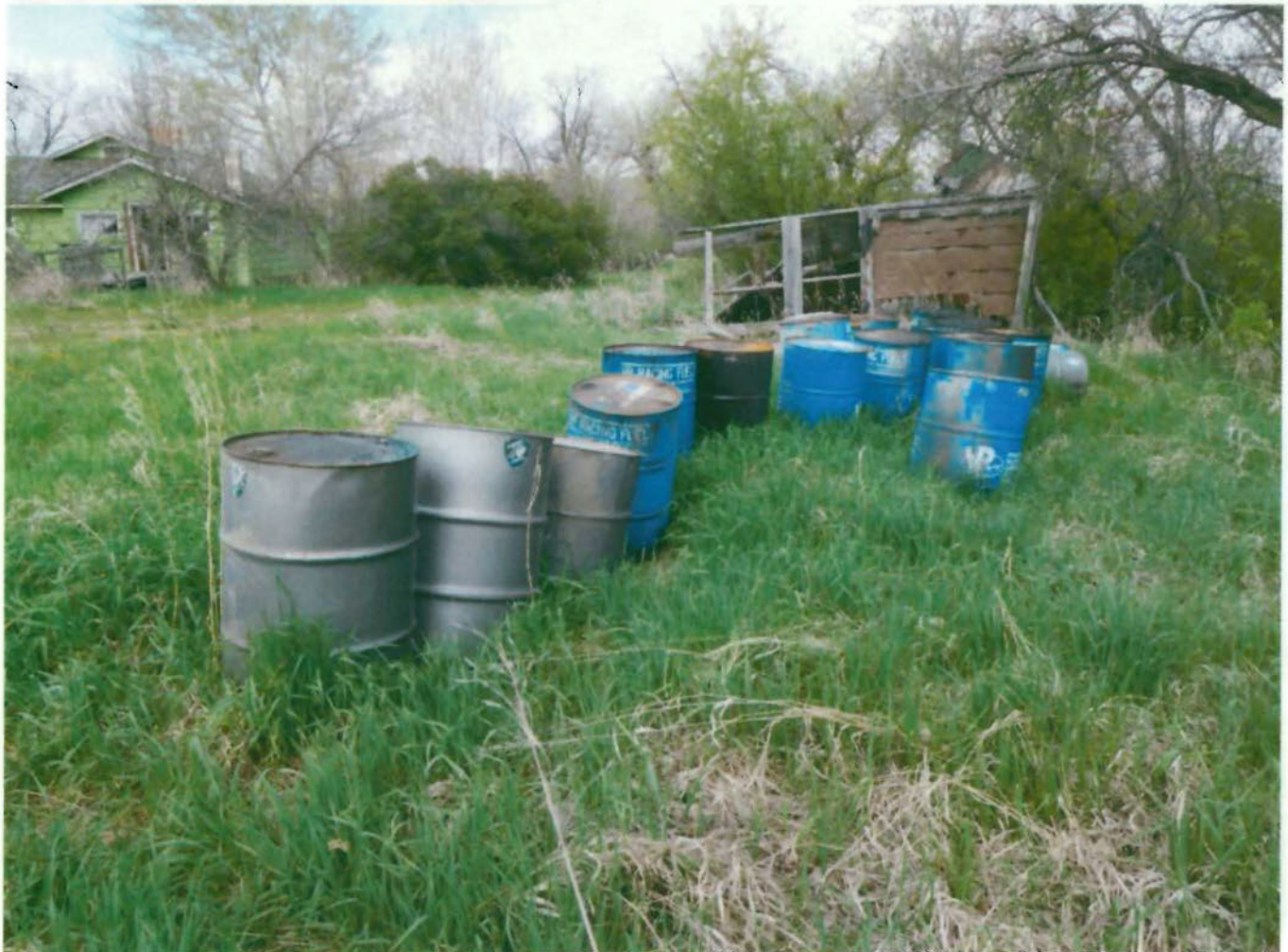
Photo 1170, DSCN1170.jpg, 5/15/2019 9:42 am, photo of all 20 drums, taken facing west. Uninhabited green residential structure and partially fallen-down additional structure included in photo background.

Facility Name: Lodge Grass Drum Site Facility Location: Lat/Long: 45.305631, -107.359759 Date of Inspection: May 15, 2019