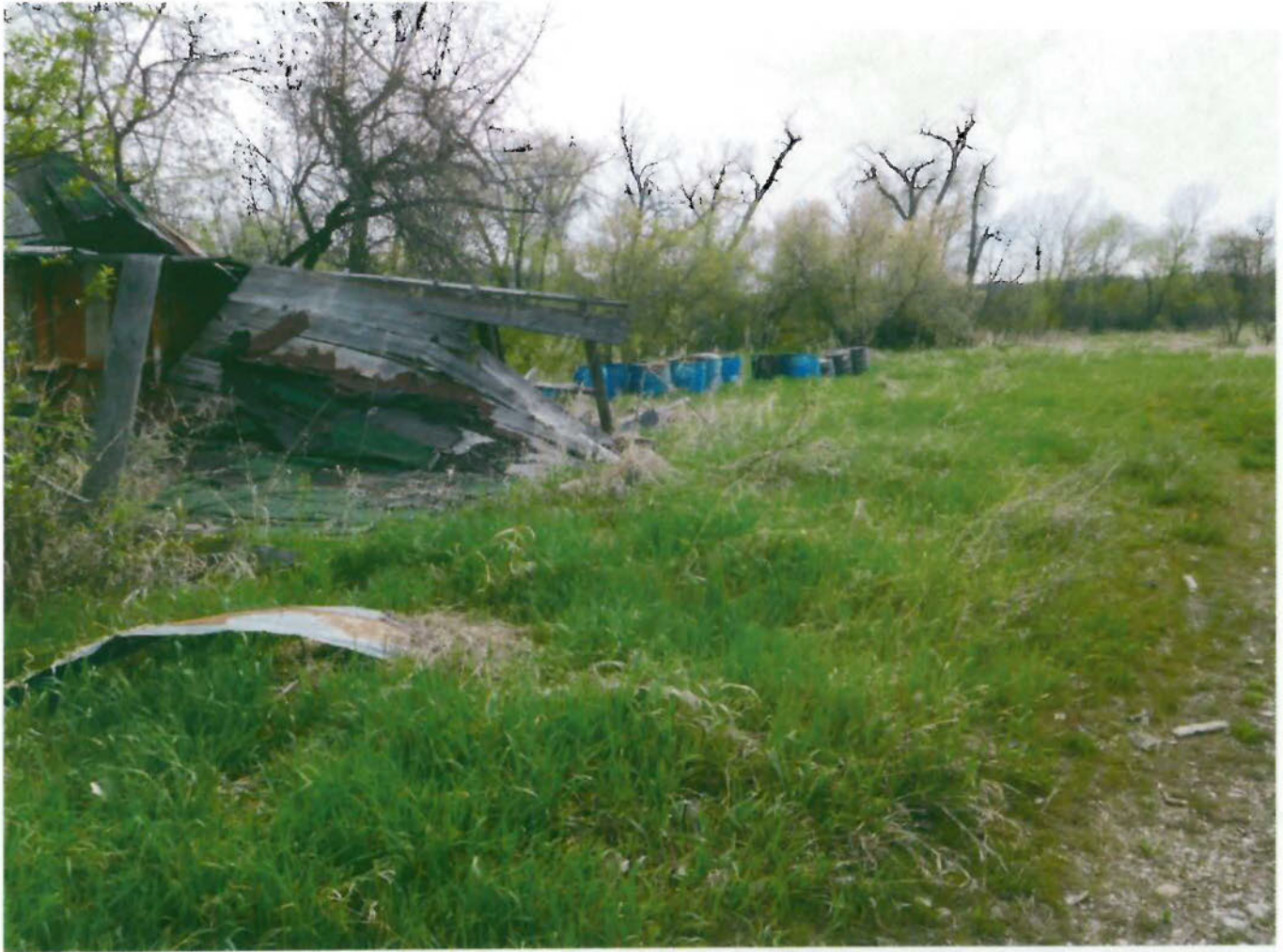
Photo 1161, DSCN1161.jpg, 5/15/2019 9:39 am, photo of drums near eastern end of driveway.

Facility Name: Lodge Grass Drum Site Facility Location: Lat/Long: 45.305631, -107.359759 Date of Inspection: May 15, 2019