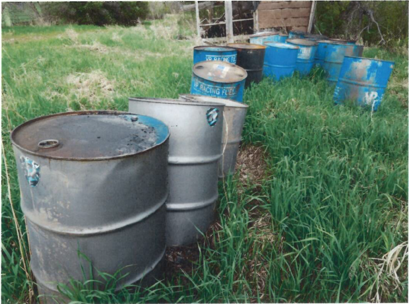
Photo 1177, DSCN1177.jpg, 5/15/2019 9:50 am, photo of all 20 drums, taken facing west.

Facility Name: Lodge Grass Drum Site Facility Location: Lat/Long: 45.305631, -107.359759 Date of Inspection: May 15, 2019