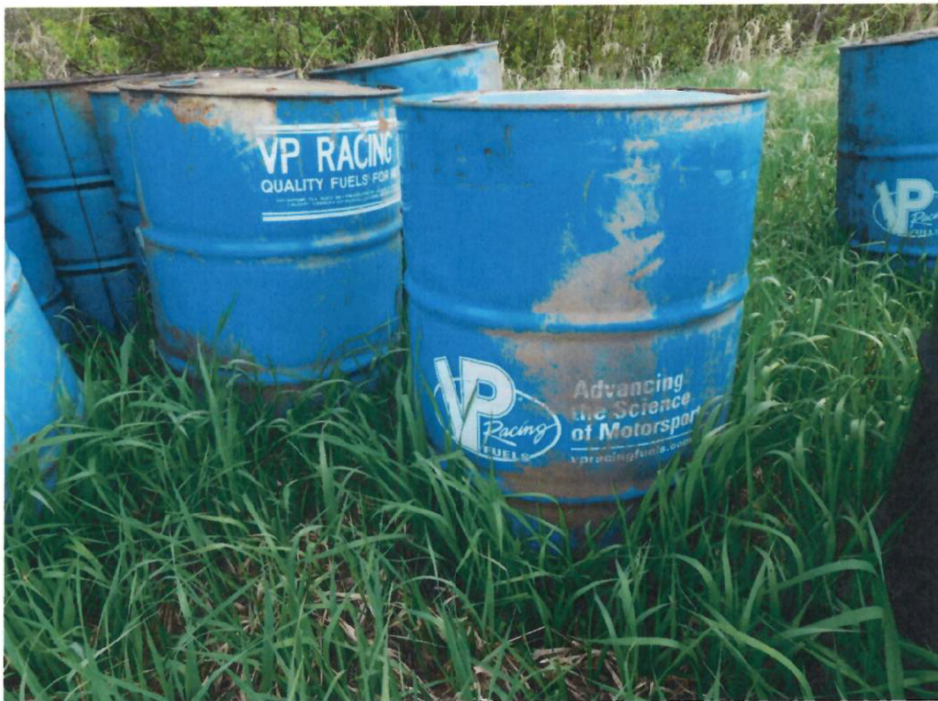
Photo 1168, DSCN1168.jpg, 5/15/2019 9:41 am, photo of drum labeling.

Facility Name: Lodge Grass Drum Site Facility Location: Lat/Long: 45.305631, -107.359759 Date of Inspection: May 15, 2019