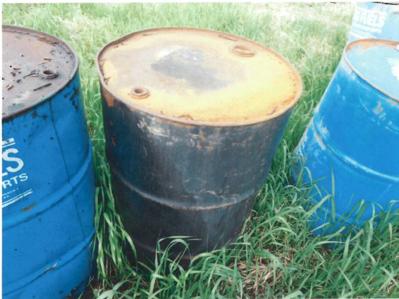
Photo 1183, DSCN1183.jpg, 5/15/2019 9:52 am, photo of drum with no labels.

Facility Name: Lodge Grass Drum Site Facility Location: Lat/Long: 45.305631, -107.359759 Date of Inspection: May 15, 2019