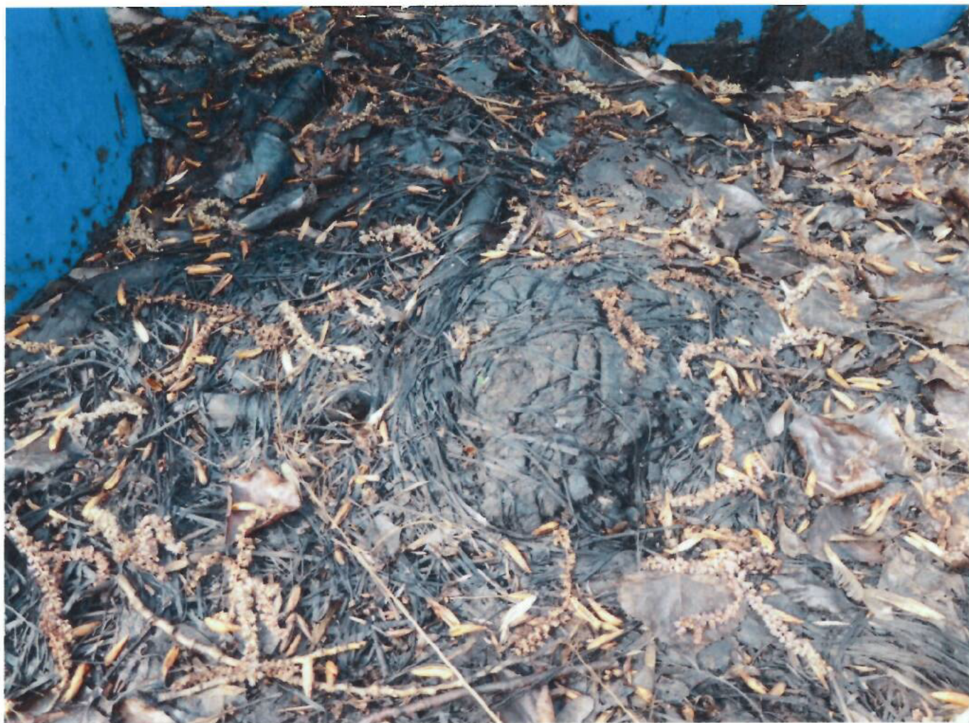
Photo 1175, DSCN1175.jpg, 5/15/2019 9:46 am, photo of spilled or leaked oily-looking waste on ground on north side of drum area.

Facility Name: Lodge Grass Drum Site Facility Location: Lat/Long: 45.305631, -107.359759 Date of Inspection: May 15, 2019