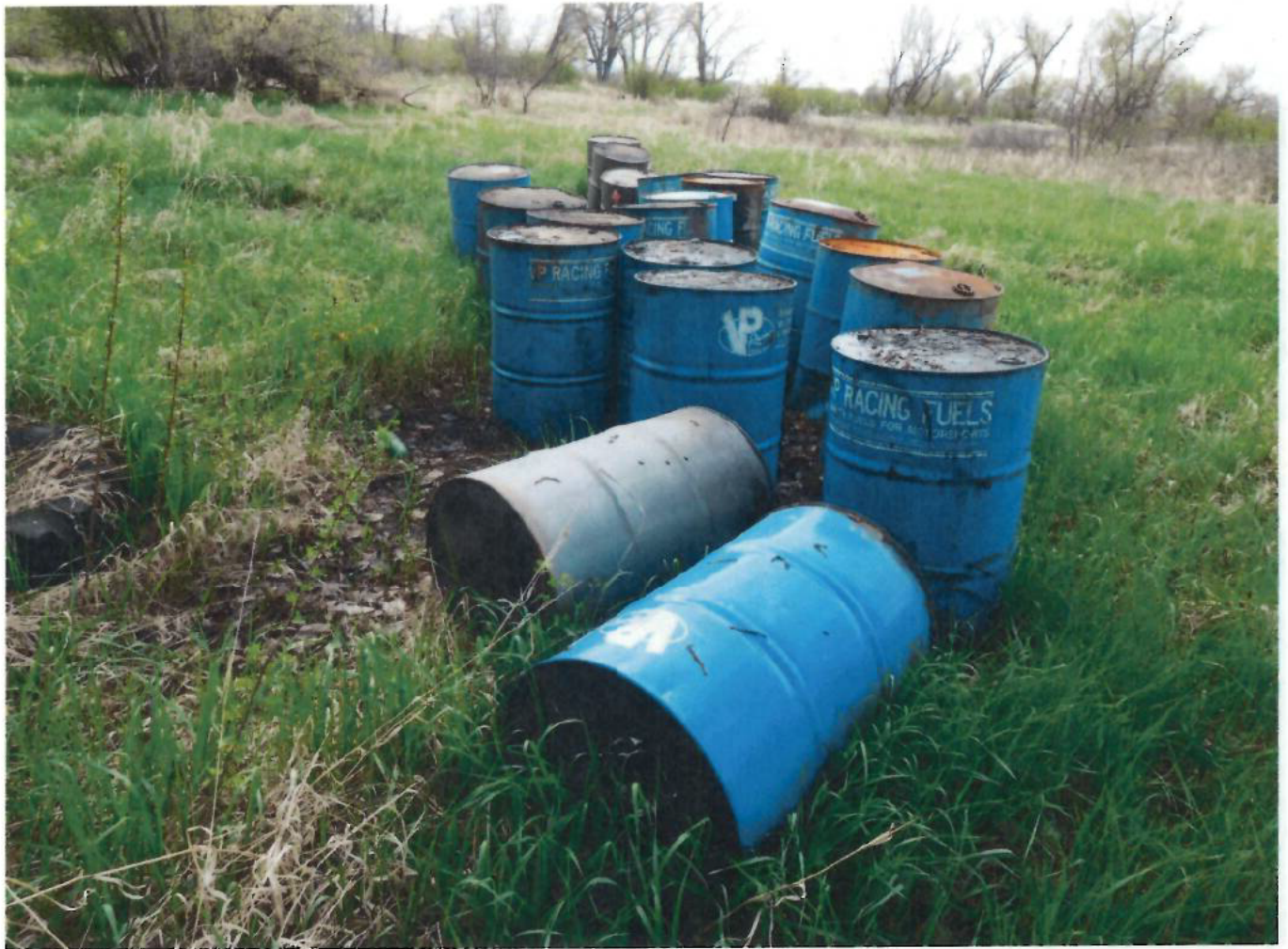
Photo 1166, DSCN1166.jpg, 5/15/2019 9:40 am, photo of all 20 drums, taken facing south.

Facility Name: Lodge Grass Drum Site Facility Location: Lat/Long: 45.305631, -107.359759 Date of Inspection: May 15, 2019