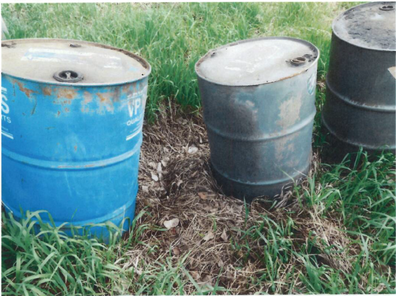
Photo 1169, DSCN1169.jpg, 5/15/2019 9:41 am, photo of stressed vegetation in between drums.