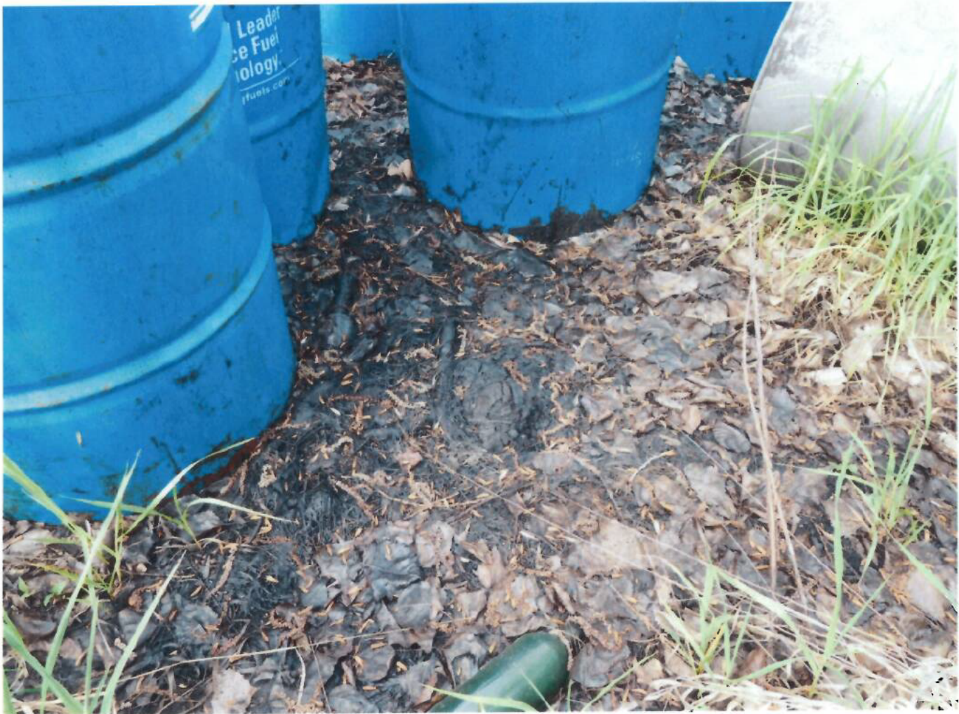
Photo 1173, DSCN1173.jpg, 5/15/2019 9:42 am, photo of spilled or leaked oily-looking waste on ground on north side of drum area