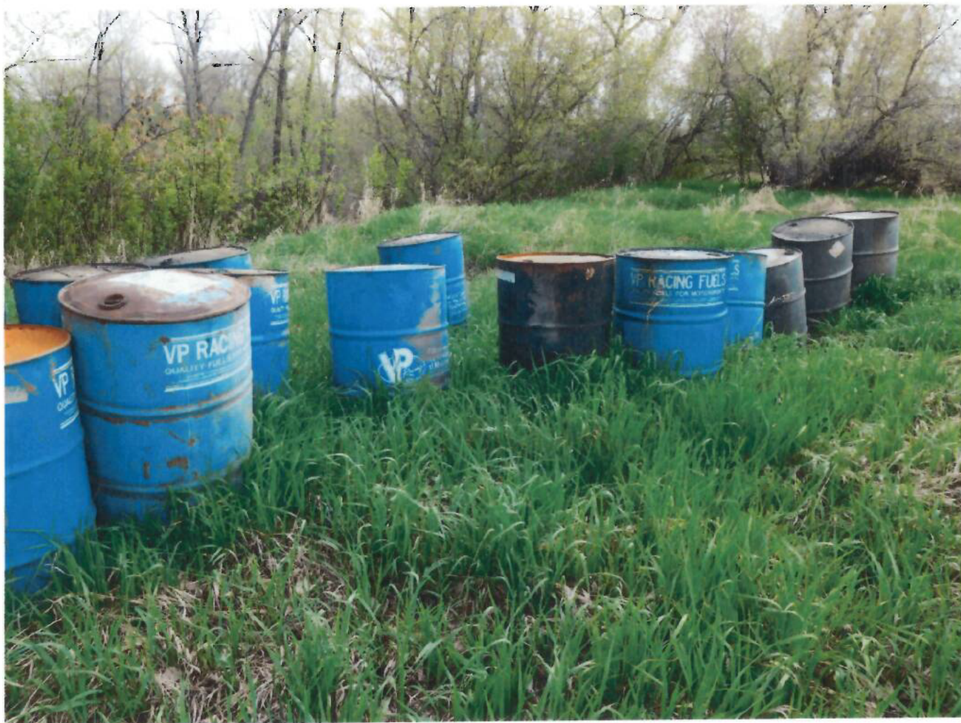
Photo 1165, DSCN1165.jpg, 5/15/2019 9:40 am, photo of easternmost section of drums.

Facility Name: Lodge Grass Drum Site Facility Location: Lat/Long: 45.305631, -107.359759 Date of Inspection: May 15, 2019