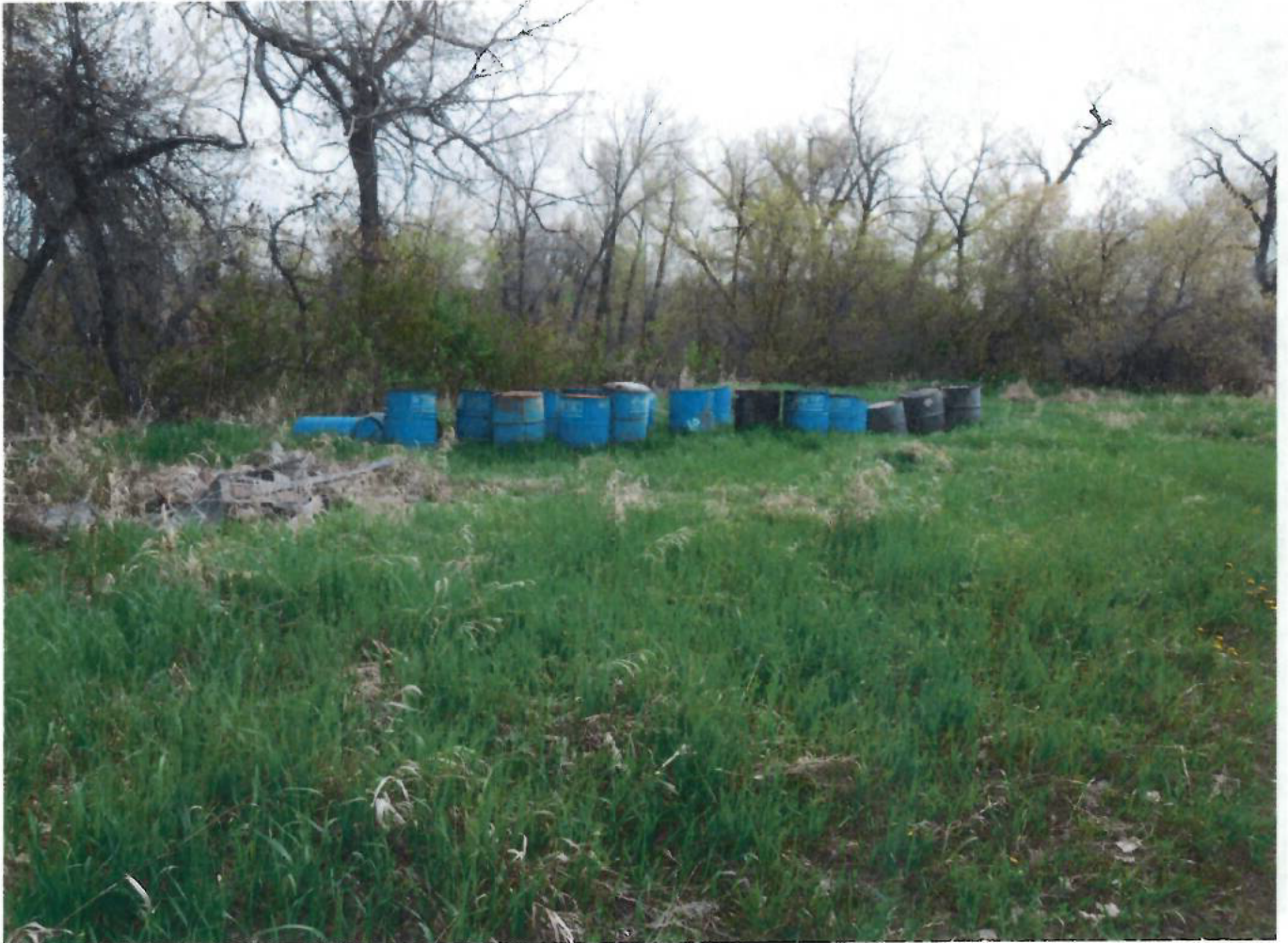
Photo 1162, DSCN1162.jpg, 5/15/2019 9:39 am, photo of drums, showing all 20 drums. Photo taken facing north/northeast.

Facility Name: Lodge Grass Drum Site Facility Location: Lat/Long: 45.305631, -107.359759 Date of Inspection: May 15, 2019