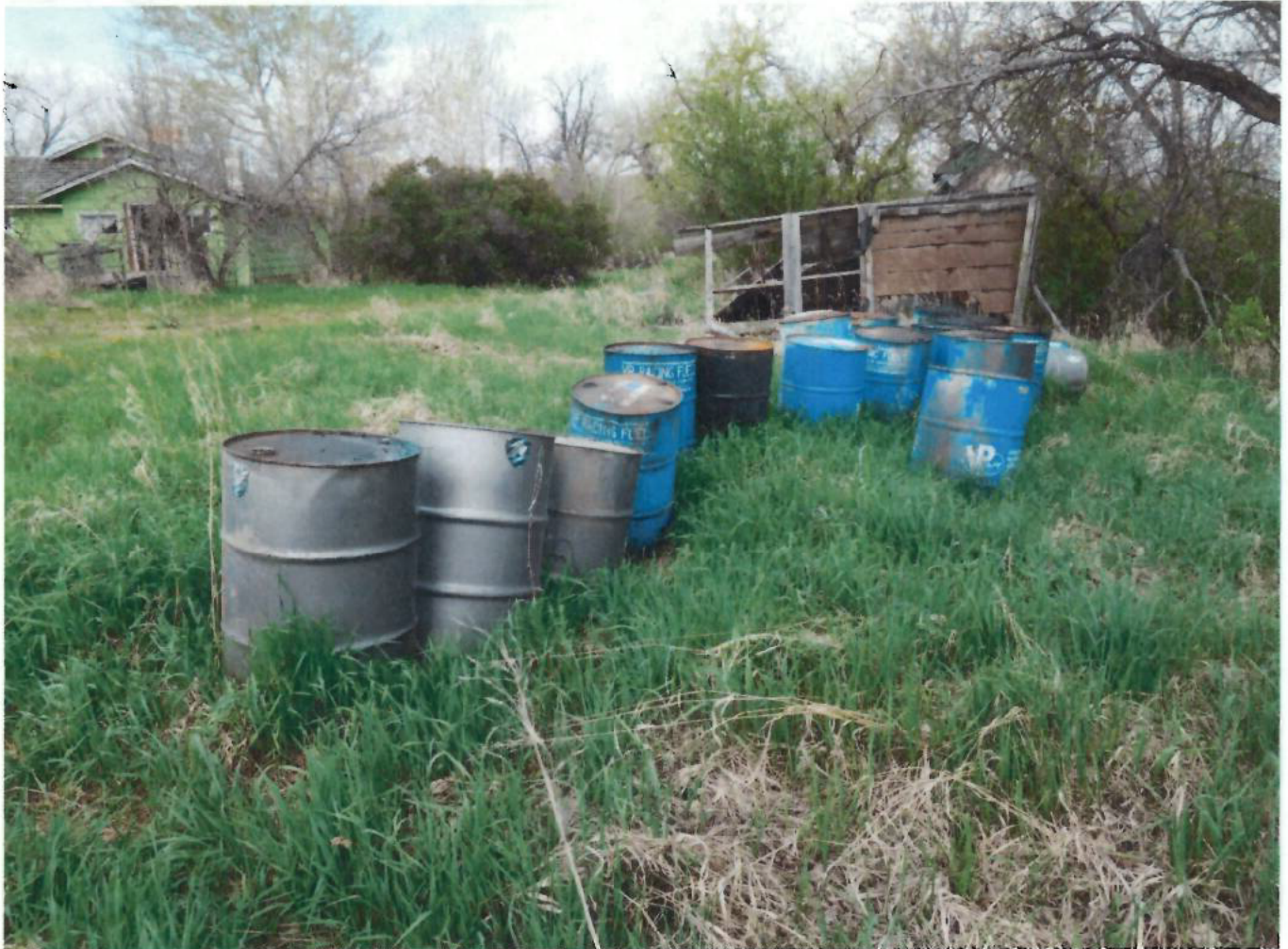
Photo 1170, DSCN1170.jpg, 5/15/2019 9:42 am, photo of all 20 drums, taken facing west. Uninhabited green residential structure and partially fallen-down additional structure included in photo background.

Facility Name: Lodge Grass Drum Site Facility Location: Lat/Long: 45.305631, -107.359759 Date of Inspection: May 15, 2019