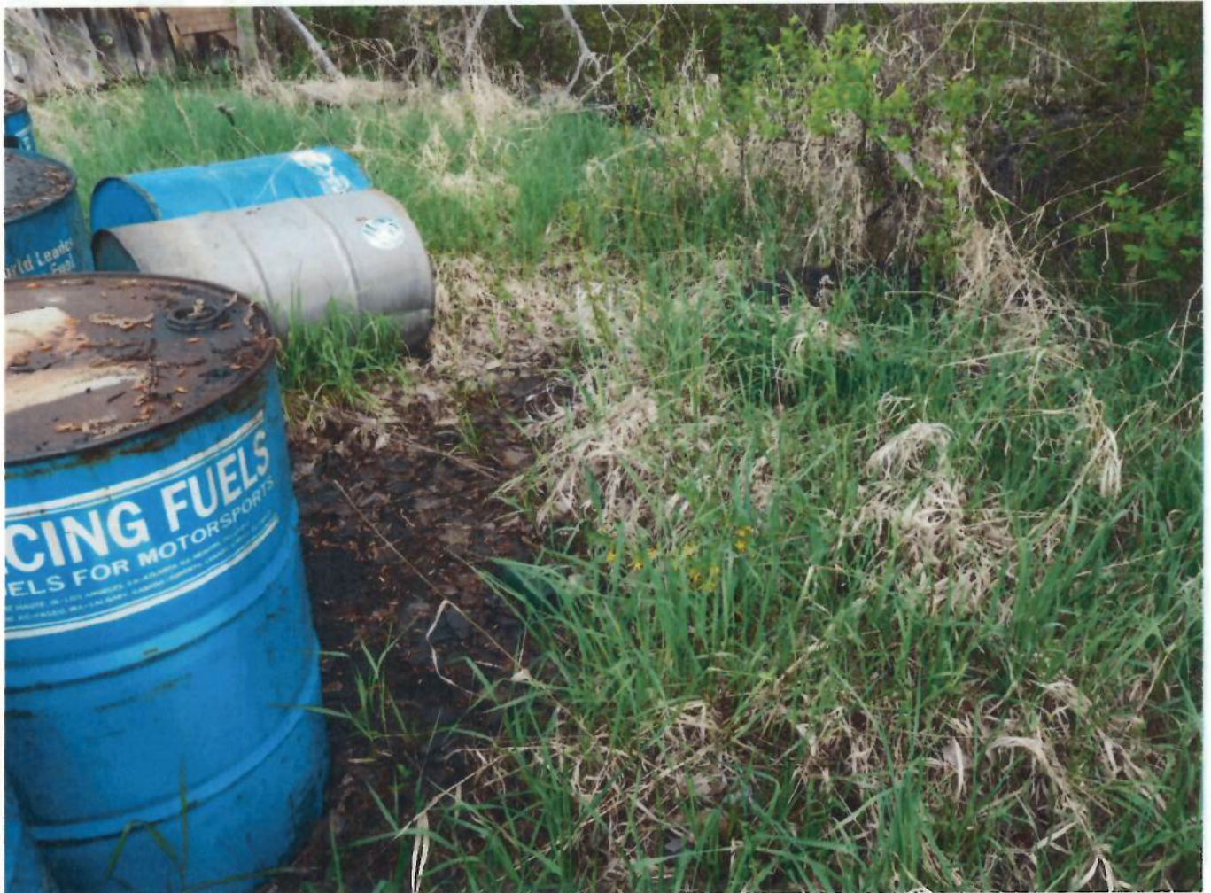
Photo 1172, DSCN1172.jpg, 5/15/2019 9:42 am, photo of spilled or leaked oily-looking waste on ground on north side of drum area.

Facility Name: Lodge Grass Drum Site Facility Location: Lat/Long: 45.305631, -107.359759 Date of Inspection: May 15, 2019