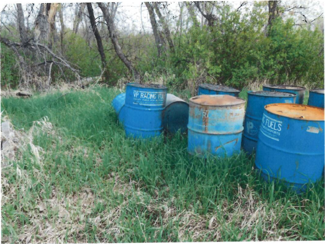
Photo 1163, DSCN1163.jpg, 5/15/2019 9:40 am, photo of westernmost section of drums. Photo includes two drums on their sides and one drum with a bulging top.

Facility Name: Lodge Grass Drum Site Facility Location: Lat/Long: 45.305631, -107.359759 Date of Inspection: May 15, 2019