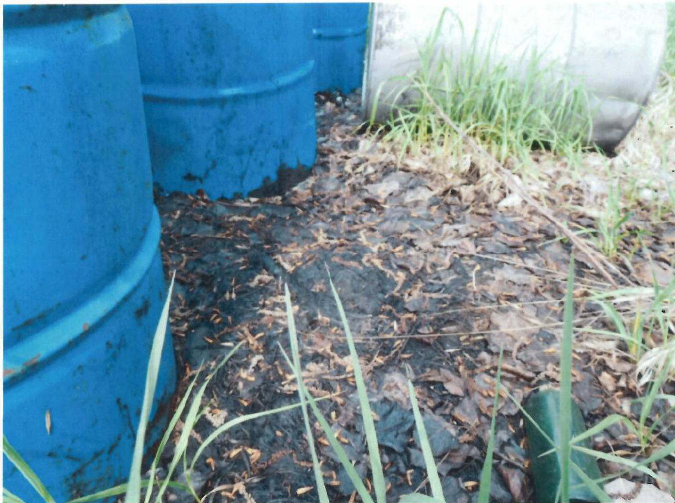
Photo 1174, DSCN1174.jpg, 5/15/2019 9:46 am, photo of spilled or leaked oily-looking waste on ground on north side of drum area.

Facility Name: Lodge Grass Drum Site Facility Location: Lat/Long: 45.305631, -107.359759 Date of Inspection: May 15, 2019