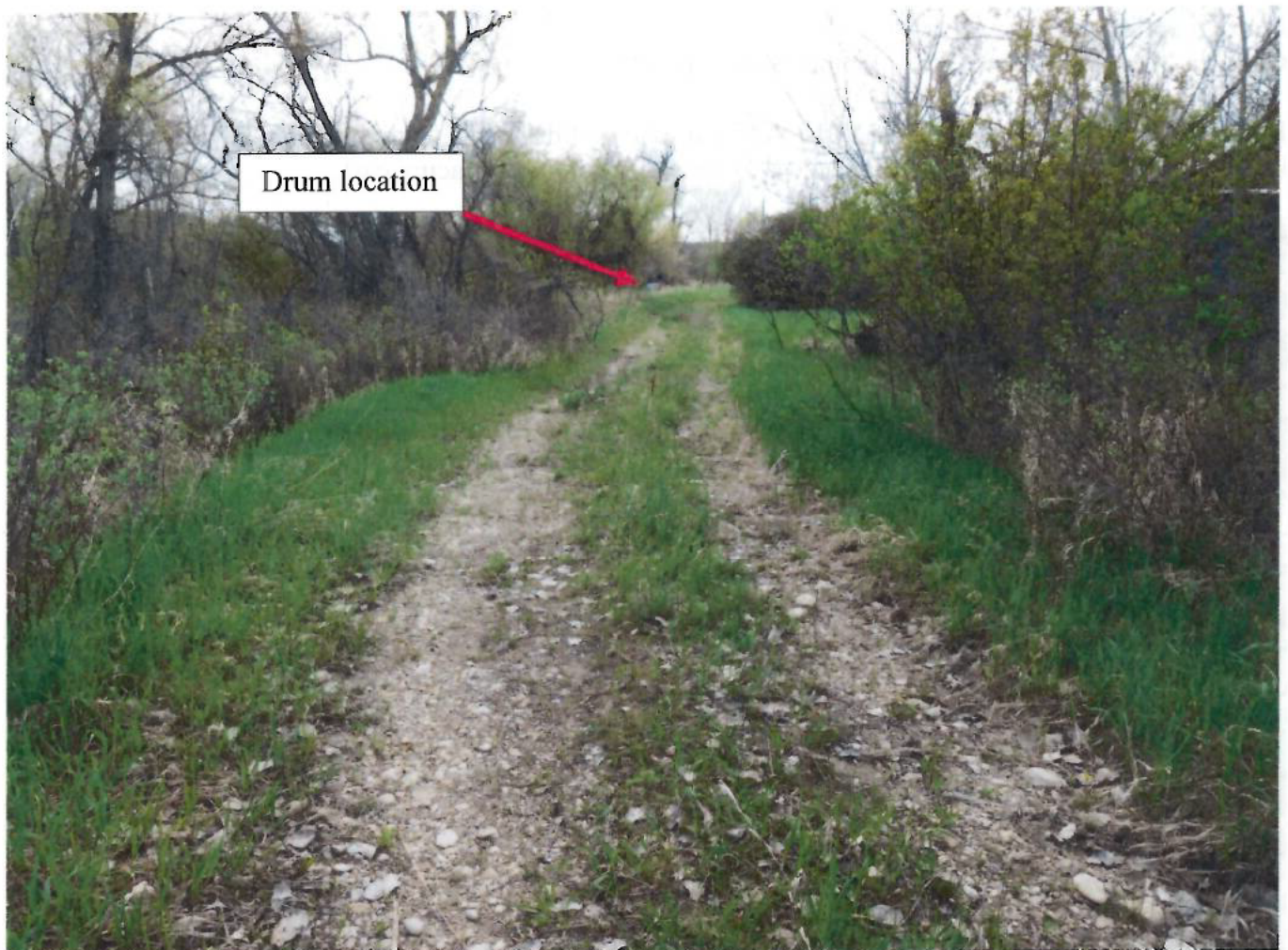
Photo 1160, DSCN1160.jpg, 5/15/2019 9:38 am, photo of driveway beyond (east of) the fallen tree with drums visible in background.

Facility Name: Lodge Grass Drum Site Facility Location: Lat/Long: 45.305631, -107.359759 Date of Inspection: May 15, 2019