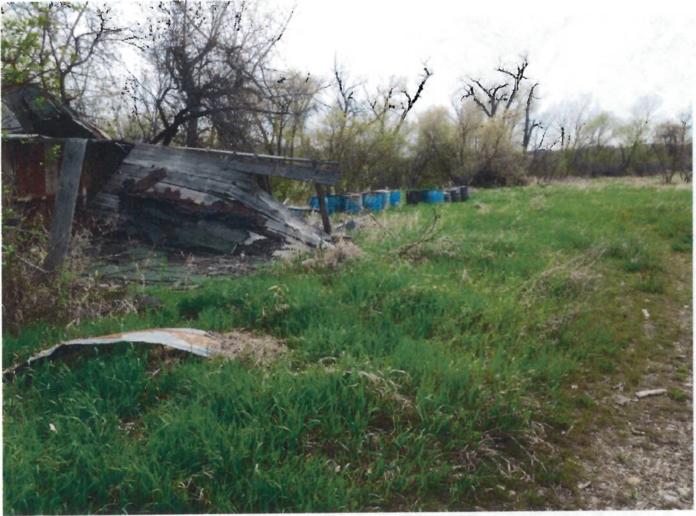
Photo 1161, DSCN1161.jpg, 5/15/2019 9:39 am, photo of drums near eastern end of driveway.

Facility Name: Lodge Grass Drum Site Facility Location: Lat/Long: 45.305631, -107.359759 Date of Inspection: May 15, 2019