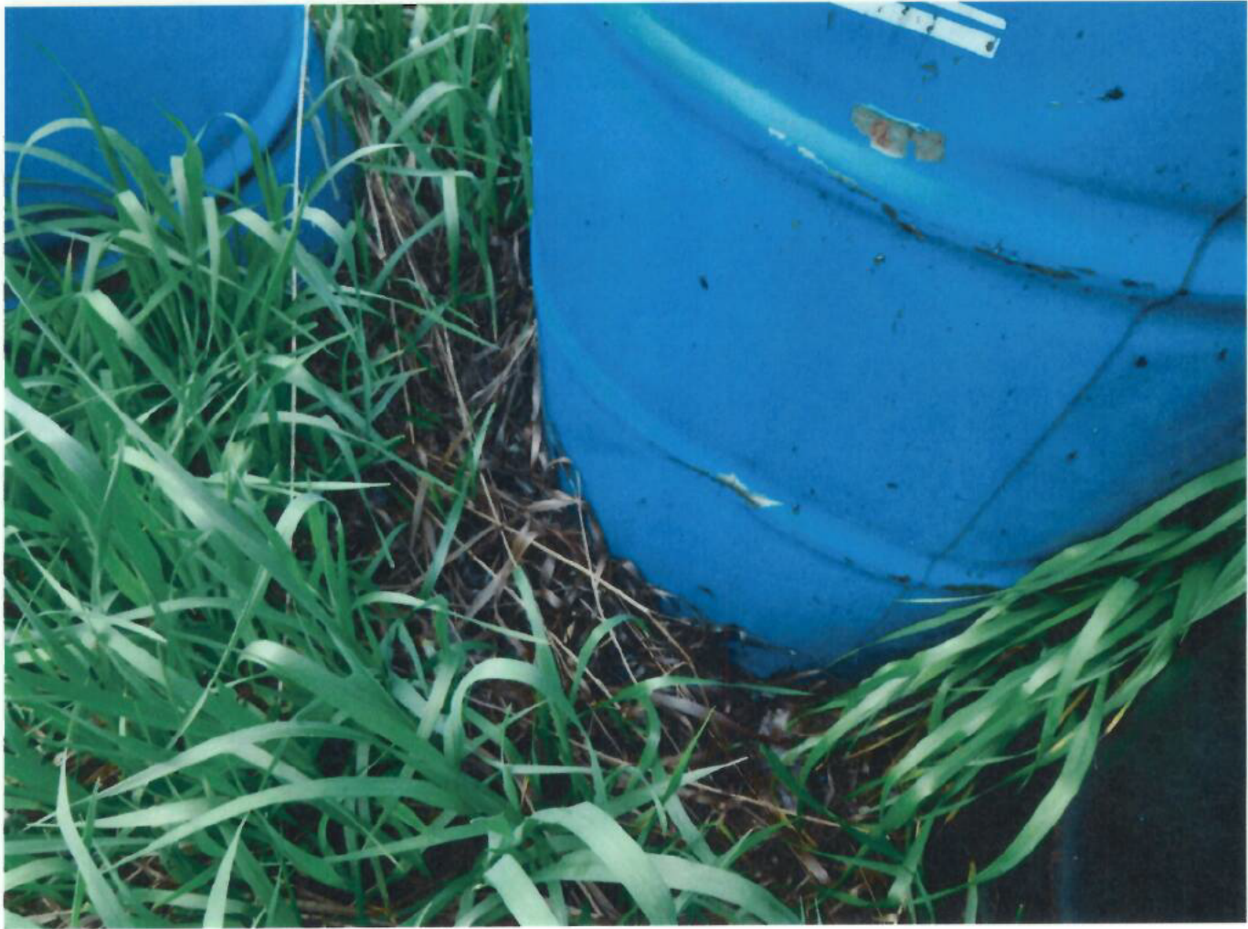
Photo 1181, DSCN1181.jpg, 5/15/2019 9:51 am, photo of stressed vegetation.

Facility Name: Lodge Grass Drum Site Facility Location: Lat/Long: 45.305631, -107.359759 Date of Inspection: May 15, 2019