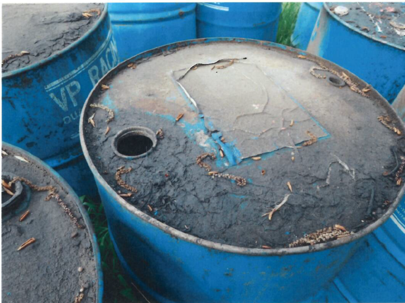
Photo 1171, DSCN1171.jpg, 5/15/2019 9:42 am, photo of an open drum.

Facility Name: Lodge Grass Drum Site Facility Location: Lat/Long: 45.305631, -107.359759 Date of Inspection: May 15, 2019