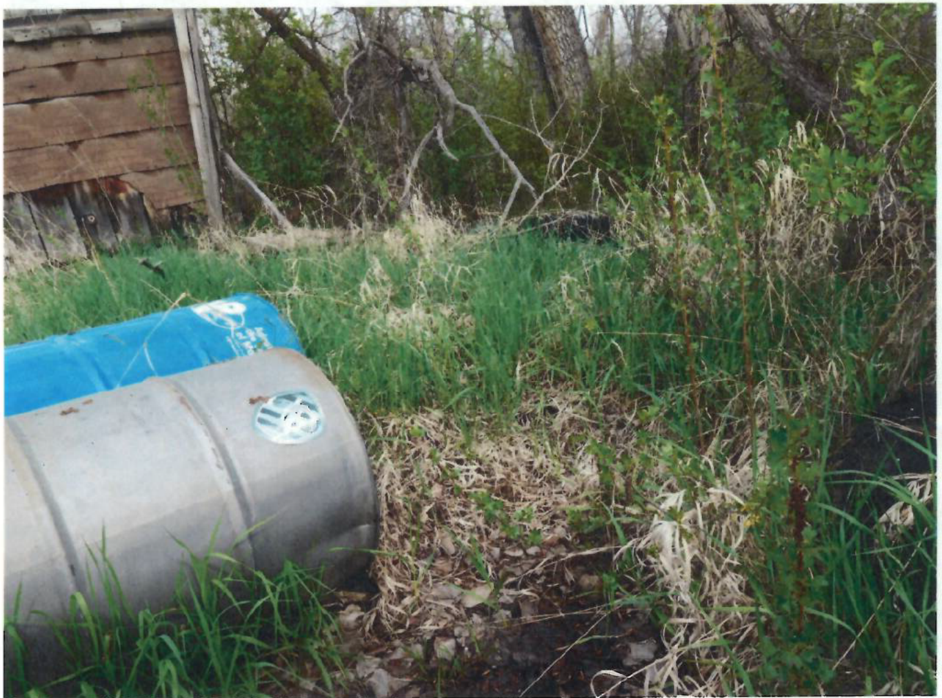
Photo 1176, DSCN1176.jpg, 5/15/2019 9:46 am, photo of spilled or leaked oily-looking waste on ground on north side of drum area, facing toward lower-elevation area located approximately 15 feet to the north of the drums.

Facility Name: Lodge Grass Drum Site Facility Location: Lat/Long: 45.305631, -107.359759 Date of Inspection: May 15, 2019