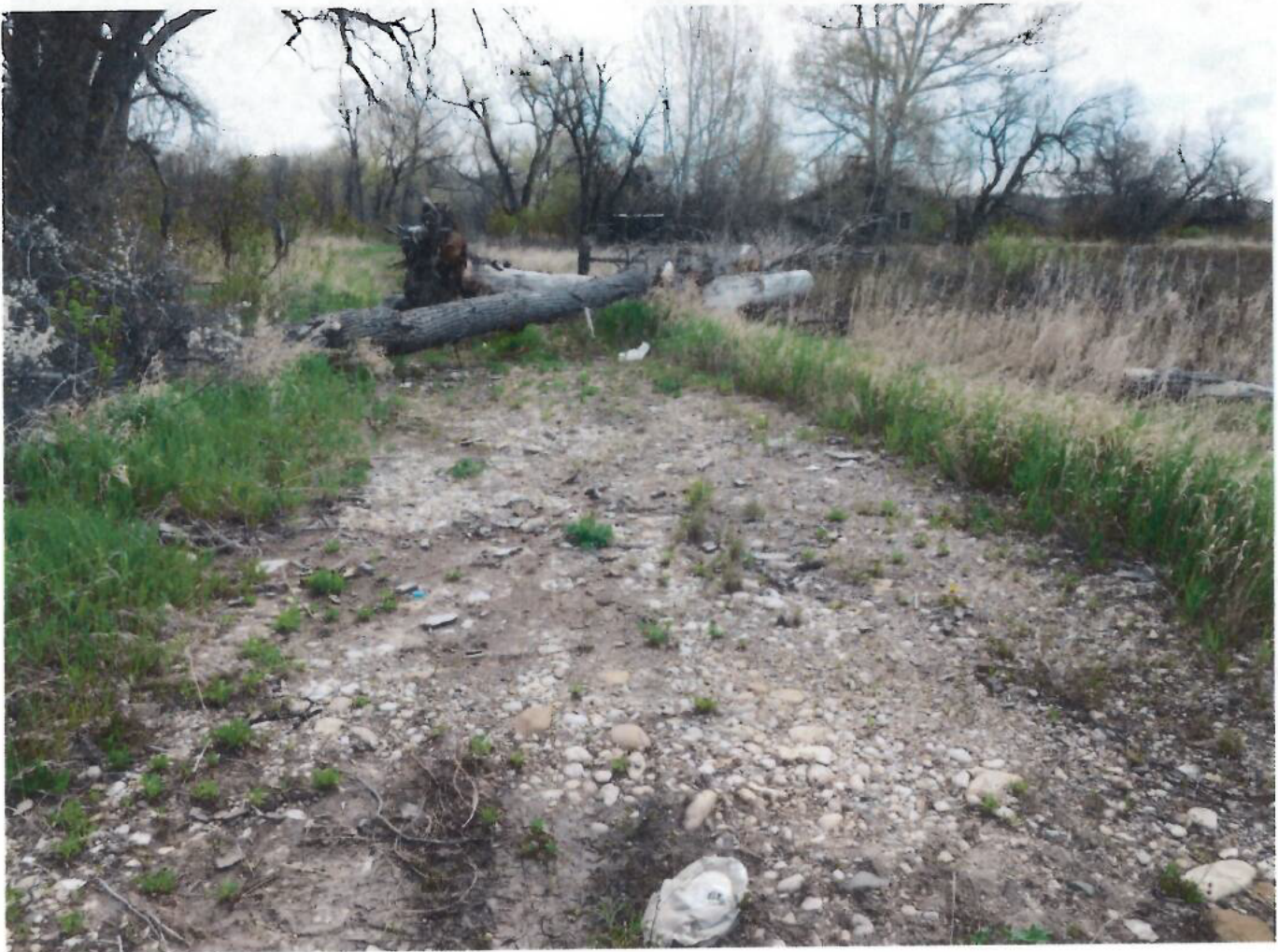
Photo 1159, DSCN1159.jpg, 5/15/2019 9:37 am, photo of driveway leading to area where drums are located. A fallen tree blocks vehicle access to the site. Photo taken facing east.

Photographer: Annette Maxwell Camera Model and ID: Nikon Coolpix S7000, B00227