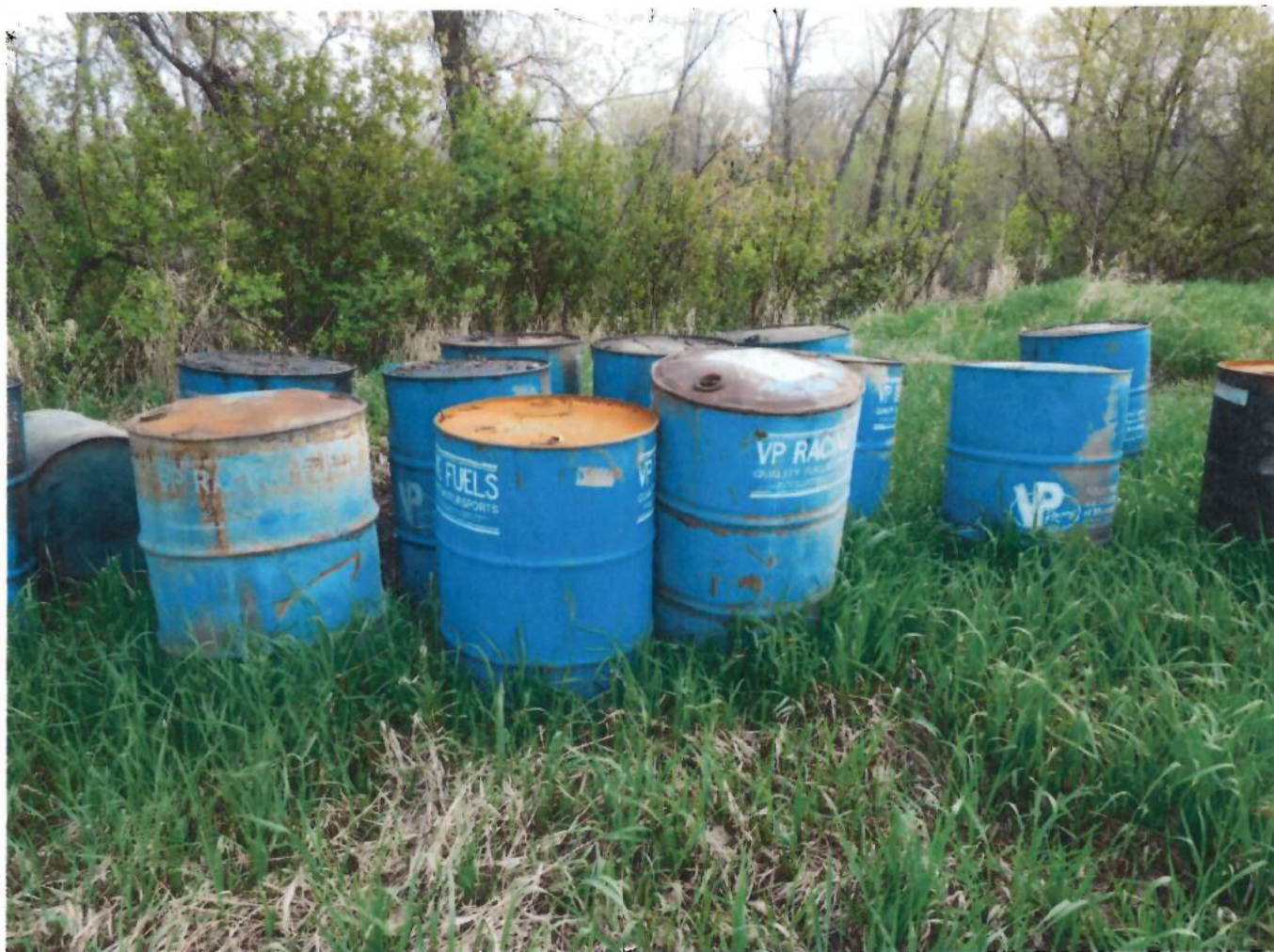
Photo 1164, DSCN1164.jpg, 5/15/2019 9:40 am, photo central section of drums, including two drums with bulging tops (one of which was also shown in photo 1163).

Facility Name: Lodge Grass Drum Site Facility Location: Lat/Long: 45.305631, -107.359759 Date of Inspection: May 15, 2019