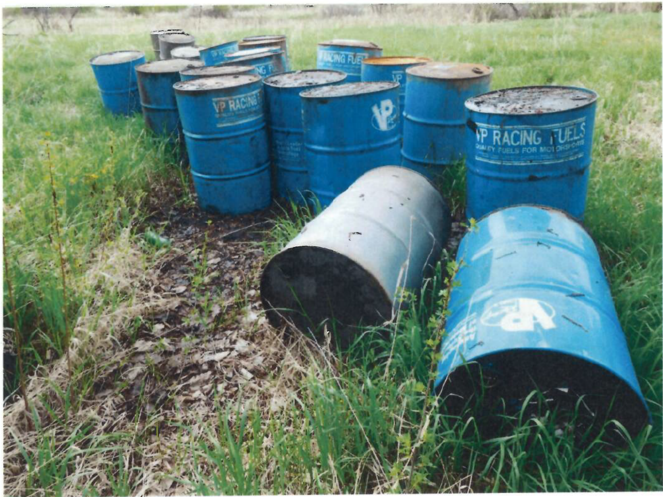
Photo 1167, DSCN1167.jpg, 5/15/2019 9:41 am, photo of all 20 drums, taken facing southeast.