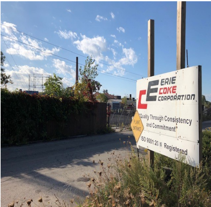
Entrance sign at the former Erie Coke Corporation plant.

In December 2019, Erie Coke ceased operations and closed the facility. PADEP directed Erie Coke to address all regulatory issues associated with closure, including removal of all waste and wastewaters from the site. However, only one million dollars was set aside to perform these tasks, and PADEP requested assistance from EPA in May 2020 to conduct a removal site evaluation. The evaluation helped determine if the site met the threshold criteria for an EPA removal action.