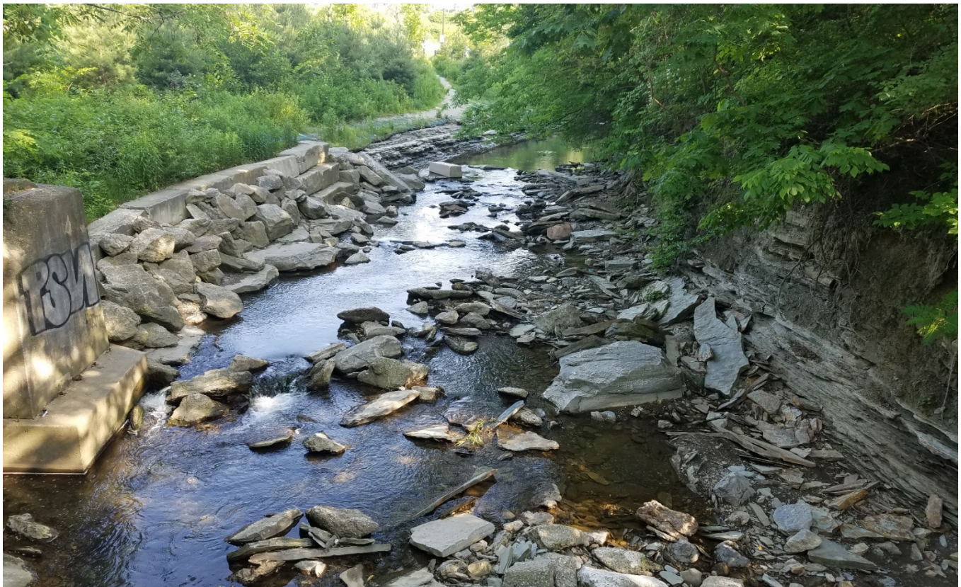
Cascade Creek's restoration reduced erosion and provided wildlife habitat near the site.

Most interviewees expressed interest in regular updates on the site's status and cleanup. Suggestions for frequency of communication included weekly or monthly updates and quarterly meetings. Although many people had not received anything directly from EPA before, they were able to access the information they needed from webpages, news outlets and other sources. Several interviewees said they were already in contact with EPA staff.