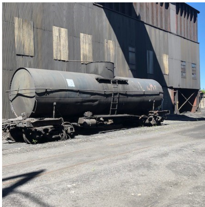
An abandoned oil containing railcar at the site.