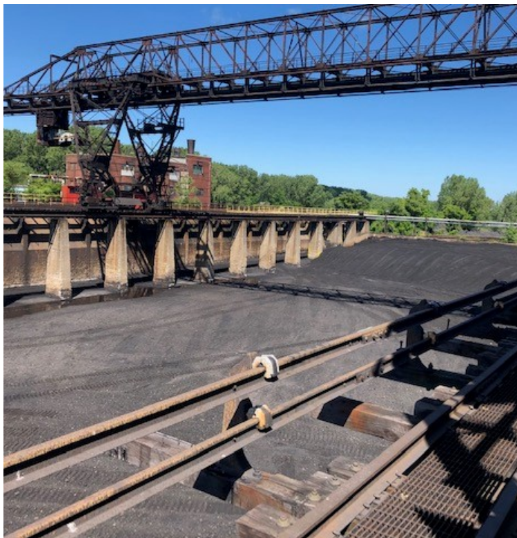
Former coal storage area (looking Northwest).

554 East 10th Street Erie, PA 16503 (814) 455-0212 mcrerie.org