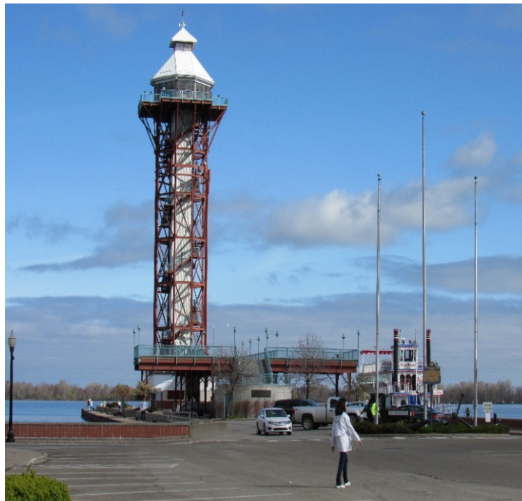
Bicentennial Tower observation deck features panoramic views of downtown Erie, Presque Isle State Park, and Lake Erie.

Erie is a member of Welcoming America, a networking organization that helps Erie create a stronger community and gain economic advantages for New Americans. Since 2013, the Erie has welcomed 2,580 new U.S. citizens sworn in from 95 countries of origin. During the Schember administration, 758 new citizens have been sworn in from 75 countries of origin. Erie recently established a New American Council to help represent and advocate for new American citizens in the area. Additionally, Erie is in the process of becoming a Certified Welcoming City – the highest designation reserved for cities and counties that meet rigorous requirements set by Welcoming America– defining what it means to be a welcoming community. Erie hopes to connect and include people of all backgrounds and harness the vibrancy that comes from diversity and create a global workforce.