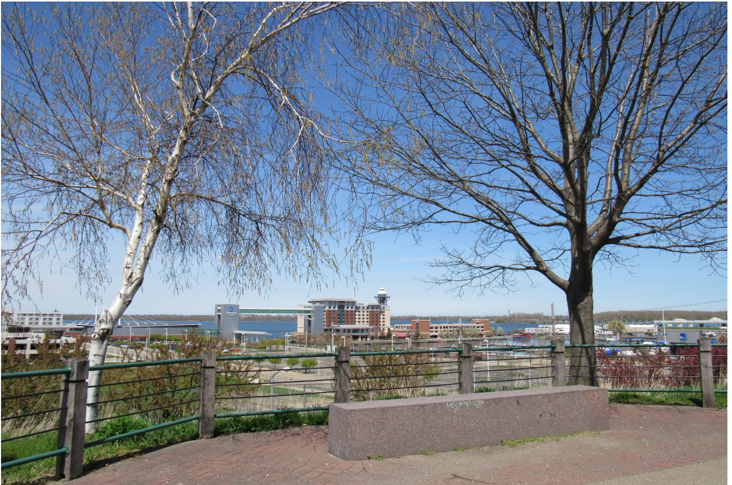
A promontory overlooking Erie's waterfront.