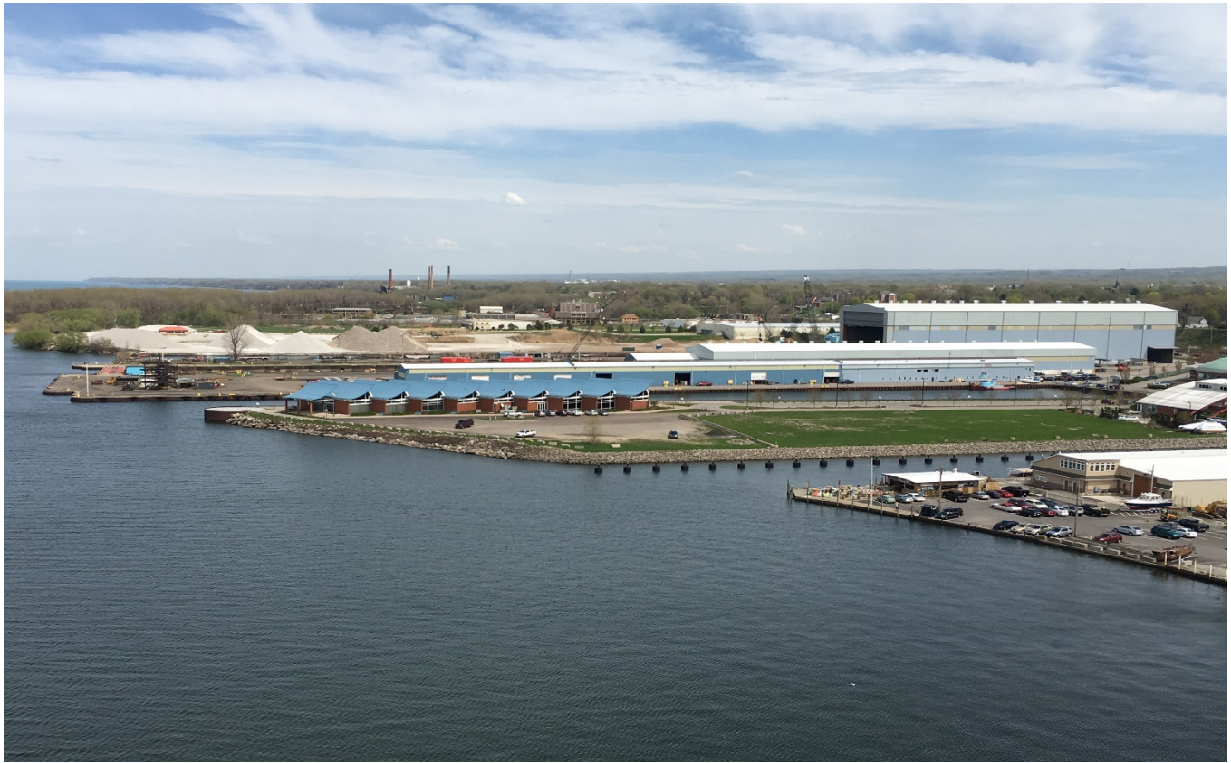
Dobbins Landing is a tourist area in Erie located near the site.