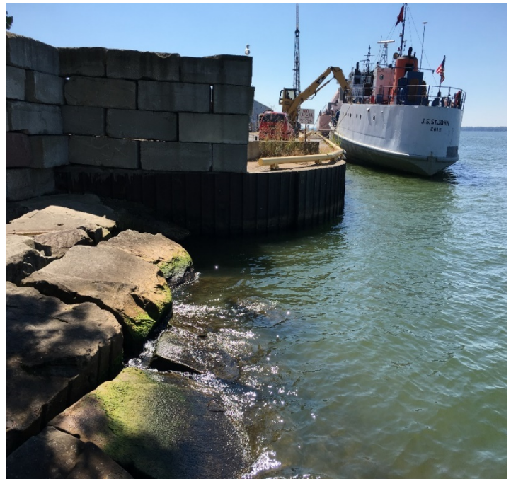
Erie-Western Pennsylvania Port Authority operations near the site.

Interviewees suggested the Port Authority, the Multicultural Community Resource Center, and area community centers, churches and libraries as good places to hold meetings.