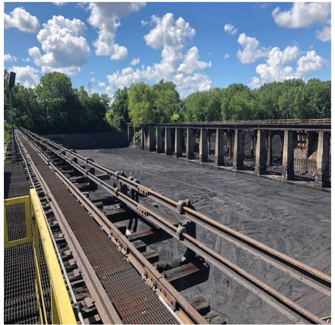
Former coal storage area (looking Southwest).

EPA has established information repositories where the community can review site documents. Please see page 21 for locations.