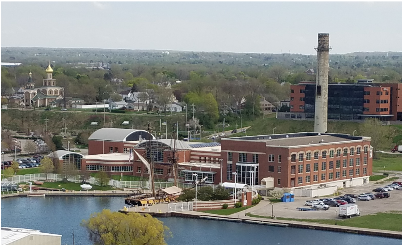
The Erie Maritime Museum opened in 1998 and provides information on Erie's maritime heritage.

For more information on available community resources, please visit the EPA Superfund Community Involvement Website: epa.gov/superfund/superfund-community-involvement .