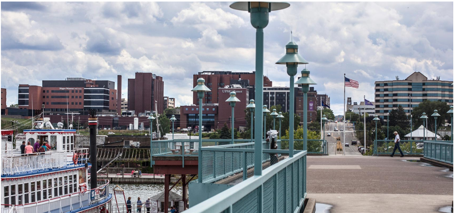
View from the upper-level viewing platform at the Bicentennial Tower located near the site.

EPA's Role in Emergency Response: epa.gov/emergency-response/epas-role-emergency-response .