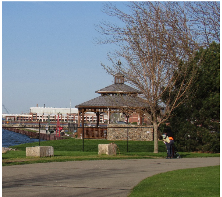
Liberty Park is located near the site.