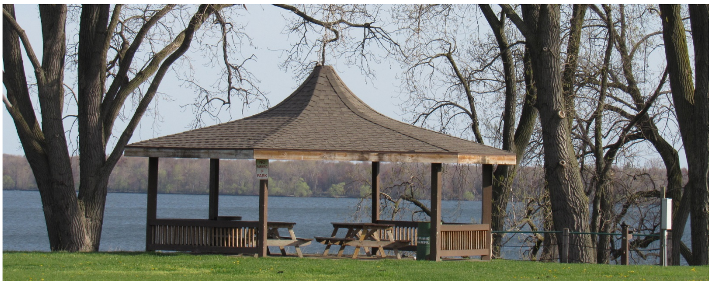
A view of Presque Isle Bay near the site.

EPA shared a fact sheet with the community to provide background information and details on upcoming work at the site in September 2020. It is available online at https://response.epa.gov/sites/14827/files/Erie%20Coke%20Factsheet_Sept%202020.pdf .