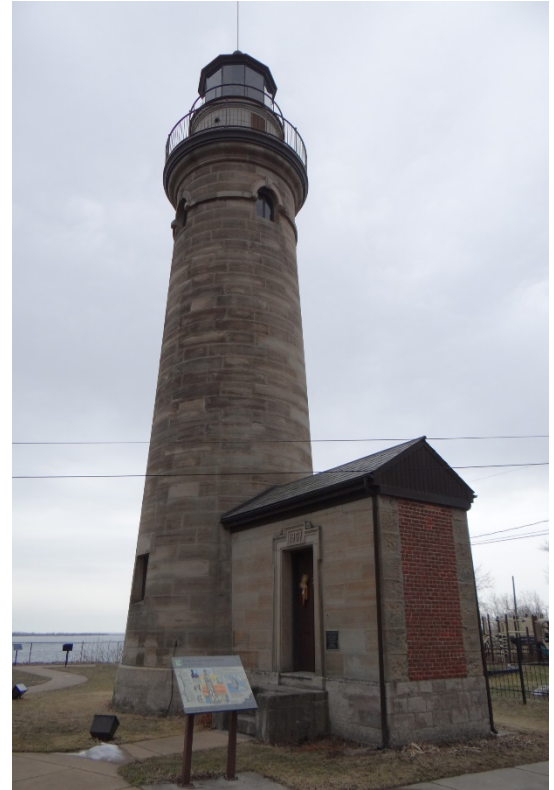
The Erie Land Lighthouse was built in 1967.

Throughout the cleanup process, EPA is committed to involving the public and keeping the community informed about cleanup activities and how these activities may affect them. This CIP has been developed to facilitate two-way dialogue between EPA and the community affected by the site and to identify tools that encourage participation throughout the investigations and cleanup. The foundation of this plan has been developed based on input from local government representatives, residents, community organizations, and other stakeholders.