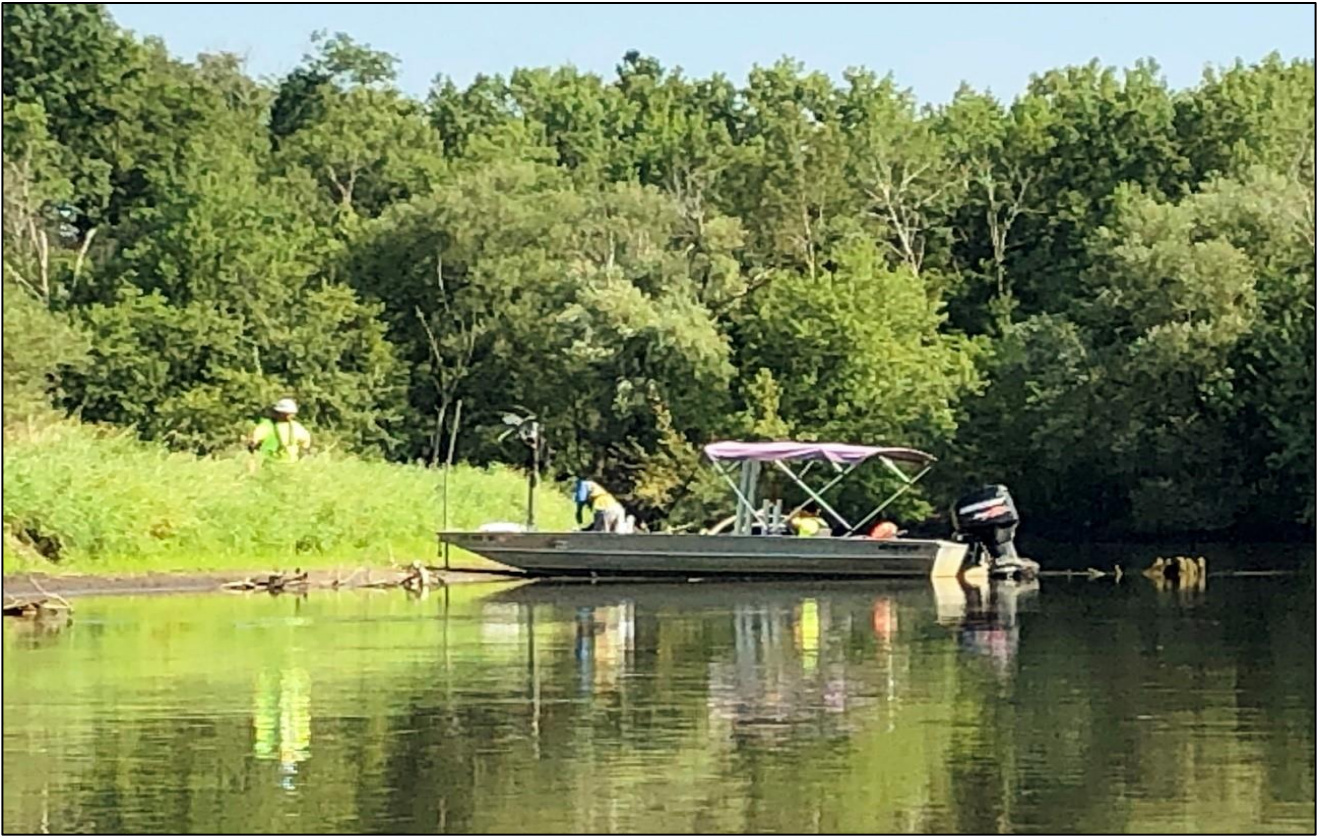
Field crews conducting sampling of riverbank soils.