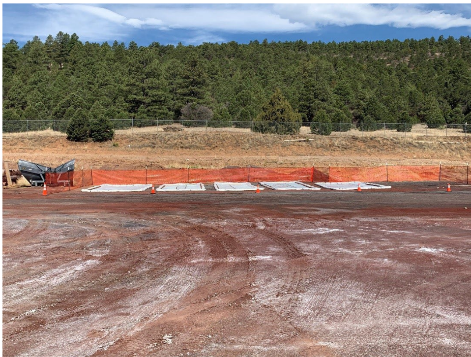
Photo 2 - Staging Area - Waste Area