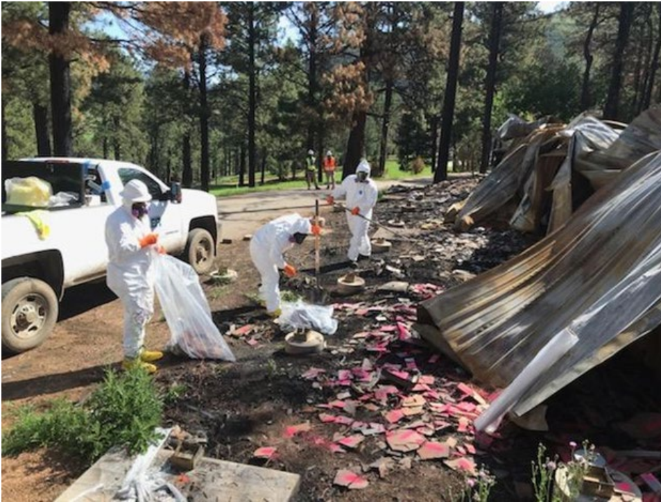
1- Task Force collecting HHW and bulk asbestos at a property.