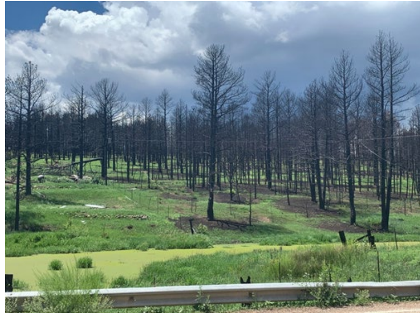
2- Impacted structure and area.