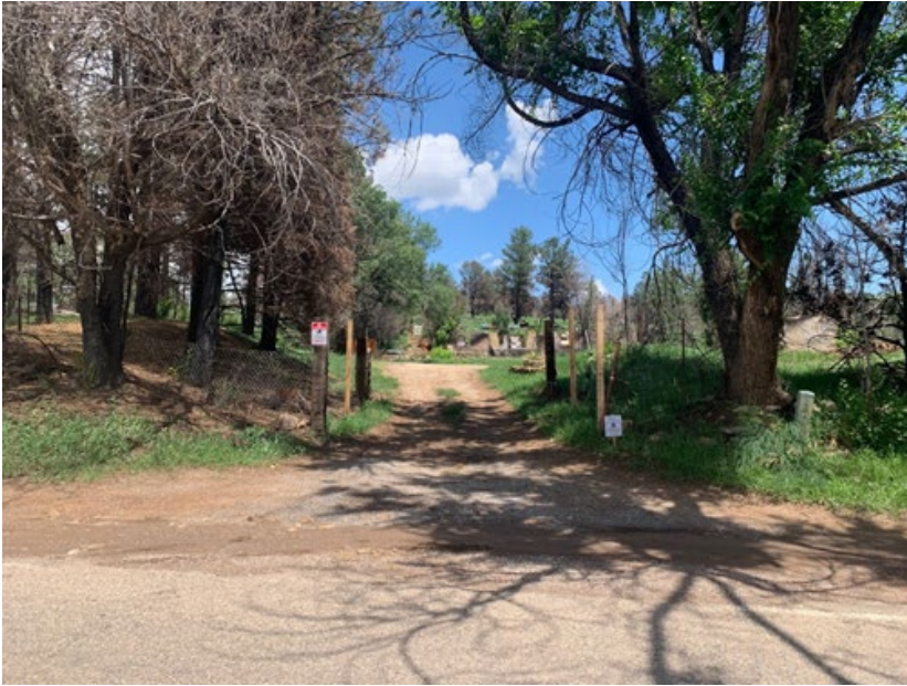
1- Impacted structure – Phase 1 Complete (signage posted).