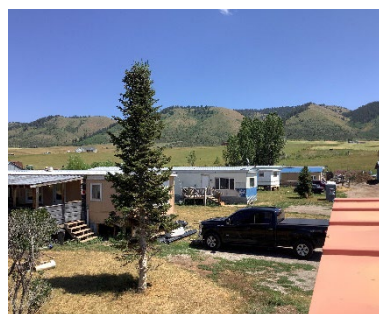
First four effected trailers