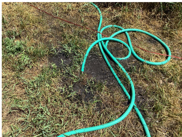
Stained vegetation surrounding garden hose