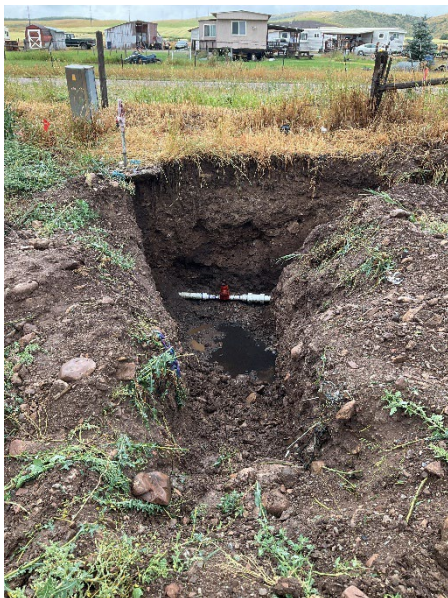
Isolation valve installed at lot 7