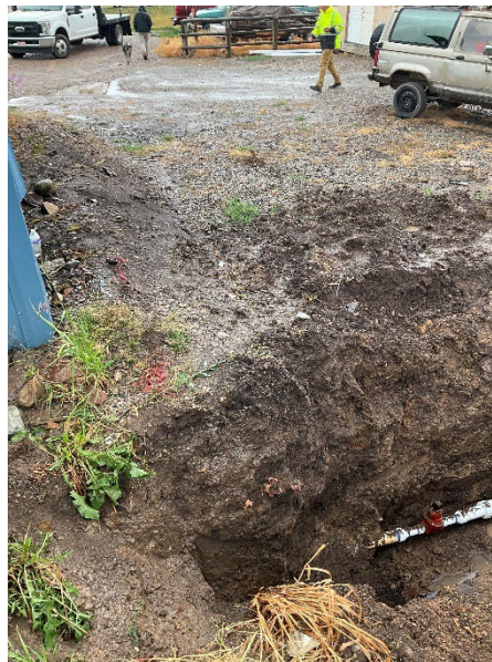
Isolation valve installed at pump house