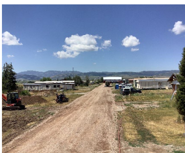
Star Valley Court facing west