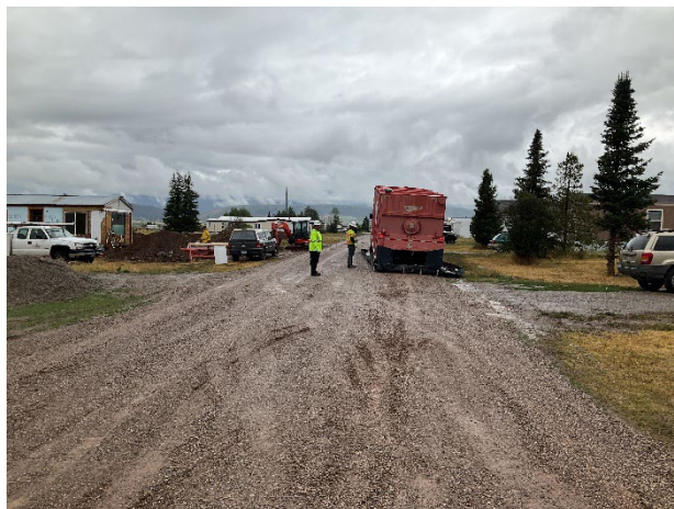
Frac tank staging area near lot 7.