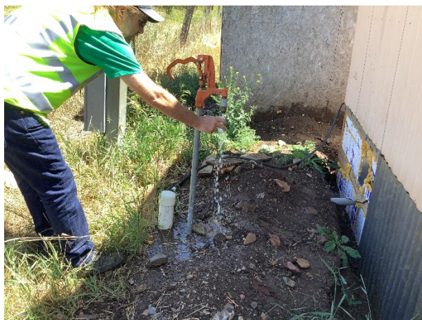
Using glass jar to check for contamination