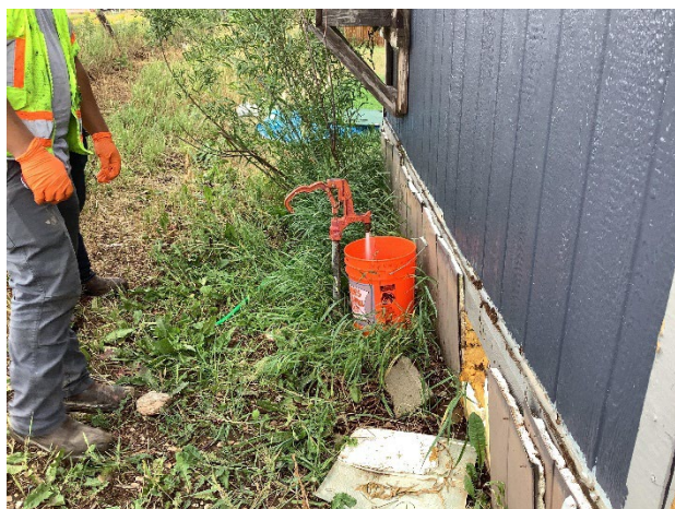
Flushing water lines