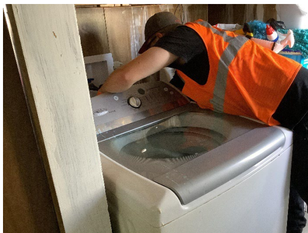
Flushing water lines