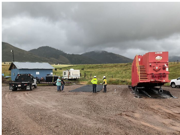
Frac tank staging area near well house.

Saturday, August 6 th , 2022 – Sunday, August 7 th , 2022