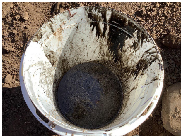
Collected oily substance of concern