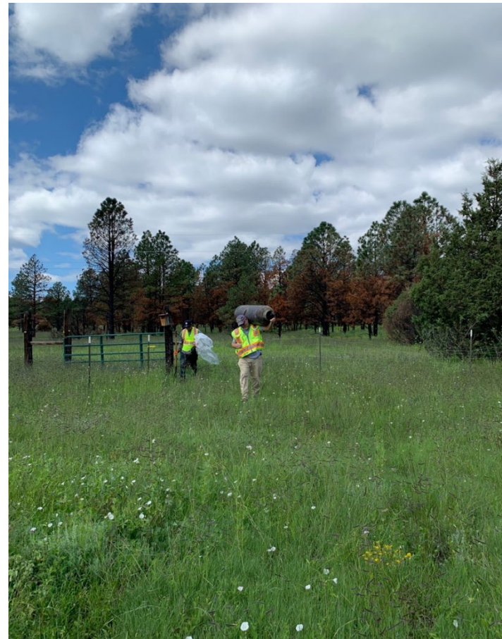
Picture 2: EPA OSC Collecting HHW from Impacted Property – August 22, 2022