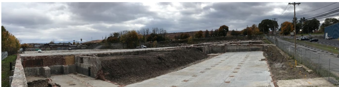
After (October 2022): View of site conditions, from the northwest corner of the site. Turner Street is visible to the right. Remaining concrete slabs are shown in the foreground. Bleecker Street is visible in the background.