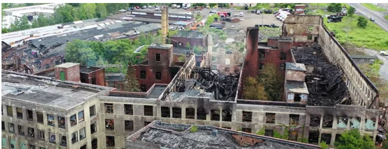
Before (August 2020): View of site structures after a fire in August 2020.

The New York State Department of Environmental Conservation (NYSDEC) referred the Charlestown Mall site to the U.S. Environmental Protection Agency (EPA) in 2008 after unpermitted demolition activities at several site buildings released asbestos, a hazardous substance, into the environment. EPA's Emergency Response program led two cleanups at the site, in 2010-2011 and 2020-2022, to protect people's health and the environment. EPA's activities have finished. This fact sheet serves as a resource for community members, prospective purchasers and local governments and provides information about site cleanups, the status of the site's property ownership, current site features, and potential for site reuse.