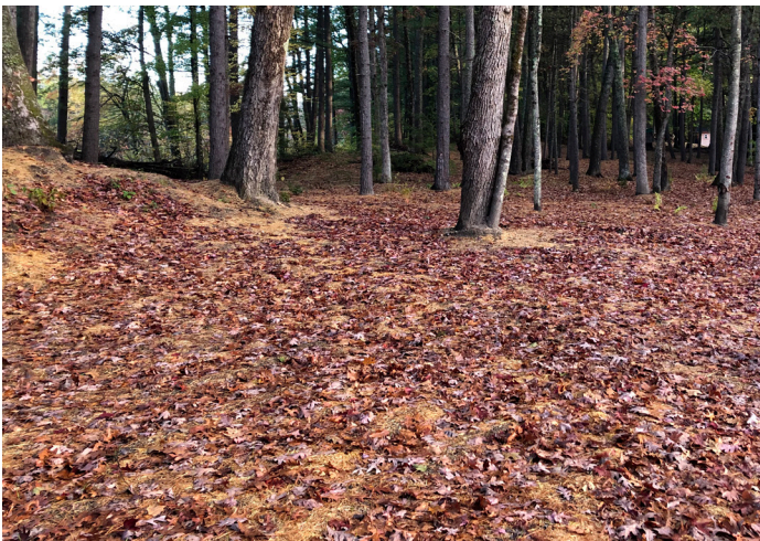
Completed excavation and backfill at a residential property located near the Site.

In August and September of 2021, EPA collected soil samples, surface water samples, and groundwater samples from the former shooting range, the Groton Senior Center, and adjacent residential properties. Sampling results found lead and arsenic in soil samples above the EPA Removal Management Levels for residential properties. EPA determined that an imminent hazard to public health and the environment was present at the Site. To address the threat presented by the contamination present in the surface soil, EPA conducted a removal action, which was completed in October 2023.