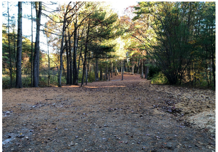
Completed excavation and backfill of the former shooting range.